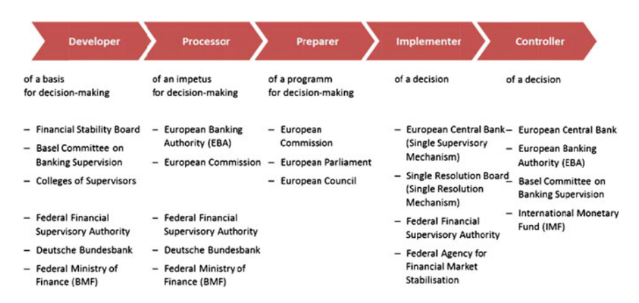
Fig. 4.2 Types of administrative organisation in the field of banking regulation

Impulses at international level are taken at European level by the European Commission and the European Banking Authority and are processed on the basis of their institutional arrangements. The control density results from the European Treaties for the European Commission and Regulation (EU) No 1093/2010 establishing the European Banking Authority—they provide decision-making structures and procedures. Thus, the impulses are either processed to proposals for directives and regulations by the European Commission or to technical regulatory and implementing standards by the European Banking Authority at international