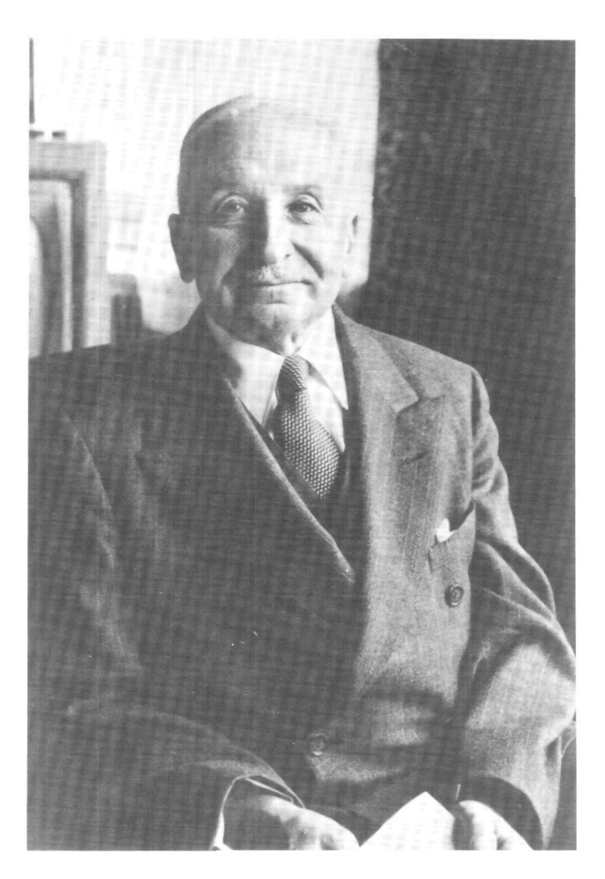
Ludwig von Mises 1881 — 1973