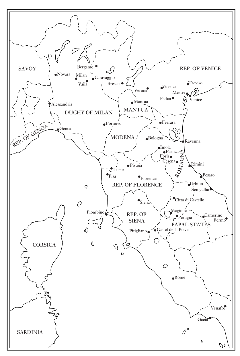
Northern and central Italy, c.1500