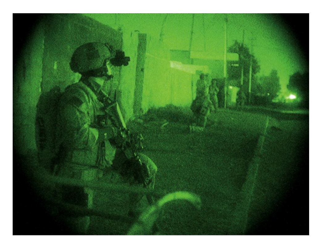
SEAL Team 6 operators during a night mission in Afghanistan.