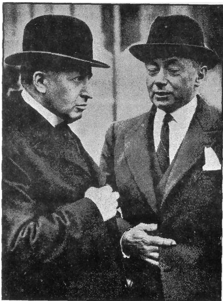
Georges Mandel [Jeroboam Rothschild] and Paul Reynaud.