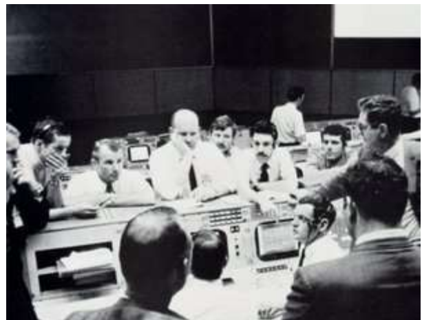
U.S.-Cuba Trade and Economic Council, Inc.