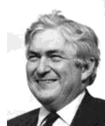
David Rockefeller Henry Kissinger Peter Carrington James Wolfensohn

"We are grateful to the Washington Post, the New York Times, Time Magazine and other great publications whose directors have attended our meetings and respected their promises of discretion for almost forty years." He went on to explain: "It would have been impossible for us to develop our plan for the world if we had been subjected to the lights of publicity during those years. But, the world is more sophisticated and prepared to march towards a world government. The supernational sovereignty of an intellectual elite and world bankers is surely preferable to the national autodetermination practiced in past centuries."