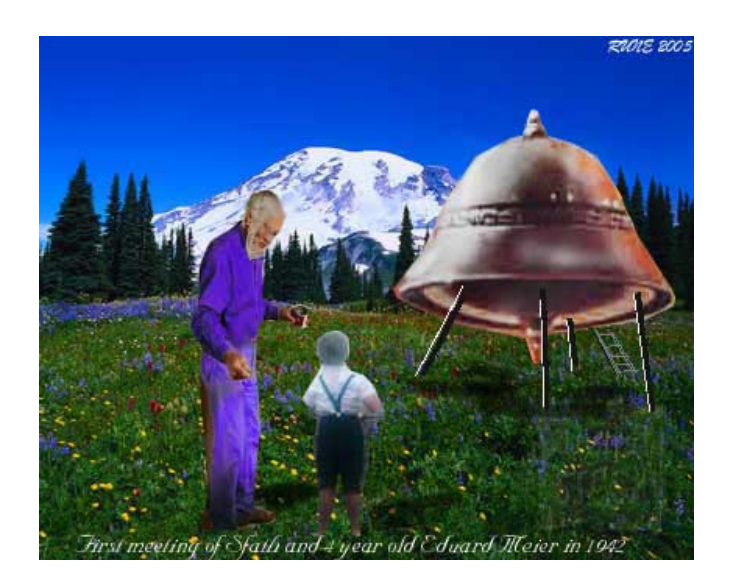
artpicture up is idea of the first Sfath-contact in-42. Picture down and topmost left of JimNichols