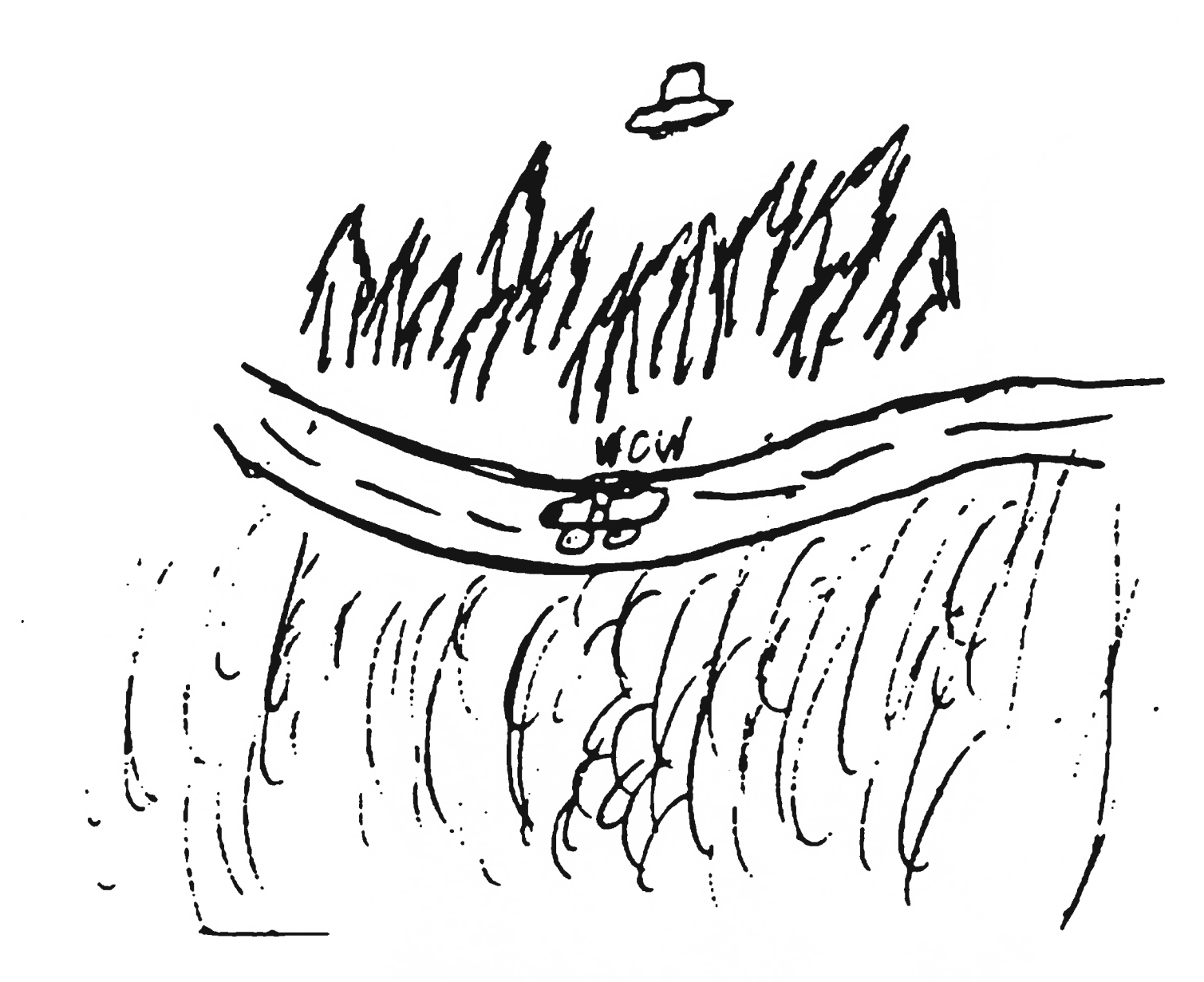
SIGHTING AND ABDUCTION NEAR MAPLE VALLEY