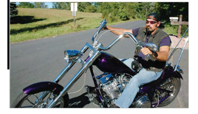
I designed and built this bike to try to get back the feeling of freedom.