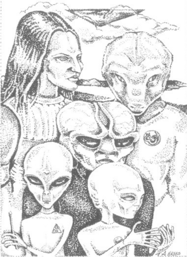
Intruders, top to bottom: Sirian Anunnaki, Dracos (Drakon and Human Hybrid), Zephelium (Administrators of Zeta), Zeta Grey-Rigelian, Rutilia (Zeta and Dracos hybrid, or EBE)