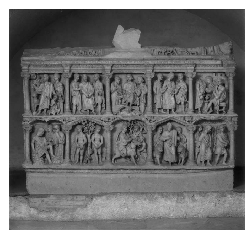
Figure 21.3 The sarcophagus of Junius Bassus from Rome. Marble, AD 359. This is a grand double register sarcophagus with Old and New Testament scenes in the intercolumniations. St Peter's Basilica, Rome.

Here, far from directly relating to the elegantly executed imagery of an unusually grand sarcophagus in the way the Aper poem plays off the iconography of his monument, the two inscriptions (prose and verse) strike different but equally personal notes that contrast with the universal Christian message of the visual imagery. Bassus the man is given his curriculum vitae and his dates in the prose inscription on the rim, while the poem elevates him through its spectacular imagery of weeping into a paragon of the lamented deceased. The last two lines, elegantly alluding to Propertius 2.34.65 (on how all former writers should yield their place to Vergil) play on the pun in Bassus' name ('low' in colloquial Latin) by referring to the heights that must give way to him and the pinnacle he has achieved in death. Effectively, the personal and Rome-centred account of a dignitary who had proved a loyal servant to his city is used to supplement the Christian universalism of the main iconography. The literary genre of the epigram and its tropes, but also the very act of its epigraphic incision, work to provide a highly traditional