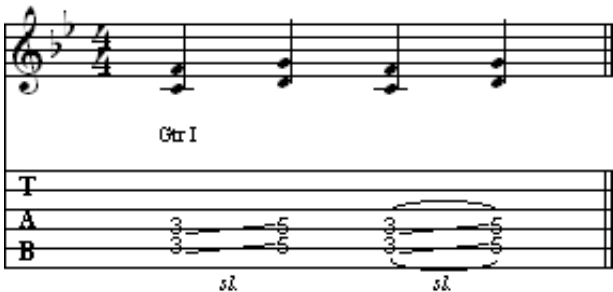
Guitar Slide, by Furrykef (presumed GFDL)

The slide is one of the simplest guitar techniques. There are two kinds of slides: shift slides and legato slides. In a shift slide, a note is fretted, then the fretting finger slides up or down to a different fret, and the string is struck again. A legato slide differs in that the string is struck only for the first note.