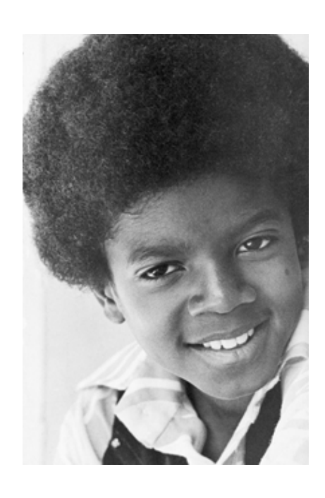
Michael Jackson at the age of twelve in 1970.