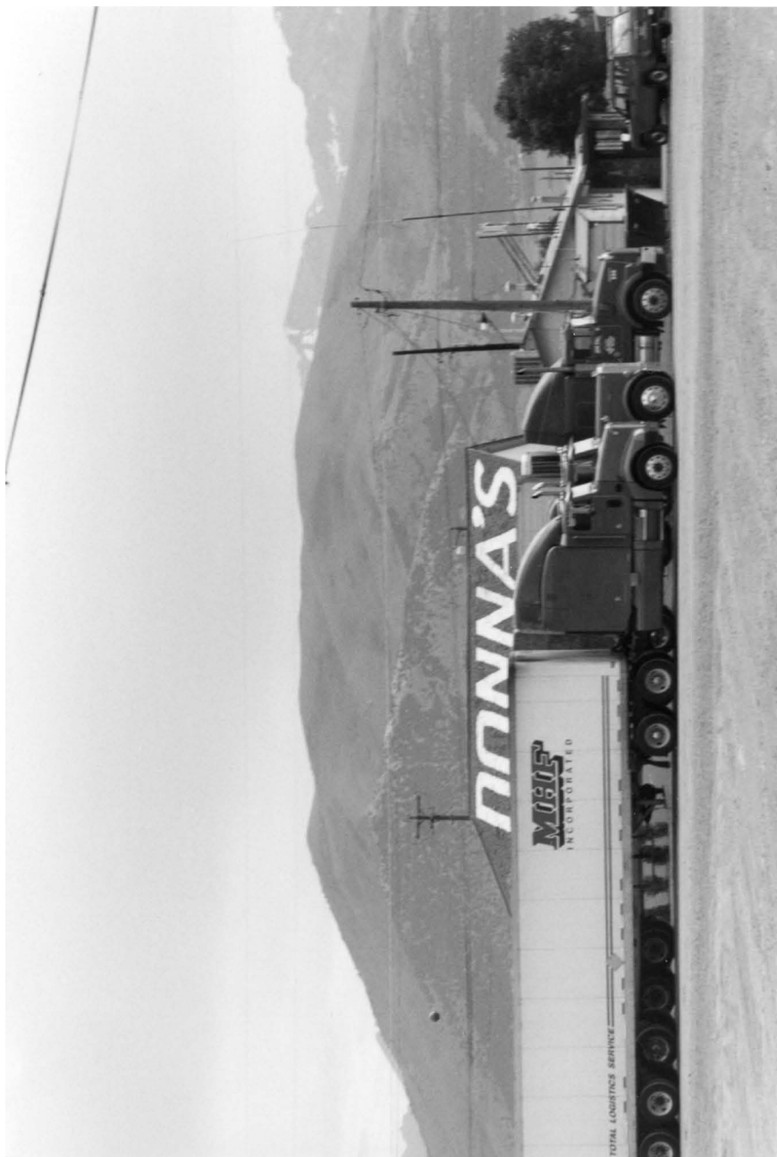
Figure 4.1 Like many brothels along highways, Donna's in Wells on Highway 80 relies on truckers for business as well as local ranchers, and increasingly tourists.