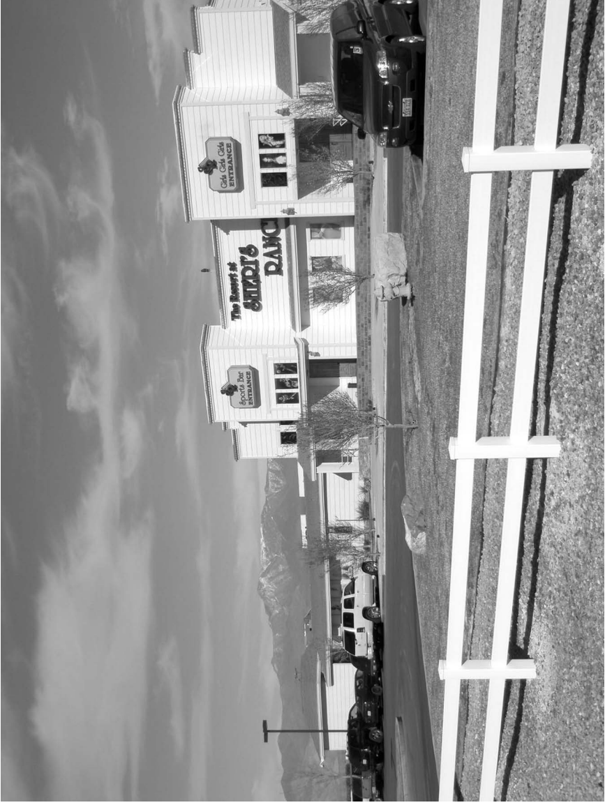
Figure 4.5 Sheri's Ranch in Pahrump is an example of the upscale, open look suburban brothels are adopting to attract more mainstream tourists as customers.