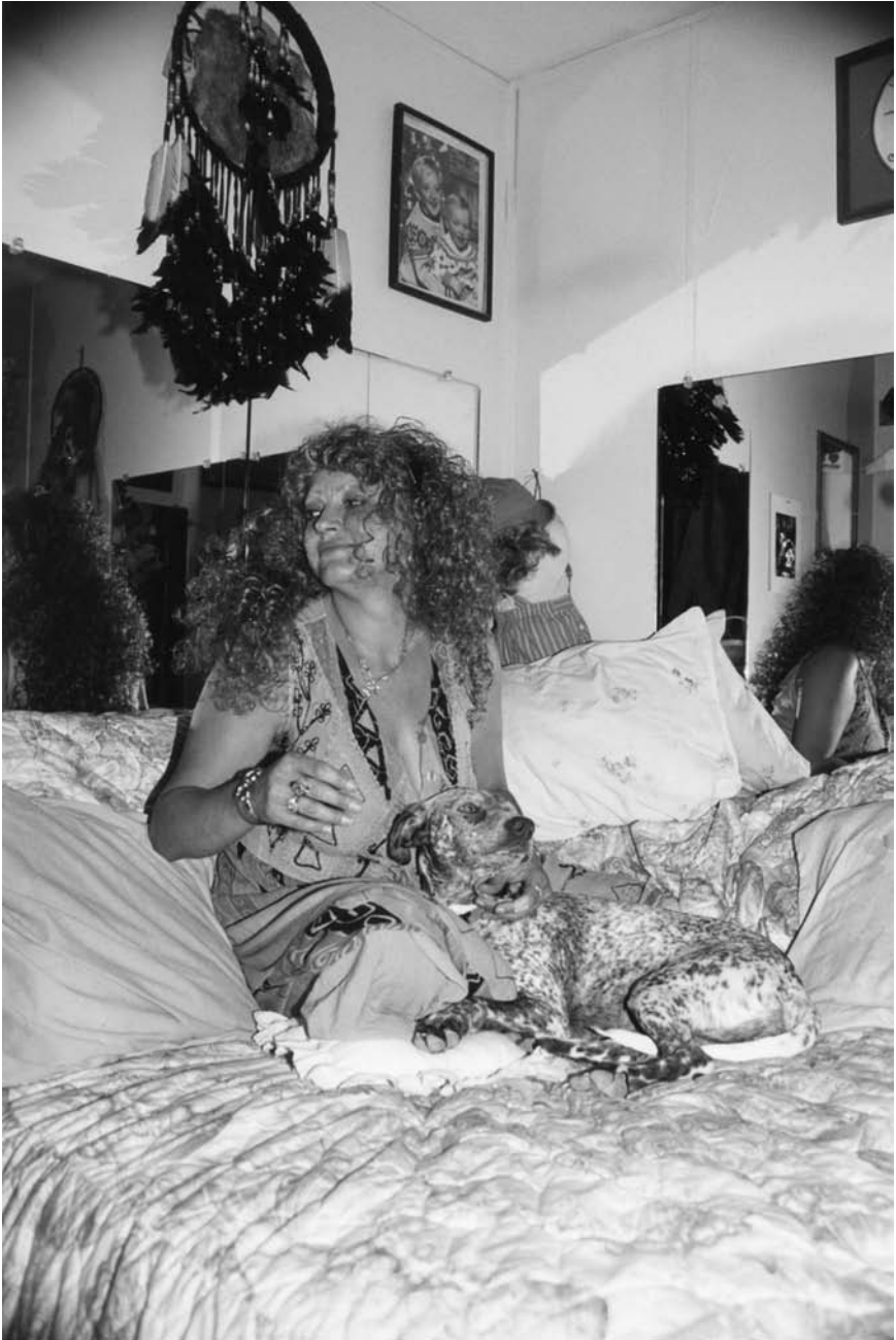
Figure 6.1 Strawberry Shortcake lives and works in her bedroom. Most women decorate their rooms with pictures of children, reminders from home, as well as items that reflect their personalities.