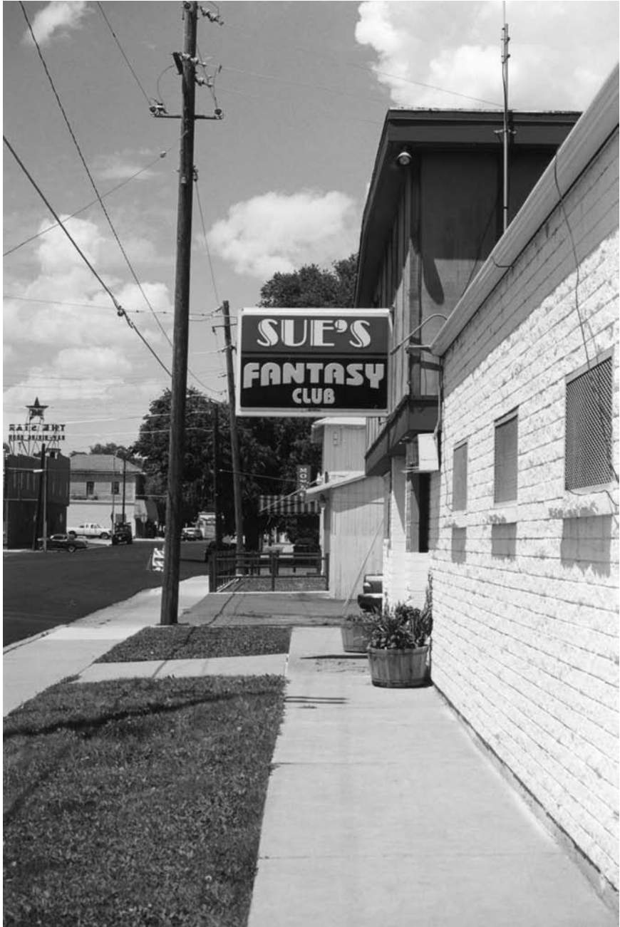
Figure 4.2 The five brothels in Elko are clustered in a neighborhood just off Main Street. Here you can see Mona's and Sue's Fantasy Club. Just around the corner are the others. Their signs are relatively small and look nothing like venues for sexual commerce in the larger resort districts.