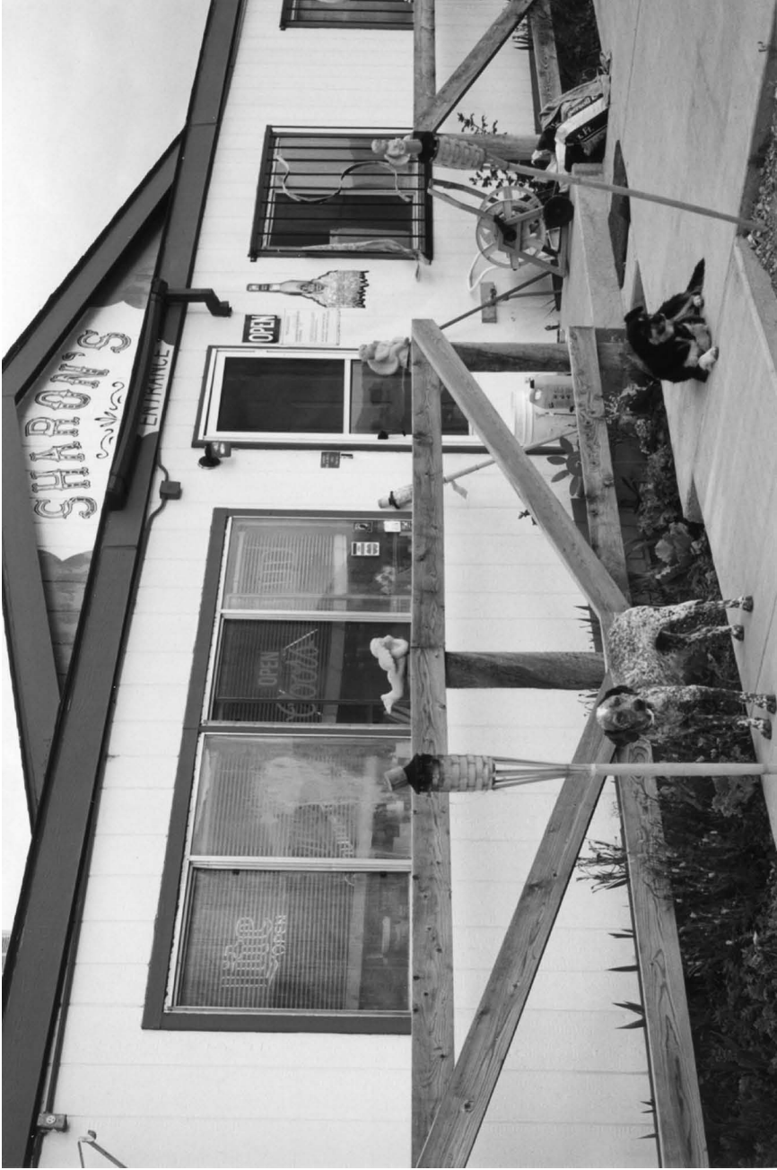
Figure 4.3 Sharon's Place in Carlin, like many brothels, was originally a single trailer that has since been expanded.