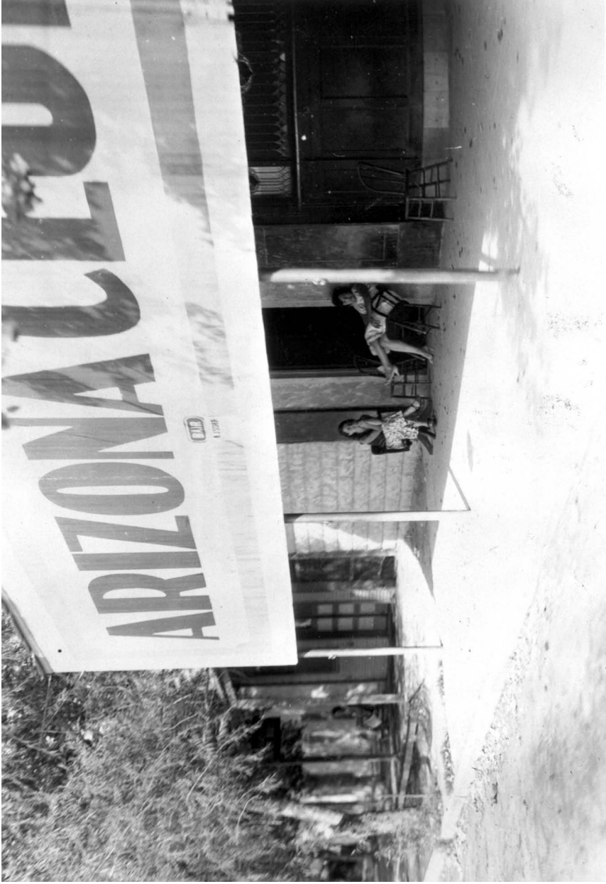
Figure 3.1 Open prostitution was a key component of Las Vegas' early tourist industry. Above are sex workers at Las Vegas' Arizona Club, Las Vegas, Nevada, 1931 [Nevada State Museum, Las Vegas (Winthrop Davis, photographer)]. Courtesy of UNLV Special Collections.