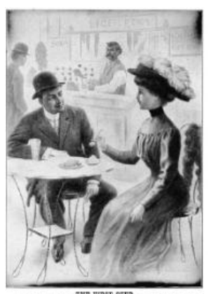
he cream parkers of the sity and first above combined, largely one by foreigners, are the places where sources of gifts have taken their first step downward. Does her sucher know the sharacter of the place and file most the in with?