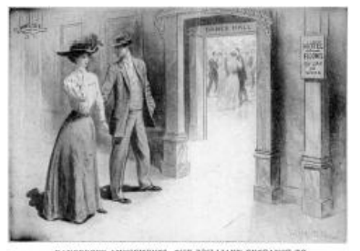
DANGERGUS ANGEMENTS...THE SEELLIANT ENTRANCE TO HEEL. ITSELD. Young girls who have fanced at bone a little are attracted by the blazing lights gainty and apparent buspiness of the "dance balls." which is many instructs lead to their downfall.