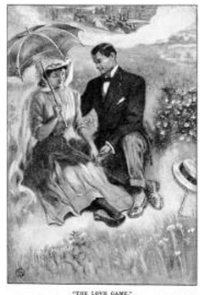
"THE LOVE GAME." A purple wireling "the love game," assumes the role of a banker's on switch and feath ar. He leadership the girts by stories of great wealth and prelime, the upper part of the potent above the put time premise."