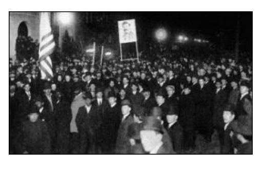
Gypsy Smith's parade through the Levee.