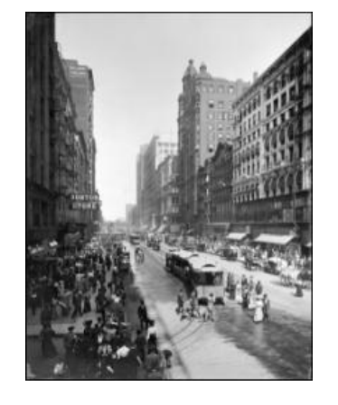
State Street in Chicago, circa 1907.