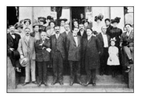
Members of the Purity Congress.