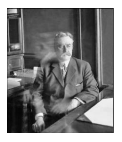
Mayor Carter Harrison II.