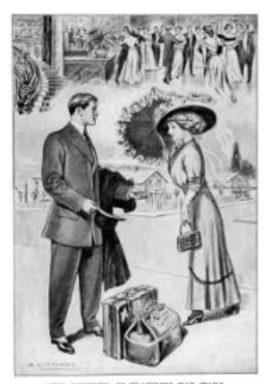
"THE DEFINER, OR TRAVELING HAN WAY." When a punker strike as Turni contentity to those work very measurity, he comey one knows that he is a stringer. He power as a drummer or tearning man, and nests the girts in this way, promising a fee situal table, parties, wit. Once is the govern that he had.