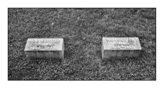
The Everleigh sisters at rest.