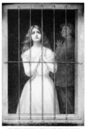
"MY GOD! IF ONLY I COULD OUT OUT OF HERE!" The midright shriek of a young girl in the vice district of a large sity, heard by two worthy man, started a crussele which resulted in clining up the dose of classes in that city.