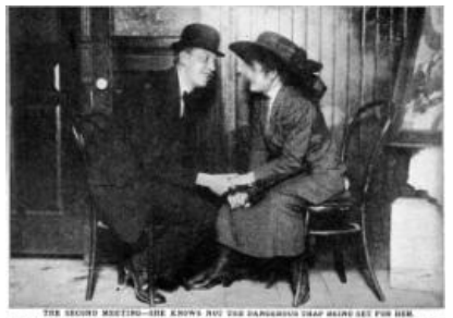
THE SECOND MEETING—THE KNOWN AND THE DAMPHRICA CHAP MEAN REF FOR HER. The emeth temporal within fails of his affection and analysis have the how. He prints a beautiful potent of how happy they will be the temporary and promises to make him one part of these may be a few or and the second of the second of the second of the second of the second of the second of the second of the second of the second of the second of the second of the second of the second of the second of the second of the second of the second of the second of the second of the second of the second of the second of the second of the second of the second of the second of the second of the second of the second of the second of the second of the second of the second of the second of the second of the second of the second of the second of the second of the second of the second of the second of the second of the second of the second of the second of the second of the second of the second of the second of the second of the second of the second of the second of the second of the second of the second of the second of the second of the second of the second of the second of the second of the second of the second of the second of the second of the second of the second of the second of the second of the second of the second of the second of the second of the second of the second of the second of the second of the second of the second of the second of the second of the second of the second of the second of the second of the second of the second of the second of the second of the second of the second of the second of the second of the second of the second of the second of the second of the second of the second of the second of the second of the second of the second of the second of the second of the second of the second of the second of the second of the second of the second of the second of the second of the second of the second of the second of the second of the second of the second of the second of the second of the second of the second of the second of the