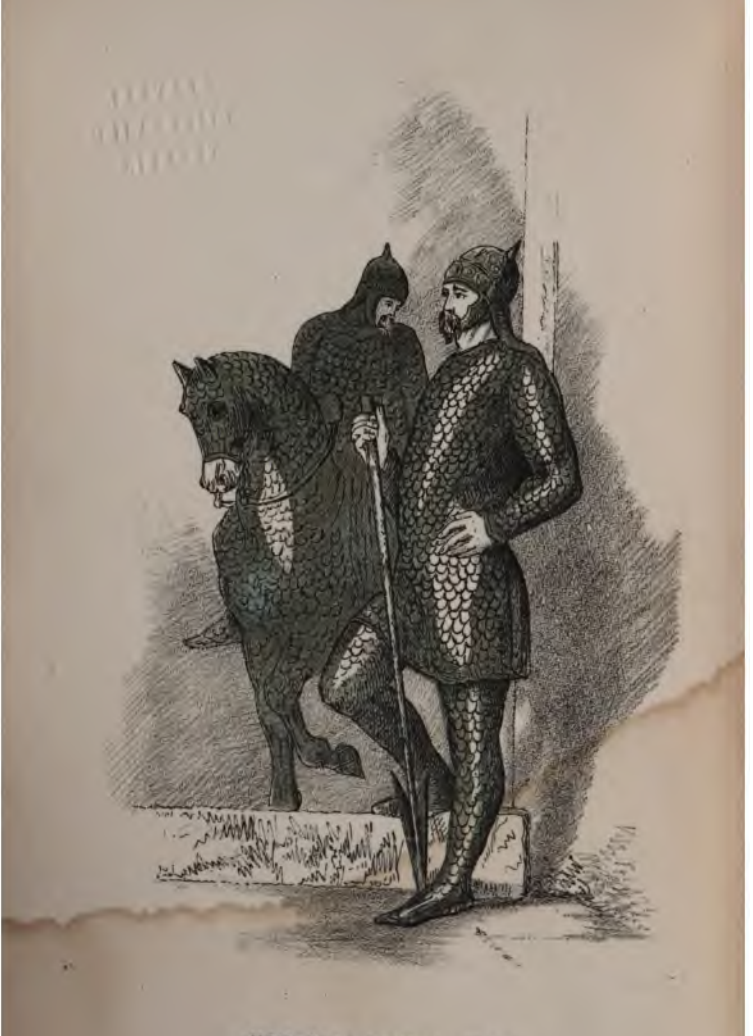
MAIL-CLAD FEUDAL CHIEFS.