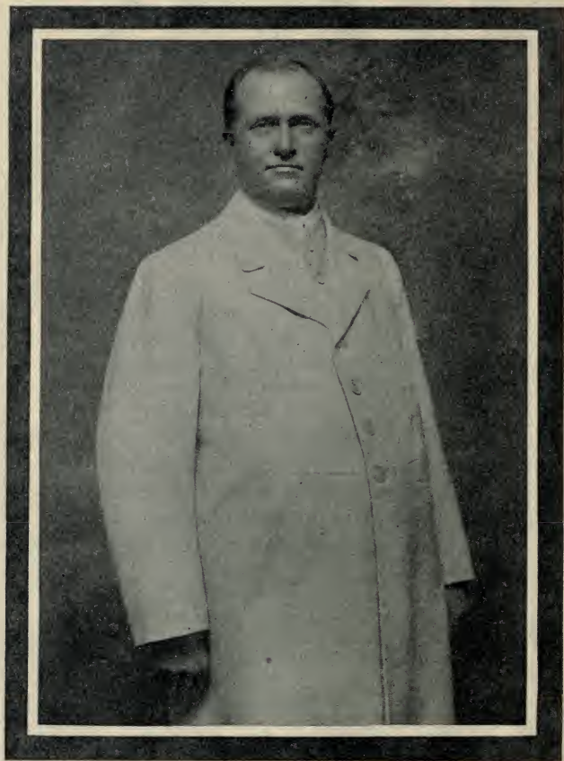
THE GREAT NEWOLOGIST