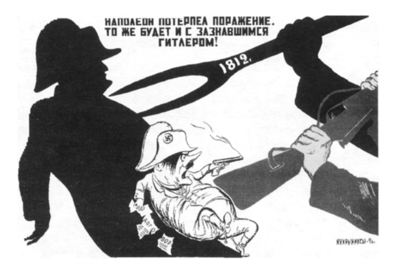
Caption: Napoleon suffered defeat and so will the conceited Hitler!

enemy garrisons, to prevent the retreating enemy from burning down our villages, to help the advancing Red Army, heart and soul, and by all possible means.