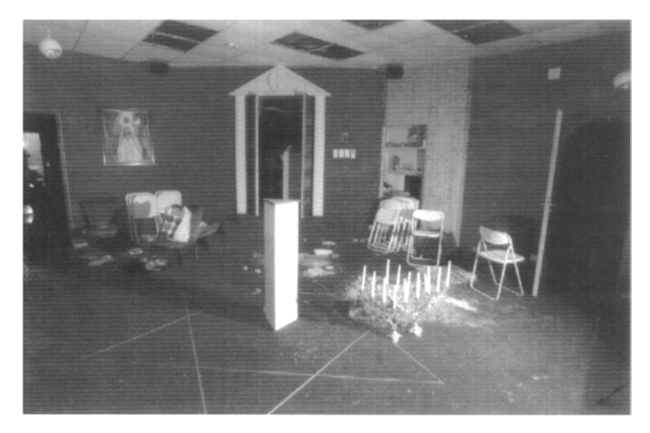
Figure 4.1 A secret sanctum of the Solar Temple in the basement of a farmhouse in the village of Cheiry, Switzerland, where the authorities discovered the bodies of eighteen people on the morning of 5 October 1994