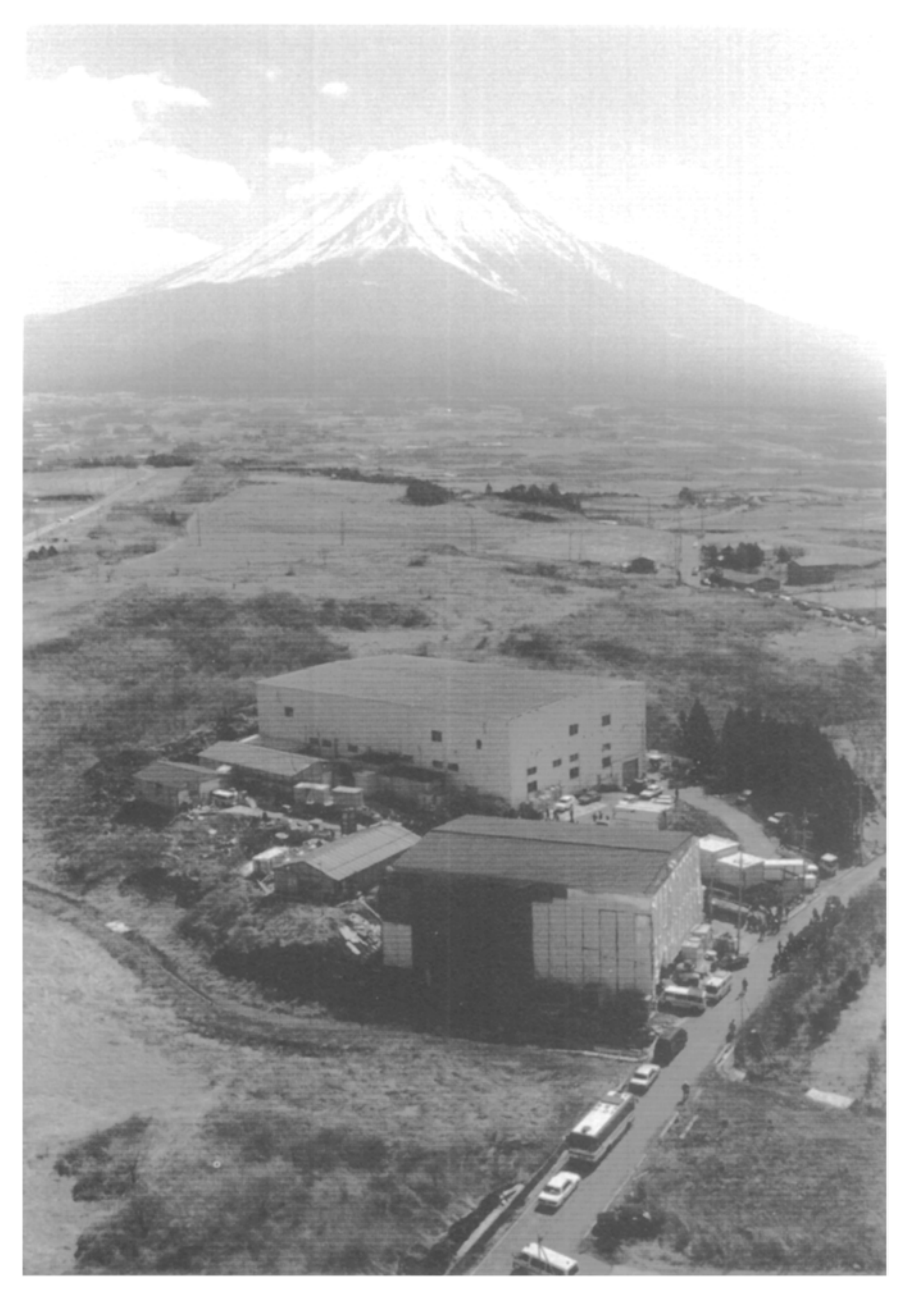
Figure 3.1 The Kamikuishiki compound of Aum Shinrikyō, with Mount Fuji in the background. It was here that many of the group's clandestine acts of violence took place, and that sarin was manufactured.