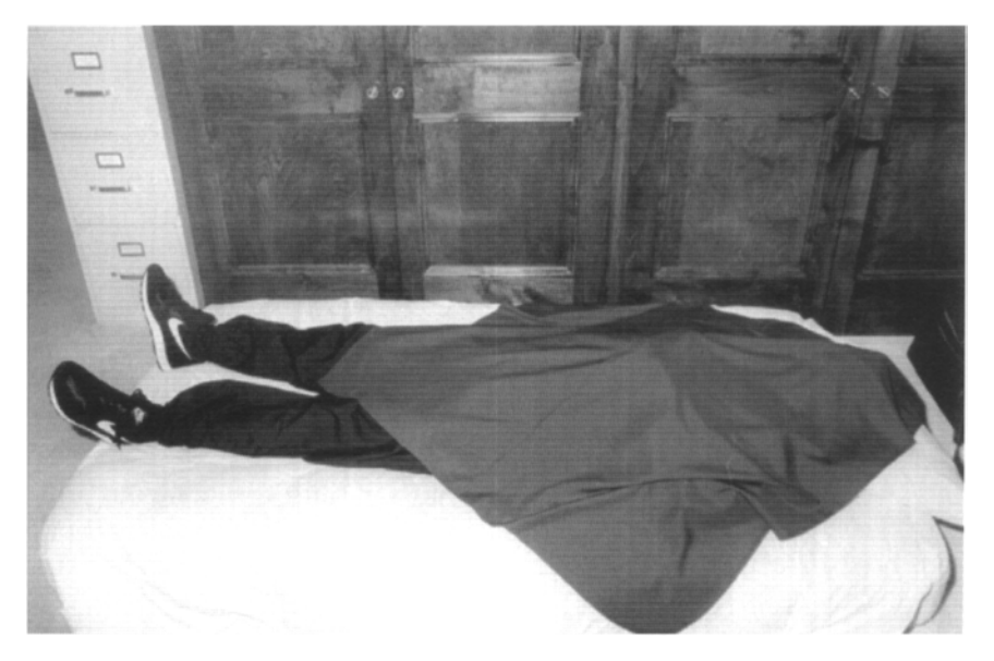
Figure 5.2 One of thirty-nine bodies found in a house in Rancho Santa Fe, California, as photographed by the San Diego County Sheriff's Department on 26 March 1997. Followers of Do—and the previously deceased Ti—had prepared for years to reach the Next Evolutionary Level Above Human.