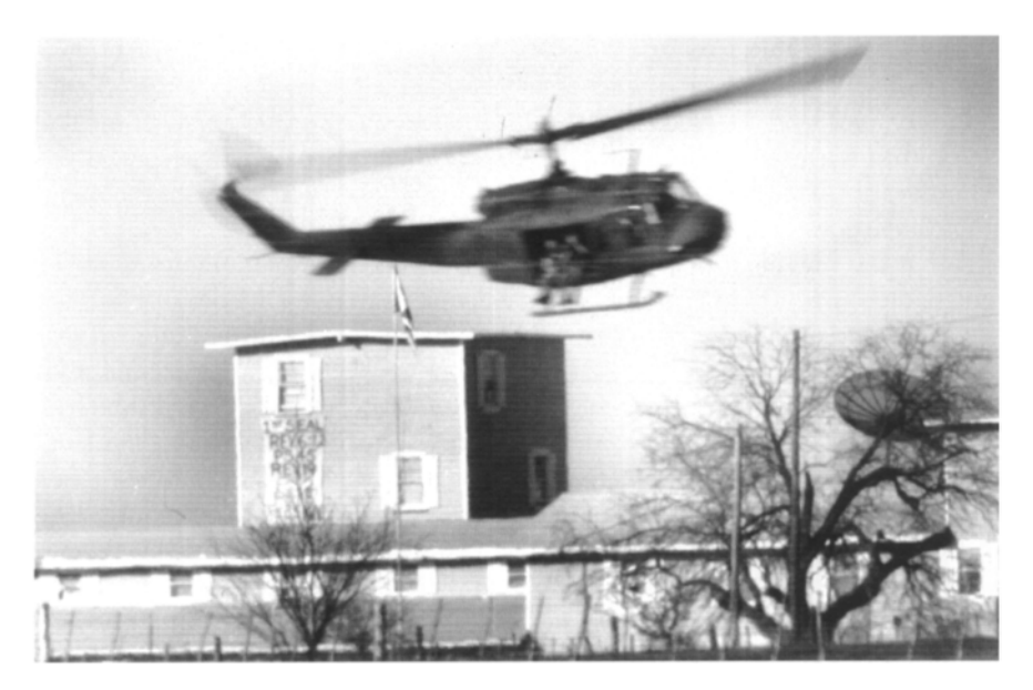
Figure 2.2 A US government helicopter makes a low pass over the Mount Carmel compound during the standoff in early April 1993. Cut off from ordinary communication with the outside world, Davidian members have unfurled a banner that reads "1st seal, Rev 6:12, Ps 45, Rev 19, Ps 2, Ps 18, Ps 35, KJV," referring to chapters and verses of the King James version of the Bible.