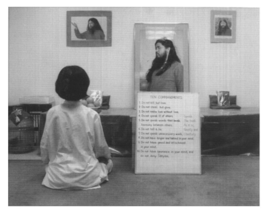
Figure 3.2 On 25 March 1995, five days after the Tokyo sarin attack, a devotee in the sect's New York City headquarters sits facing photographs of Asahara Shōkō and a sign that lists as the first of its ten commandments, "Do not kill, but love." The vast majority of sect members had no knowledge of the violent acts perpetrated by the group, and many continue to proclaim its innocence.