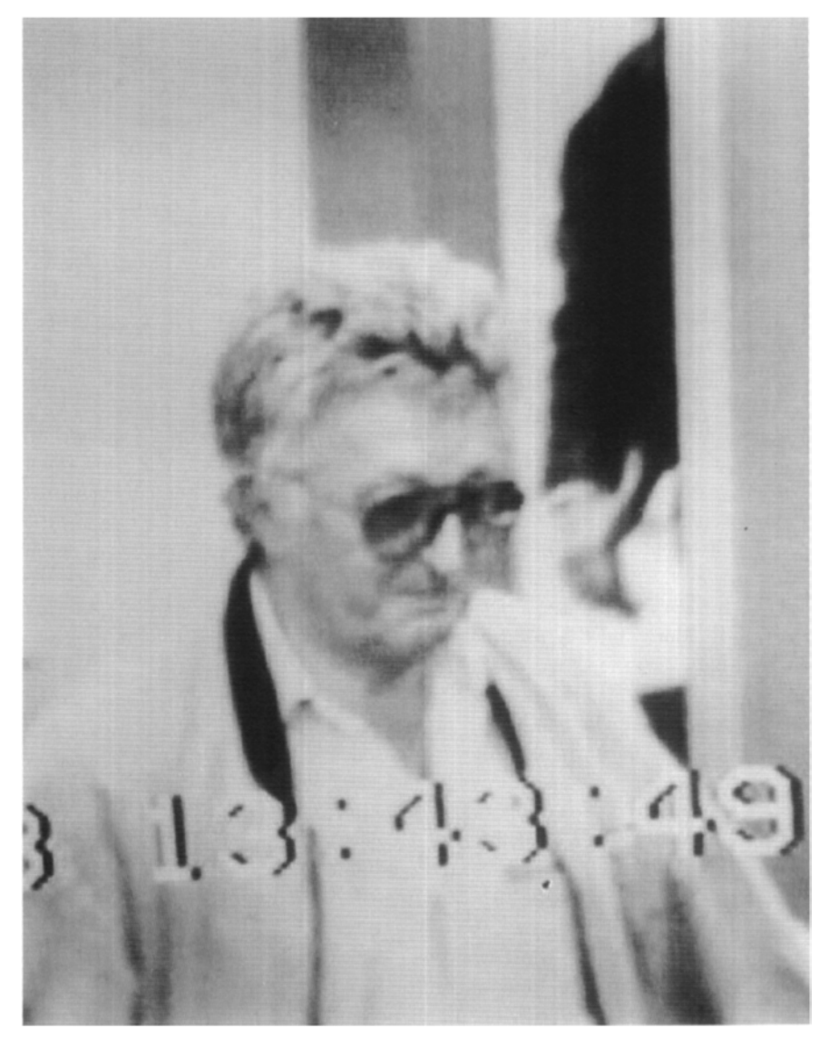
Figure 4.3 A surveillance photo of Joseph DiMambro arriving at Brisbane airport, Australia, late in 1993, released by the Australian Federal Police. DiMambro did not know about the money laundering investigation that was under way, but the Transit letters clearly indicate that Temple members believed themselves to be the object of a conspiracy that included government agencies.