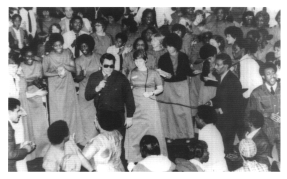
Figure 1.1 Jim Jones at a Peoples Temple service during the early 1970s in a publicity photograph that emphasizes the preacher's charismatic attraction to his followers.