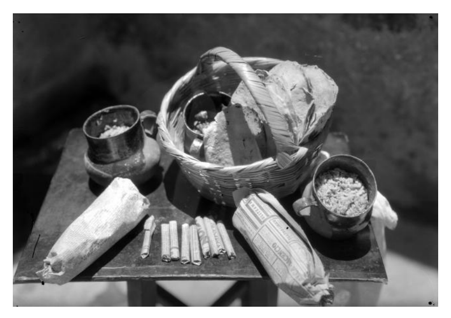
Figure 1. Basket of confiscated goods. Serie Mariguana, opio, y drogas, ca. 1935, 142917, Casasola, Mexico City, Fototeca Nacional del Instituto Nacional de Anthropología e Historia (INAH), Pachuca, Hidalgo.

elitist views of criminal behavior. His early work did not disappear with the Mexican Revolution; instead, it found a growing audience that considered crime and criminality a detriment to progress and development. As Mexicans struggled to redefine national identity after the Porfiriato, a new narrative that associated depravity with race and ethnicity inserted social hygiene as a central component of nation building. Ironically, despite views that the Porfirian era triggered excesses and vice, many of the proponents of social hygiene programs employed similar ideas and concepts from the era that they criticized. In the midst of the chaos of war, certain Mexican states attempted to control the production and consumption of narcotics and alcohol. In the wake of the 1912 International Opium Conference, Mexican leaders too sought to respond to the global shift to control production. By 1916, the Constitutionalists, who had gained control of the government, issued the first federal laws controlling narcotics distribution and use.<sup>24</sup> President and leader of the Constitutionalists, Venustiano Carranza, decreed it illegal to produce, consume, and sell narcotics throughout Mexico. The