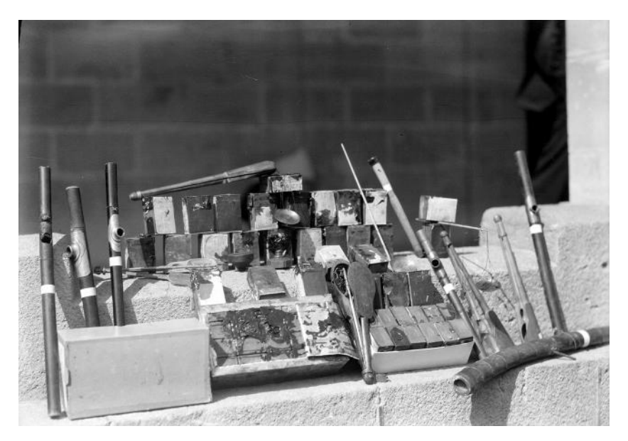
Figure 3. Pipes and opium. Serie Mariguana, opio, y drogas, ca.1935, 142913, Casasola, Mexico City, Fototeca Nacional del Instituto Nacional de Anthropología e Historia (INAH), Pachuca, Hidalgo.

requested permission to deport all the men. The arrest papers specified that all the men hailed from Canton, but this was only the port city from which they had left China and may not have been their hometown. Half of them were married. Only one out the ninety-nine had a previous arrest, for gambling. The other ninety-eight displayed buena conducta (good conduct), which meant that they had no criminal records, were hard working, and owed no debts.<sup>88</sup>