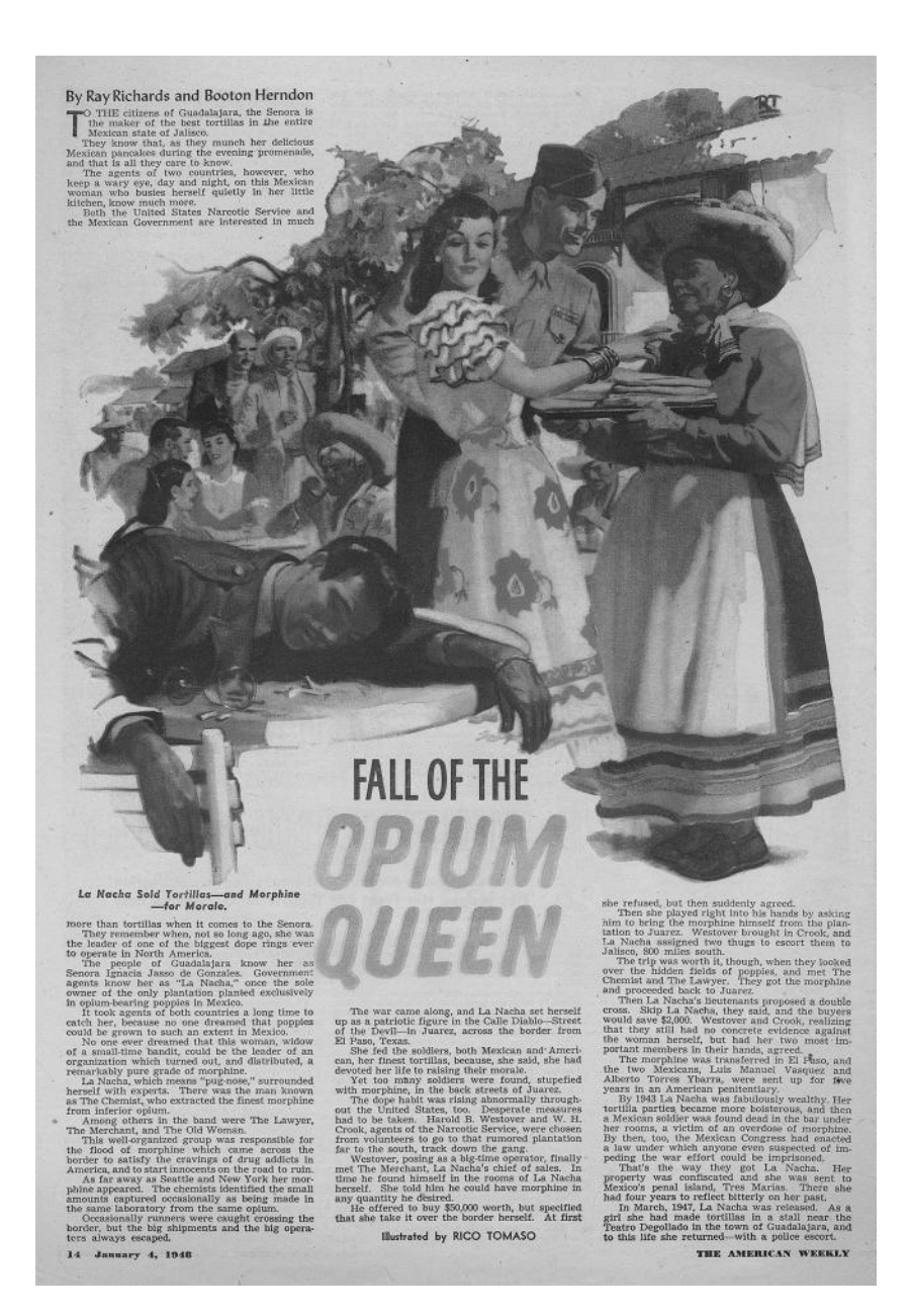
Figure 19. "Fall of the Opium Queen," American Weekly .