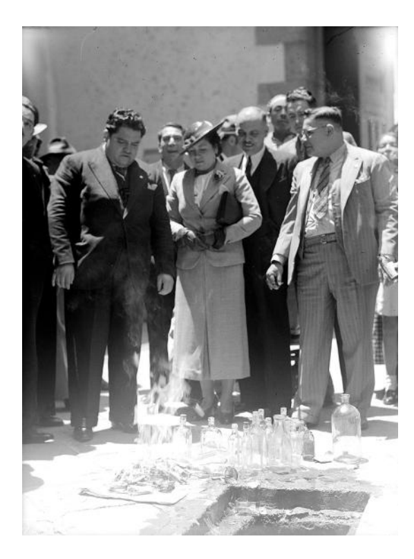
Figure 7. Public prosecutors examining drugs. Serie Mariguana, opio, y drogas, ca. 1935, 142937, Casasola, Mexico City, Fototeca Nacional del Instituto Nacional de Anthropología e Historia (INAH), Pachuca, Hidalgo.

displacement through violence or been deprived of their traditional means of earning a living. The traditional work of women may have been valued within the family, but contraband became a way to economically survive. It is no mystery why or how women engaged in illegal trafficking.