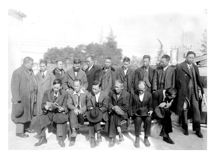
Figure 4. Public officials and Chinese men who had been detained. Serie Mariguana, opio, y drogas, ca. 1925, 142899, Casasola, Mexico City, Fototeca Nacional del Instituto Nacional de Anthropología e Historia (INAH), Pachuca, Hidalgo.

ranged from quite young (teenage) to elderly. The lack of evidence of wrong-doing suggests that the raids and arrests took place in clubs or aid societies that pro-Raza groups easily identified rather than in shady alleged opium dens. The lack of drug paraphernalia also casts doubt on claims of rampant Chinese drug use. Thus, Chen and other diplomats had to defend not only those who had left China, but China itself from charges that it was a nation of opium addicts, white slavers, and shifty businesspeople setting out to exploit native masses around the world.