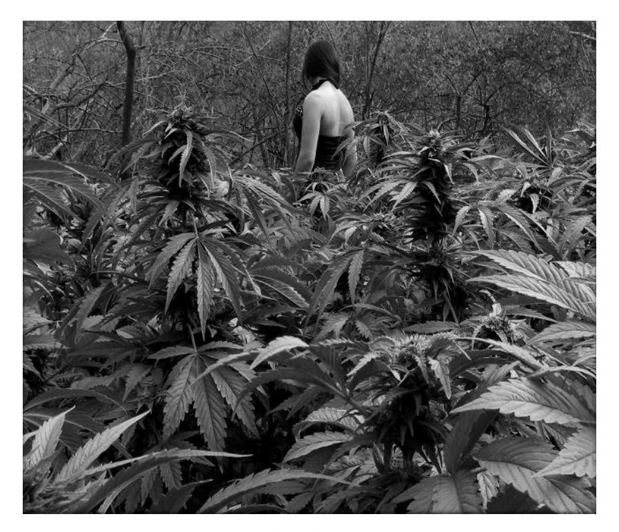
Figure 22. Woman in a marijuana field.

more important masculine figures such as players in the Mexican Mafia, León's adult sons, and Garnica's cartel connections, but the truth is very different.