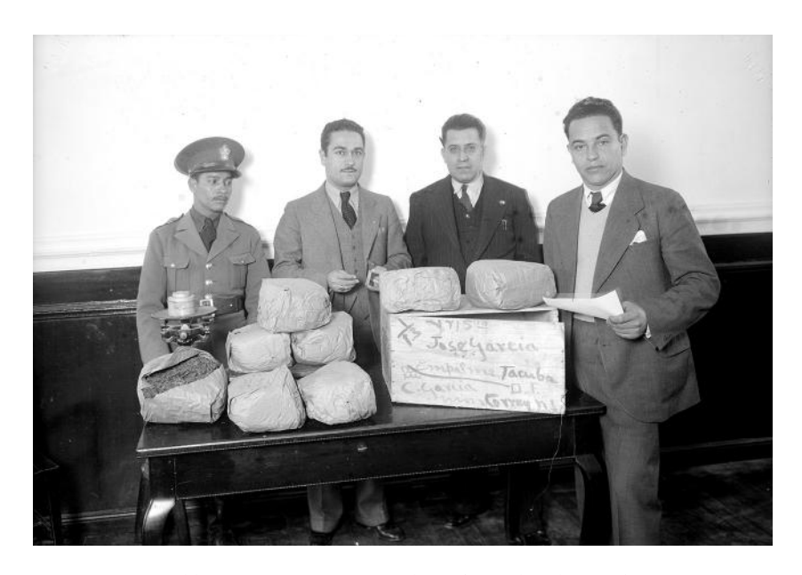
Figure 5. Public prosecutors posing with confiscated packages of marijuana.