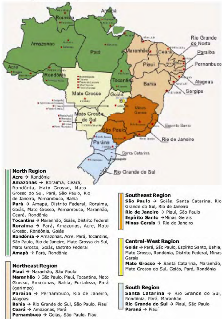
MAP 1 INTERSTATE ROUTES OF THE TRAFFICKING IN WOMEN, CHILDREN AND ADOLESCENTS FOR SEXUAL EXPLOITATION (1996 – 2002)