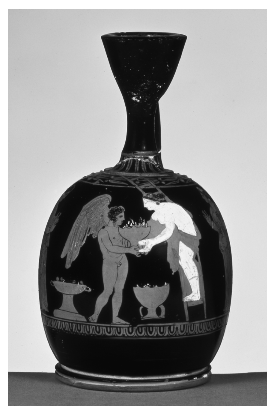
Figure 1. Aphrodite performing the Adonia. Lekythos, ca. 380 B.C.E. Badisches Landesmuseum B39. Reproduced with permission.