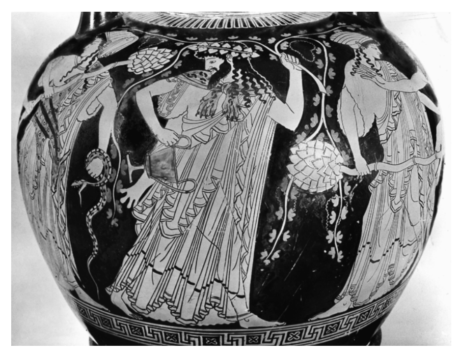
Figure 9. Dionysos and maenads. Pointed amphora by the Kleophrades Painter. ARV 182/6, Munich 2344.

ties of sexually hostile encounters between maenad and satyr. Two scenes seem to have caught the early fifth-century imagination: that of the satyrs who creep up on or more actively molest a sleeping maenad, and that of the maenad who defends herself with a strategically aimed thyrsus. A significant characteristic of these scenes is their momentary quality; given that they cannot tell a complete narrative, and that "the issue is in doubt," the viewer is emphatically drawn into supplying the discursive content of the scene. A cup by Makron from about 480 B.C.E. (ARV461/36) shows on one side a sleeping maenad accosted by satyrs, but on the other side a maenad who starts to get up and brandish her thyrsus. There is no way to decide whether or not the satyrs succeed in their harassing mission. An earlier amphora by Oltos (ARV53/2) entrusts the narrative even more teasingly to the