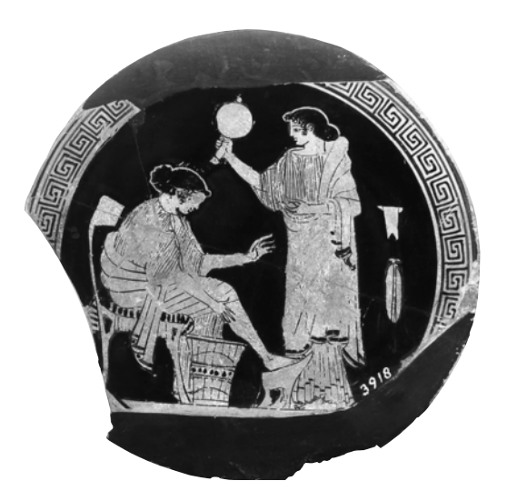
Figure 5. Women working wool; on the exterior of this cup, which is damaged, is visible a woman at an altar. Cup by the Steiglitz Painter. ARV 827/7, Florence 3918.

inate on cups, and subsequently they show some migration to the small pelike and squat lekythos, which are also "female" perfume vases. While scenes with more than one figure at the altar, male or female, appear on many types of vase, some of these too seem designed for women. The pelikai in particular always show women as well as men and sometimes show only a group of women. ARV267/1, for instance, shows on one side two women at an altar, and on the other two women who approach with a phiale, a shallow cup from which libations were poured. A cup by the Steiglitz Painter (ARV827/7) shows on its damaged exterior several women and an altar, while the interior is occupied by an image of two women, one of whom cards wool on her knee while the other holds—according to your preference—a mirror or a distaff (see fig. 5). This vessel as a whole can be read, like others that feature a plurality of women with different attributes, as mobilizing various versions of femininity, among which it is possible to see here ritual activity at the altar emphasized to the same extent as wool working.