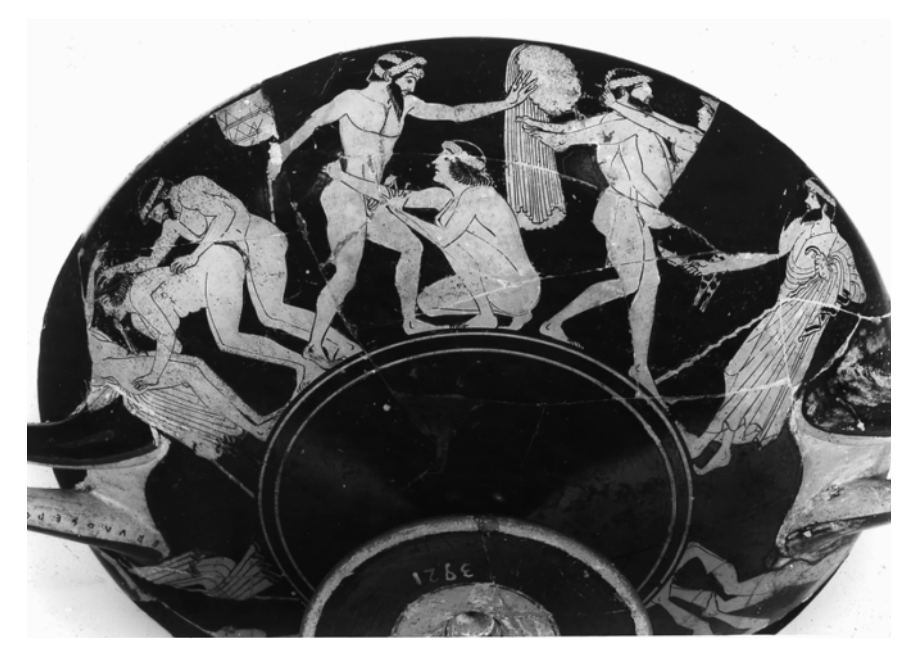
Figure 2. Men and prostitutes. Exterior of a cup by the Brygos Painter. ARV 372/31, Florence 3921.

desire to provide a sacrifice. What is dangerous, however, is how the action of the unruly woman can ultimately prove the downfall of the well-regulated man, particularly when it is seconded by the legal action of the priestess.