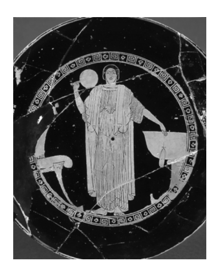
Figure 3. A woman holding a mirror, between a basin and a bed. Interior of a red-figure cup by Douris. ARV 432/60, Musée du Louvre S 1350. Photo RMN-Hervé Lewandowski. Reproduced with permission.