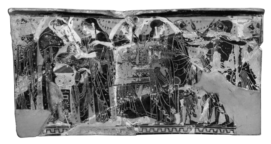
Figure 7. Scene of prothesis . Funerary plaque, black-figure, ca. 500 B.C.E., attributed to the Painter of Sappho. Louvre MNB 905.

gather, among whom women sometimes seem to lament more expressively than men, raising two hands to their heads instead of one. 106 Black- and redfigure funerary vessels of the sixth and fifth centuries generally convene fewer people and concentrate on the more private components of the burial process. Since the vase paintings seem to eschew the procession to the tomb and the public scenes of lamentation, especially by women, in favor of a concentration on the prothesis , the laying out of the body at home, many scholars have suggested that the new style of scene registers the pressure from Solon's funerary laws (discussed in chapter 1). One ceramic plaque even identifies the mourners not by name but by relationship to the deceased, as if to show that they are family members and thus in conformity with the legislation restricting mourning to close relatives (see fig. 7).<sup>107</sup> In the context of this legislation, however, it is significant that the scenes of mourning that do appear on vases continue to award a special prominence to women, placing them nearer to the corpse and allotting to them the more dramatic expressions of grief. Even though funerary laws deliberately tried to deemphasize the role of women as mourners, the ceramics with which families actually discharged their responsibilities toward the dead can be seen to reassert the importance of women in the mourning process.