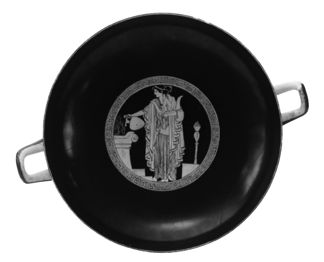
Figure 6. Woman pouring offerings. Makron, red-figure kylix (tondo), ca. 480 B.C. Wheel-thrown, slip-decorated earthenware. H. 4\frac{7}{16} in., diam. at lip 11\frac{5}{16} in., diam. with handles 14\frac{1}{4} in. Toledo Museum of Art, Toledo, Ohio. Purchased with funds from the Libbey Endowment, Gift of Edward Drummond Libbey, acc. no. 1972.55.

wars, then, that women emerge into ceramic representation as ritual practitioners, and, as we have seen, the scenes of their cult activity are often paired with those of men's military preparations. We might conclude that part of the vases' project is to negotiate a productive place for women in the newly democratic state, which can be effectively achieved by stressing not only women's contributions to child rearing and textile manufacture but also their important role in ritual practice.