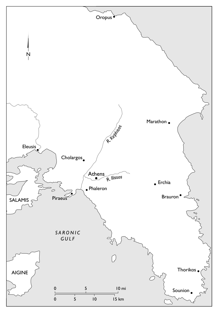
Attica. Some sites of women's ritual practice.