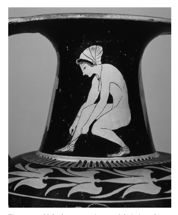
Figure 10. Naked woman tying sandal. Attic redfigure amphora, 525–515 B.C.E., by Oltos. ARV 53/2, Louvre G2.

viewer. On each side a hopeful satyr grabs at a brawny maenad well equipped to resist his advances; neither image is conclusive about his success or failure. On the neck of the amphora, the question of the direction of the narrative is re-posed: a naked woman, presumably a hetaira , is tying her sandal (see fig. 10). Or is she untying it? Pornography here may well be in the eye of the beholder.