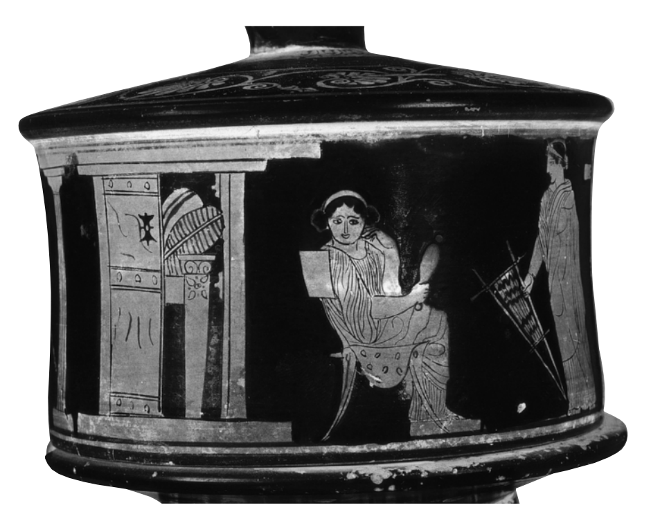
Figure 4. A woman holding a mirror, facing the viewer. Red-figure pyxis, ca. 430 B.C.E., by the Painter of the Centauromachy. ARV 1094/104, Louvre CA 587. Photo RMN-Chuzeville. Reproduced with permission.