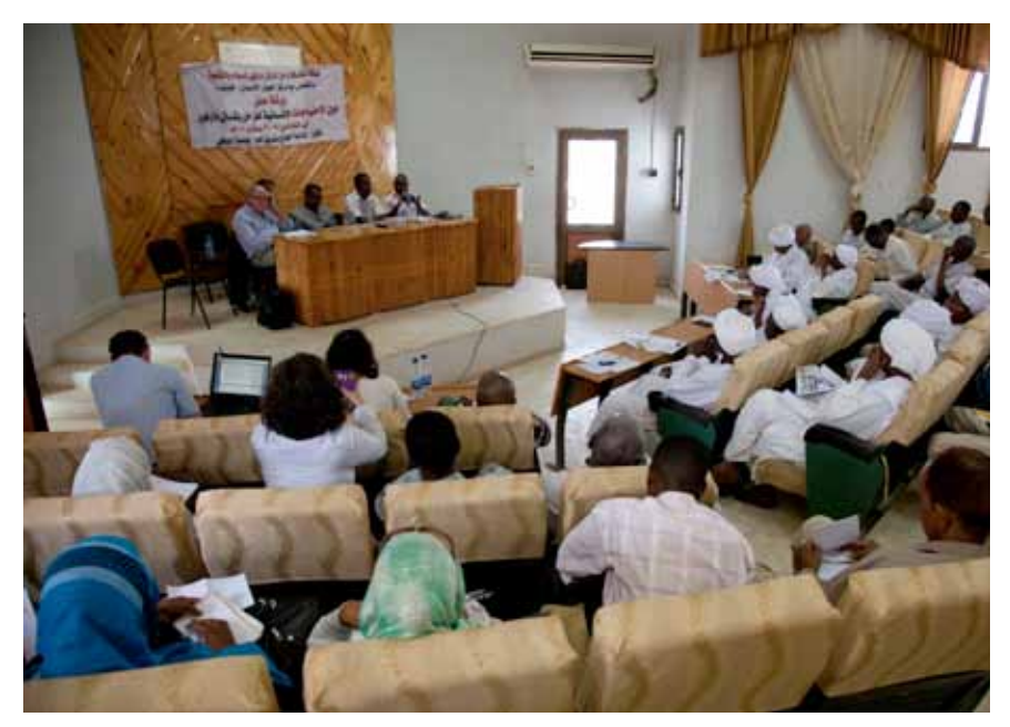
Participants at the nomads conference in El Fasher