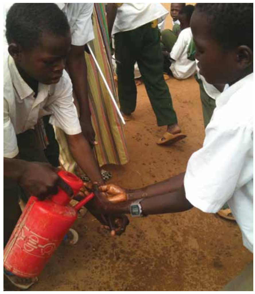
Children at Al Salam school wash their hands before eating