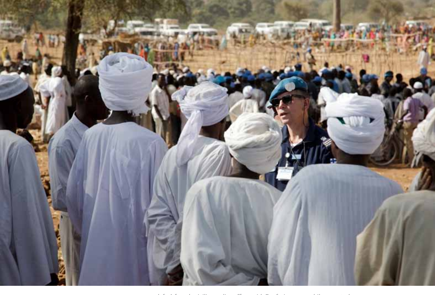
left. A female civilian police officer with Darfuri women while on patrol in Kutum, North Darfur

right. A UNAMID civilian police officer interacts with community leaders during a long range patrol in Darfur