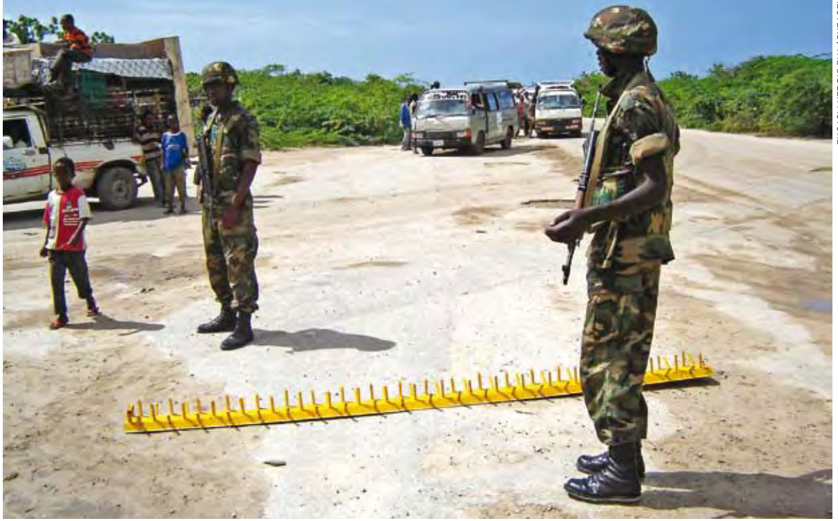
Peacekeepers verify vehicles at a checkpoint in Mogadishu, Somalia (June 2008).