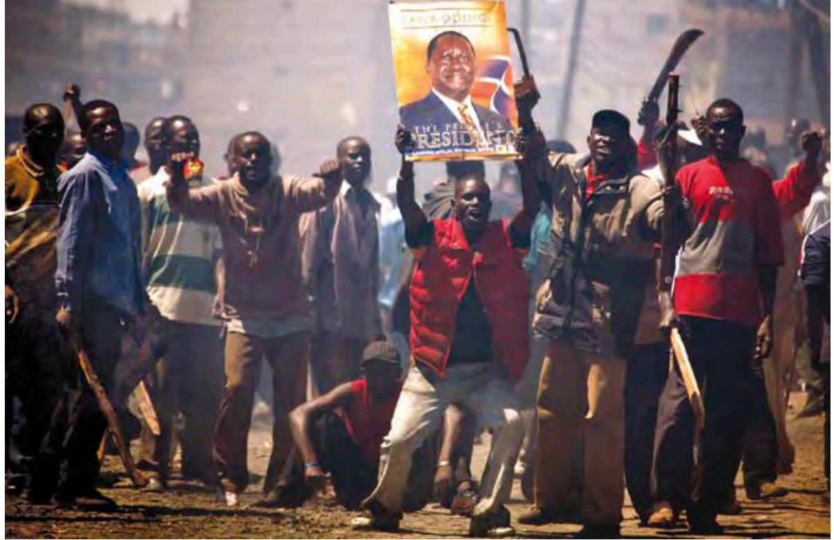
Election related violence, as experienced in Kenya in early 2008, is a residual effect of the leadership and governance challenges in Africa.

The troops already in place – including the old AU force and two new battalions – lack essential equipment, such as sufficient armoured personnel carriers and helicopters, to carry out even the most rudimentary of peacekeeping tasks. So poorly provisioned were they that some personnel even had to buy their own paint to turn their green AU helmets into the UN blue.<sup>8</sup> A combination of bureaucratic delays, stonewalling by Sudan's government and reluctance from troop- and material-contributing countries to redeem their pledges and send peacekeeping forces into the area rendered the force vulnerable to attacks.<sup>9</sup>