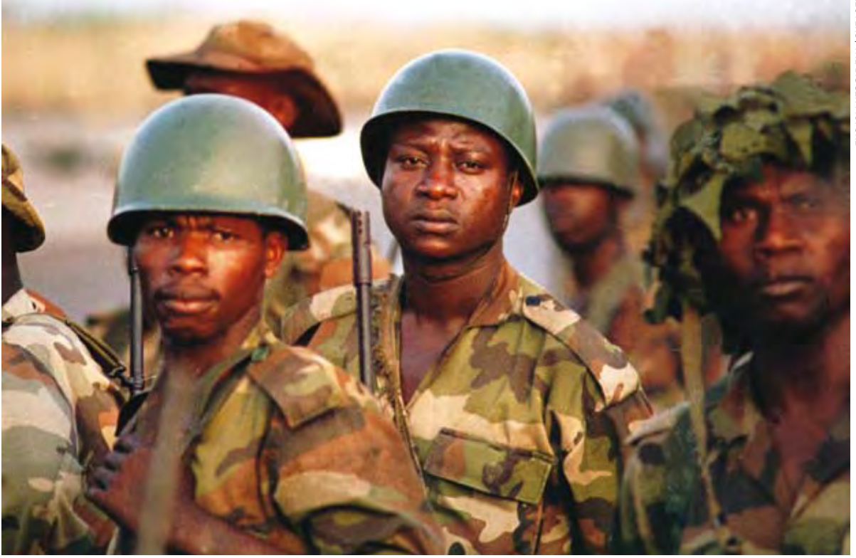
Peacekeepers from the Economic Community of West Africa Military Observer Group (ECOMOG) initiative, which represents attempts to regionalise peacekeeping efforts in Africa.

relied on Nigeria for funds and troops. This caused much suspicion among neighbouring countries about Nigeria's motives and intentions within the subregion.