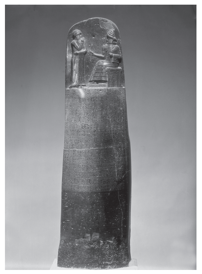
1. The Code of Hammurabi, created by the King of Babylon in about 1760 BC, is among the earliest extant collection of laws. It is a well-preserved diorite stele setting out 282 laws, providing a fascinating insight into social life under his rule