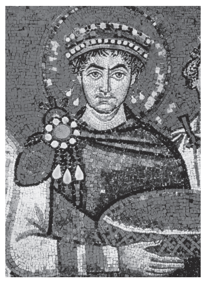
2. The Byzantine Roman Emperor Justinian, depicted here in one of the striking mosaics in the Basilica of San Vitale in Ravenna, oversaw the revision and codification of Roman law into the Corpus Juris Civilis , consisting of the Digest (or Pandects), the Institutes, the Codex, and the Novellae