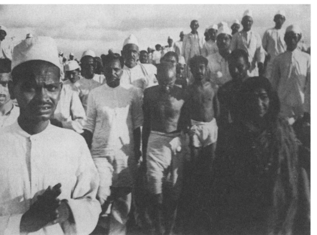
Gandhi on the Salt March, 1930

The salt deposits were surrounded by ditches filled with water and guarded by four hundred native . . . police in khaki shorts and brown