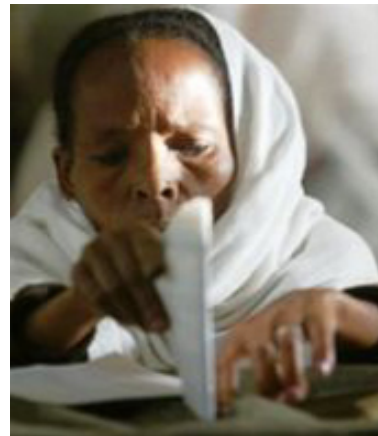
Ethiopian woman voting in the 2005 elections

The recognized opposition parties have a peaceful agenda for political change but their leaders are regularly harassed, threatened, banned, exiled and imprisoned. (For example, Ms Birtukan Mideqsa, the leader of the opposition UDF, was sent to prison for life in 2009.) The Ethiopian people have become used to the suppressive arm of the state and are deeply sceptical of democratic change. The general conclusion of research into the democratic potential of Ethiopian politics since 1991 can therefore only be pessimistic. The country's domestic stability is fragile and wrought with underlying tensions, and regional stability is also elusive.