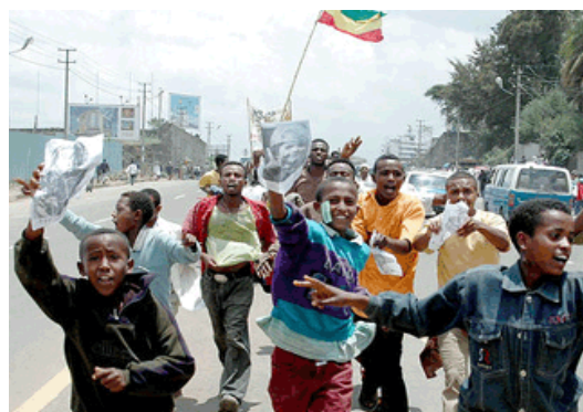
Children supporting an opposition party in Addis Ababa (2005)

The political changes in Ethiopia since 1991 have been well studied and it is notable that few, if any, scholars are positive about Ethiopia's un-reconstructed ethnic model. The TPLF/EPRDF, under the leadership of the same prime minister since 1991 and who is in effect the real power holder, has clung to a post-Marxist-centrist political model that is uncomfortable with the idea of an opposition, despite legally recognizing the existence of other parties. Elections were held in 1992, 1995, 2000 and 2005 but were, according to election observers, procedurally biased in favour of the ruling party, which is a de facto dominant party and does not entertain the idea of sharing power. During election campaigns it has been able to use the state apparatus and the police and the army to convince people to vote the 'right way'.