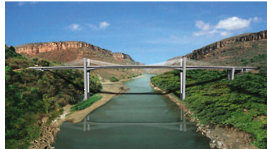
New infrastructure: The Gohatsion Bridge (2008)

pia, with investments in infrastructure, market development and direct foreign investment in, for example, the flower sector, agrarian food export enterprises and mineral exploration. The level of growth in per capita GDP is sufficiently high for most donor countries to ignore the restrictions on political and human rights, on equality before the law, and the repression. Accountable governance, transparency, respect for (property) rights, access to land, and reform of the justice system have lagged behind, and the dramatic level of violence that has weighed on the country since the days of the Mengistu regime is still an ominous subtext in public life.