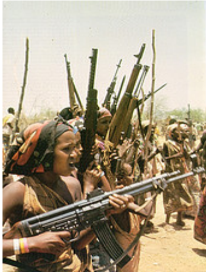
ONLF fighters (2008)