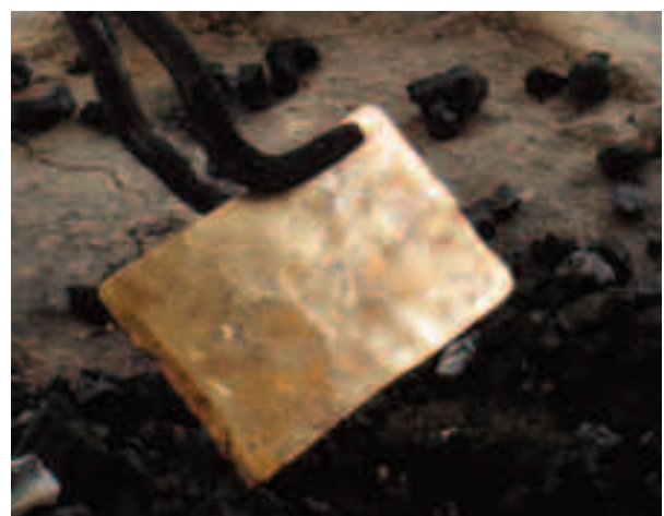
A bar of gold melted at a trading house in Bamako.

At the regional level, the Economic Community of West African States (ECOWAS) should ensure that the future ECOWAS Mining Code prohibits child labor in artisanal mining, including the use of mercury, and mandates governments to take steps to reduce the use of mercury. At the international level, the future global treaty on mercury should oblige governments to take measures that end the practice of child laborers working with mercury. The ILO should build on its past efforts to end child labor in artisanal mining by reviving its “Minors out of Mining” initiative.