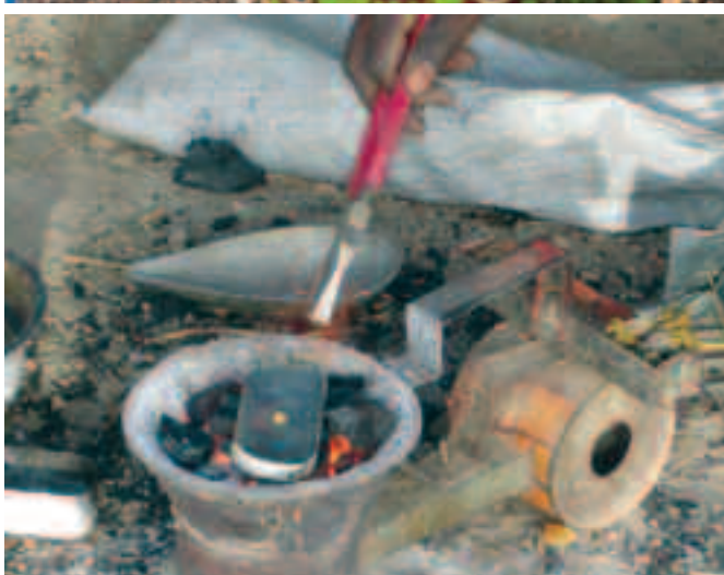
A woman holds liquid mercury, used to extract gold, in her bare hand at Baroya, Kéniéba circle. The mercury binds to any gold present, creating a gold-mercury amalgam. A local trader burns a mercury-gold amalgam. The mercury vaporizes during the process. Mercury vapors are highly toxic.

artisanal mining, politically, financially, and with technical expertise. There is the need to convene a national roundtable on hazardous child labor in artisanal mining in Mali, to bring together all relevant actors—government, civil society, UN, donors, experts, and business—and create momentum for concerted action.