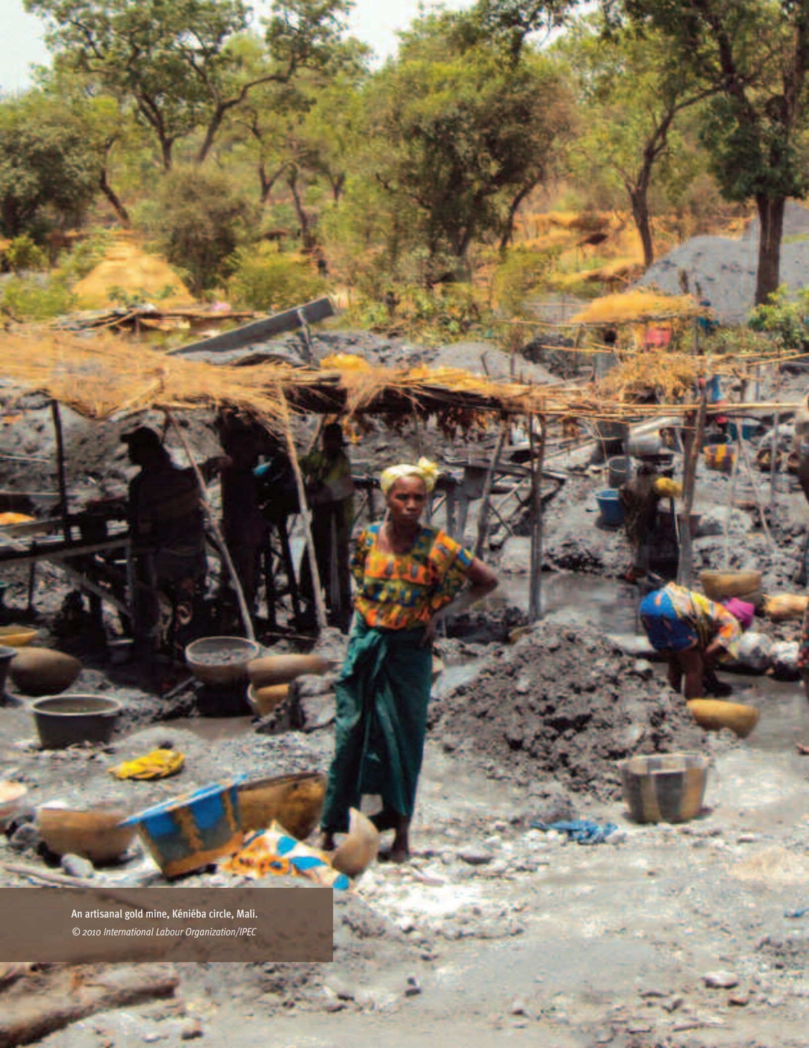
An artisanal gold mine, Kéniéba circle, Mali.