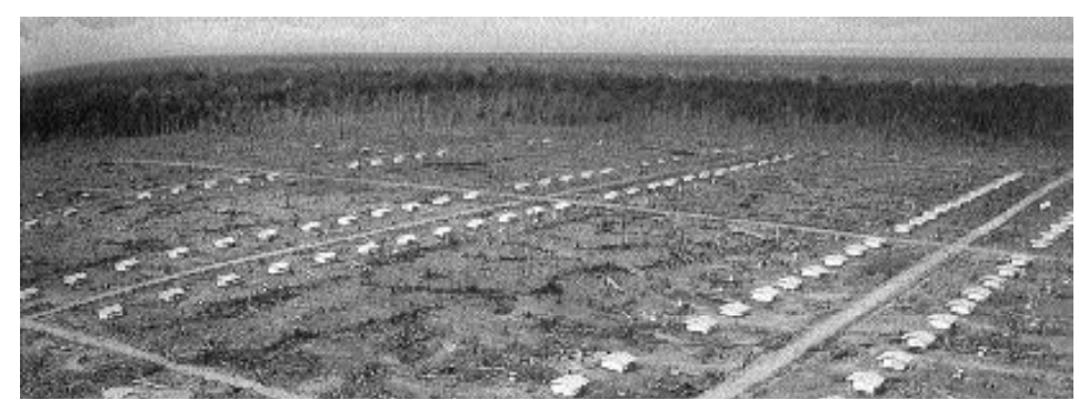
Ends of the World?