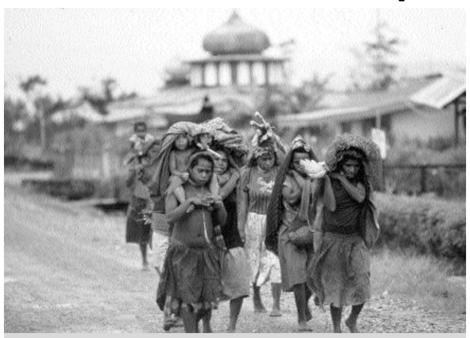
Mosques and Churches dominate modern architecture in Papua: "Religion is a tool used by those in power to control the human beings of this earth."

The term 'tribal people/community' is perhaps inappropriate to refer to all people concerned about the destruction of bio-diversity. It actually refers to the whole bio-diversity of the planet Earth that consists of plants, animals and human beings and other resources on and in the earth. Tribal community best represents this concept of 'natural life' on this planet. Tribal community will vanish in the early 21st century if we do not do anything about our existence from now on. Of course, we are already late in the day, but better late than never. The enemies are blind, they are deaf, they are mad. They have done, are doing, and will do whatever they can to destroy the natural life. What tribal community should do is to realise this and act upon this knowledge to resist properly and effectively.