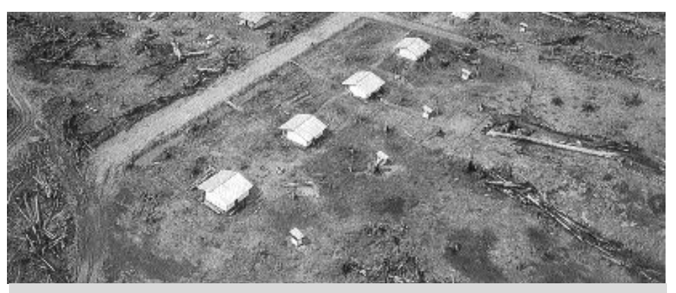
Loggers tear down the forest and are swiftly followed by government-sponsered settlers: "Everything is moving towards a boring oneness."

I have seen two ends of this world. Two powers are struggling to bring this world to two different ends. The first one is influenced very strongly by the corporations, led by a small amount of 'powerful'people on this earth. The second end is led by the common people, the population of the world. It depends on the other three enemies of tribal people; religious organisations, governments, NGOs/AOs to decide either to serve the common people's wish or to submit to the fourth enemy of the tribal people, i.e. multinational corporations.