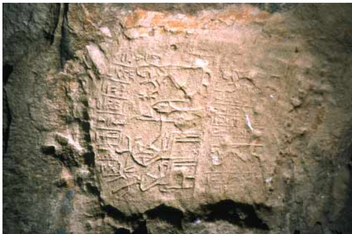
Fig. 2.6 Stela showing the viceroy Amenemipet before two deities.