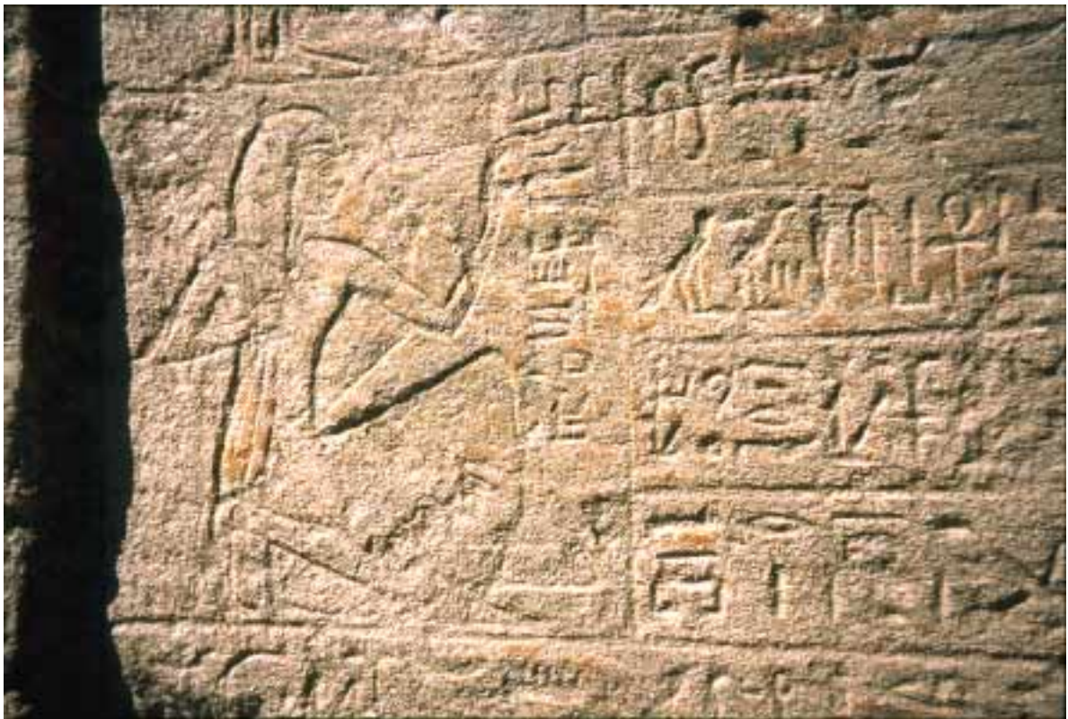
Fig. 18 Royal stela, detail. Figure of viceroy Amenemipet and accompanying inscriptions.