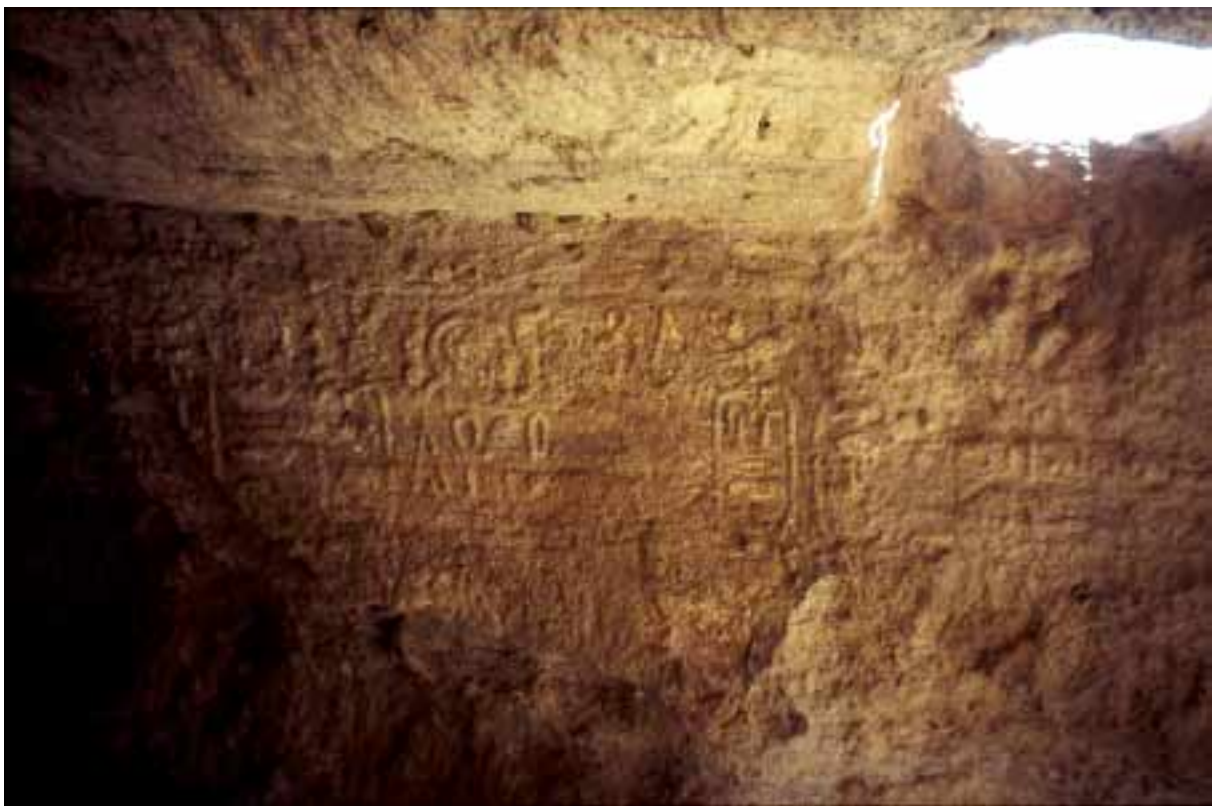
Fig. 10 Chapel of Thutmose III, hall, east wall. Remains of decoration including cartouches of the deified king, Senwosret III.