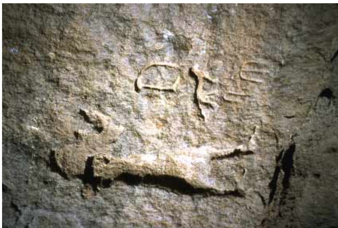
Fig. 2.5 Figure of the priest, Maimes.