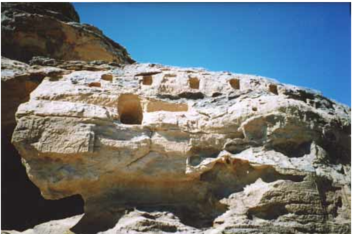
Fig. 30 Rock face to right of Thutmose III chapel, with remains of stelae and series of rectangular holes.