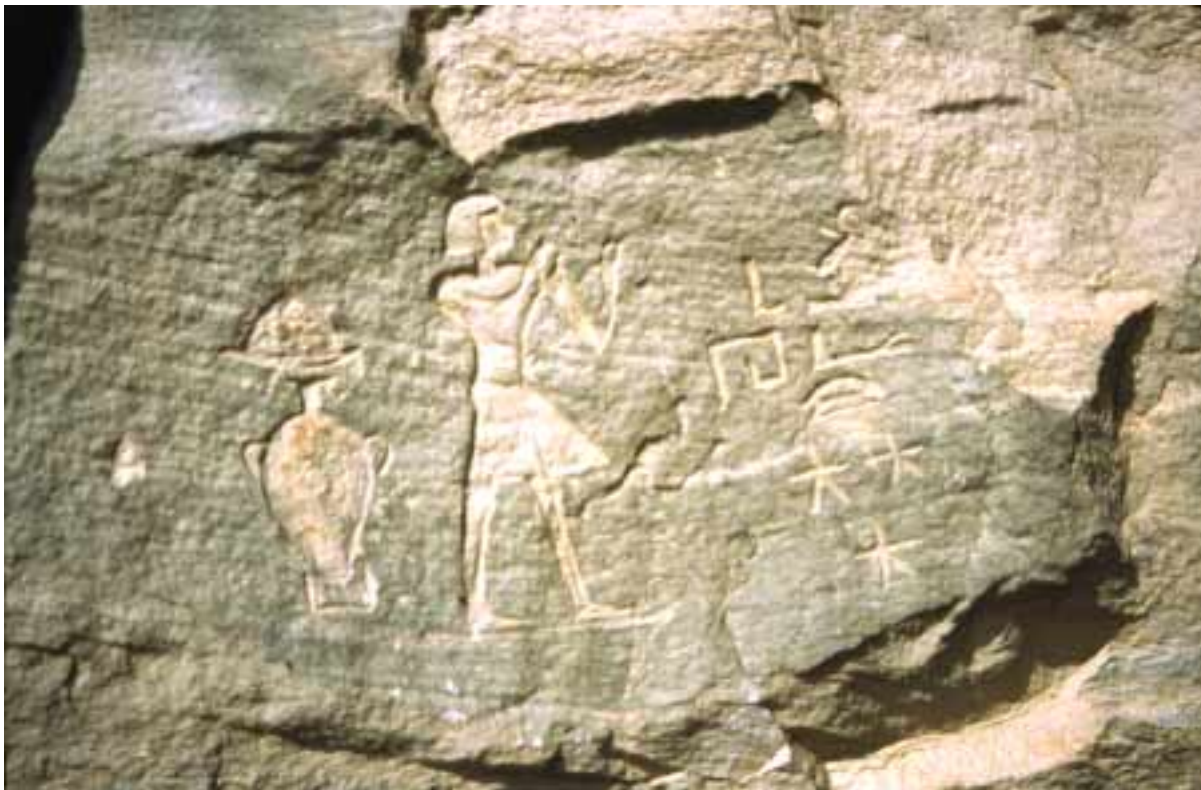
Fig. 28 Scene showing an official named Sebkhou(?).