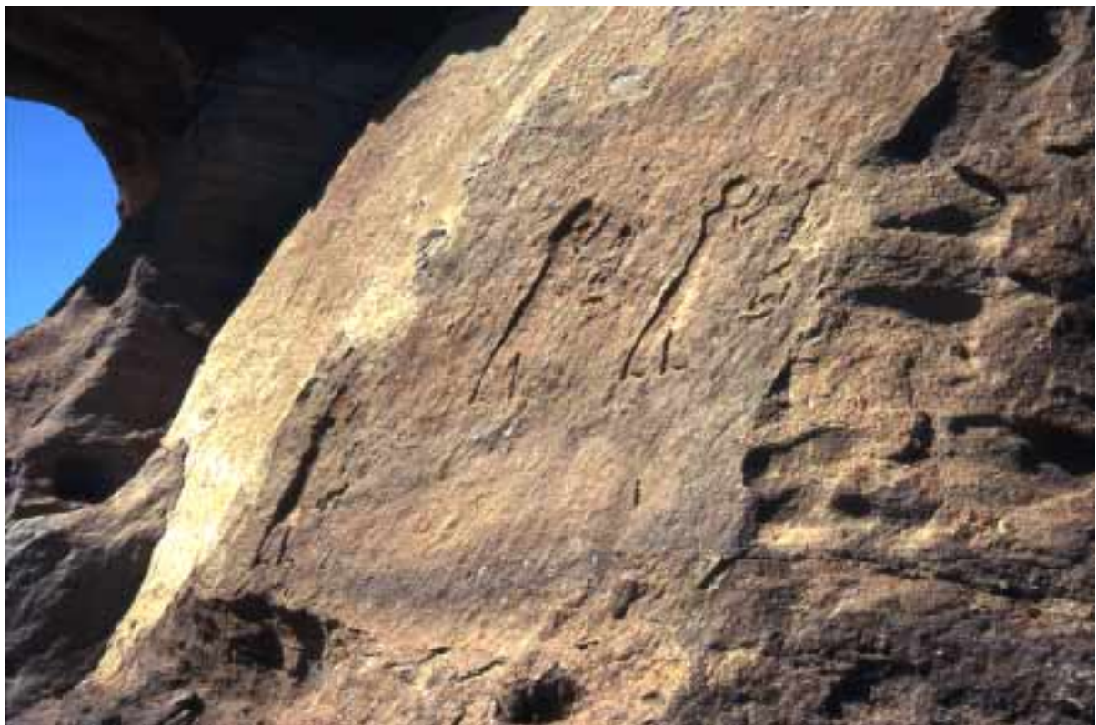
Fig. 22 Group of three male figures, located to left of royal stela.