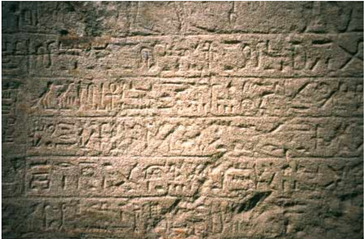
Fig. 21 Royal stela, detail of main inscription.