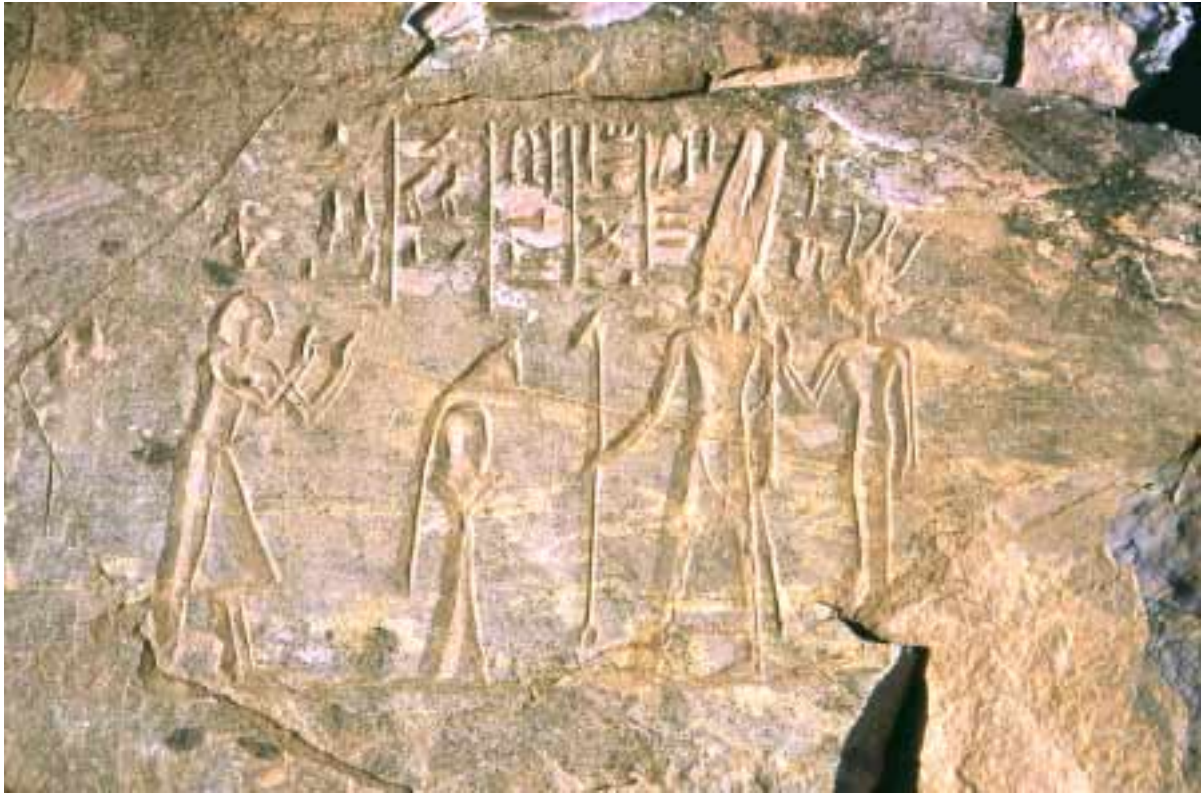
Fig. 27 Stela showing the scribe, Keny, before two deities.