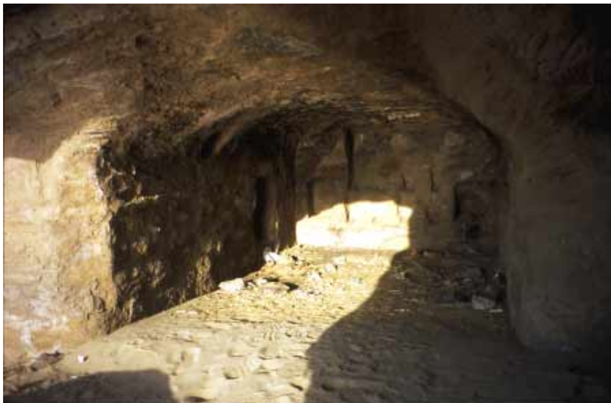
Fig. 11 Chapel of Thutmose III, interior, inner chamber.