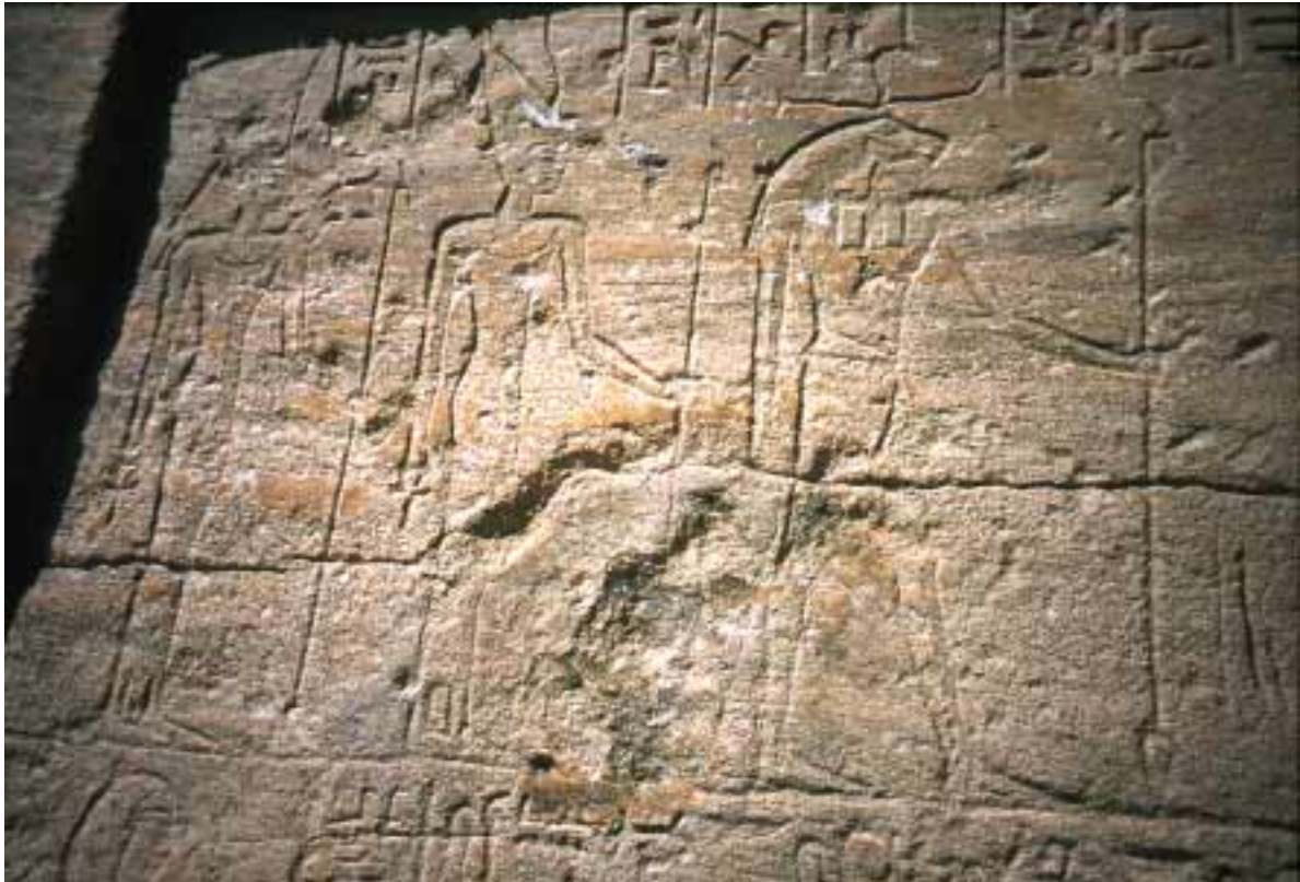
Fig. 17 Royal stela, detail. Figures of three deities, Khnum, Satef and Anket.