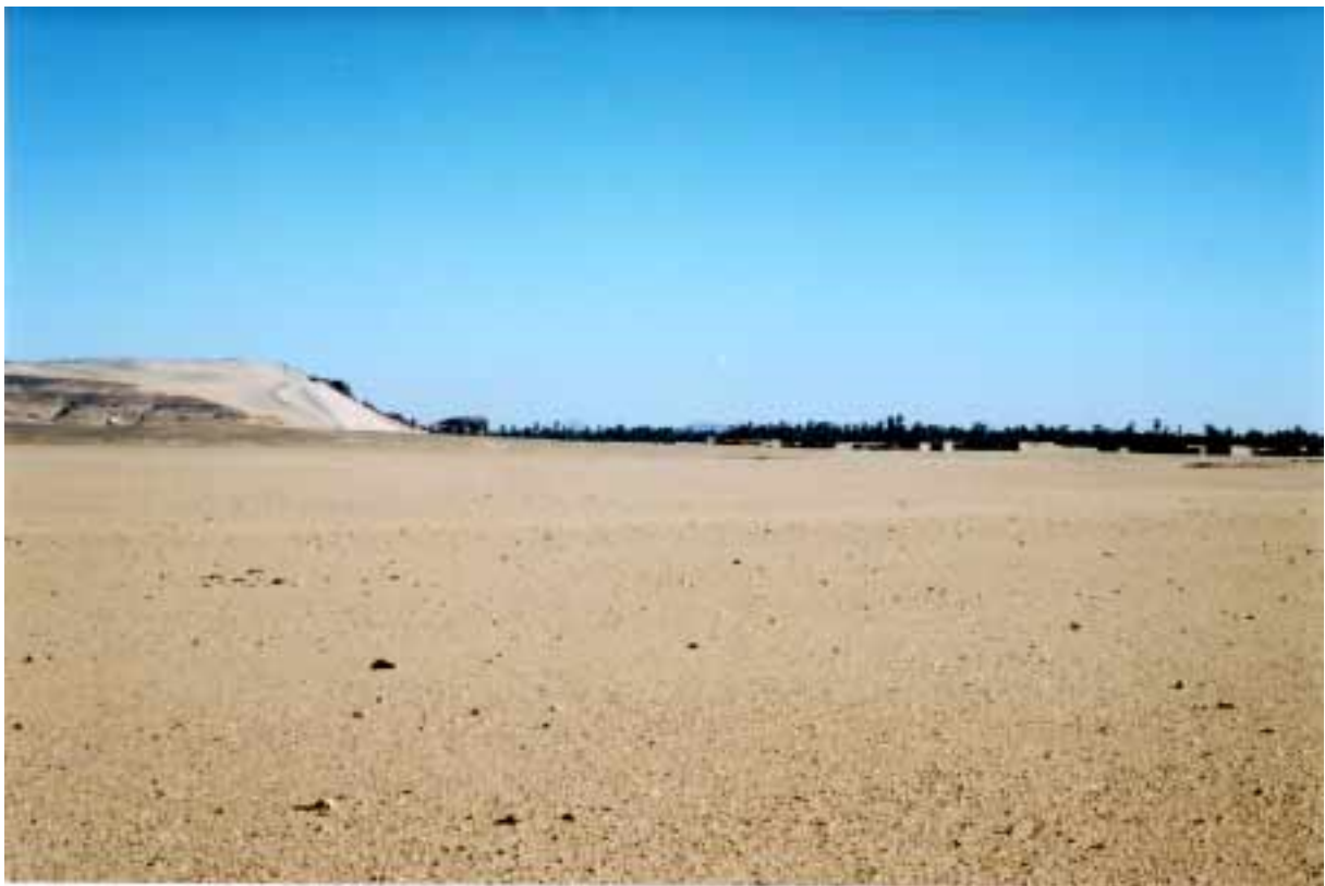
Fig. 2 View of Jebel Dosha (promontary extending from sand dune on left) approaching from the south-west.