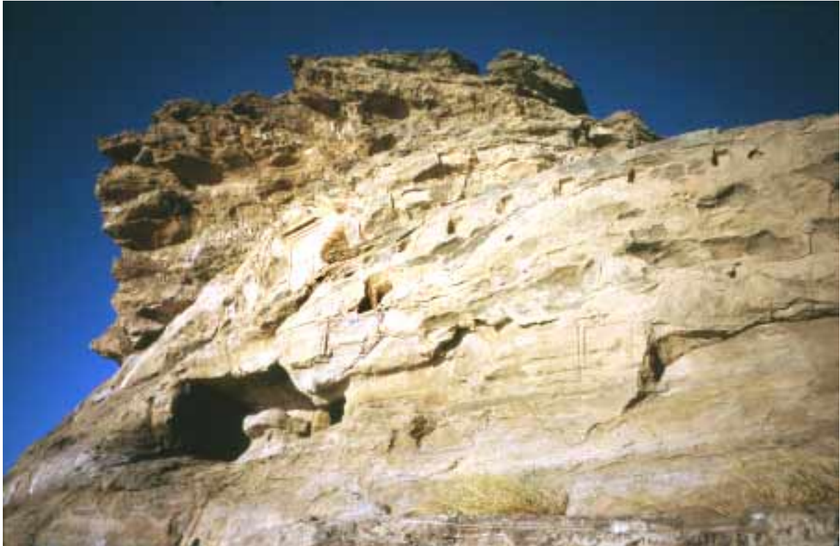
Fig. 5 View of Jebel Doshā from the north, with chapel of Thutmose III on left.