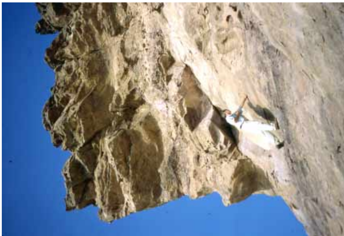
Fig. 20 Examining the figures and inscriptions to the left of the royal stela.