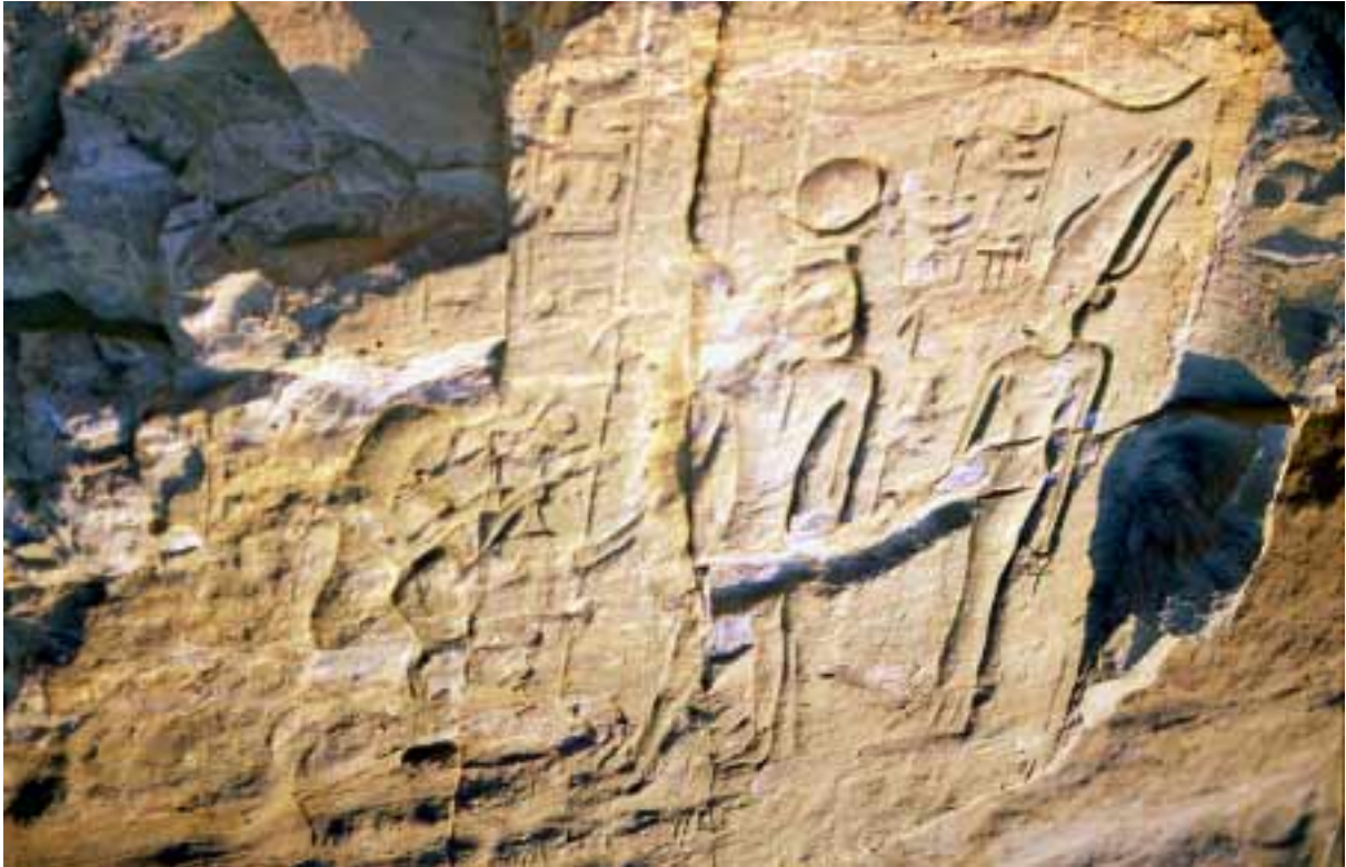
Fig. 29 Stela showing an official kneeling before two deities.