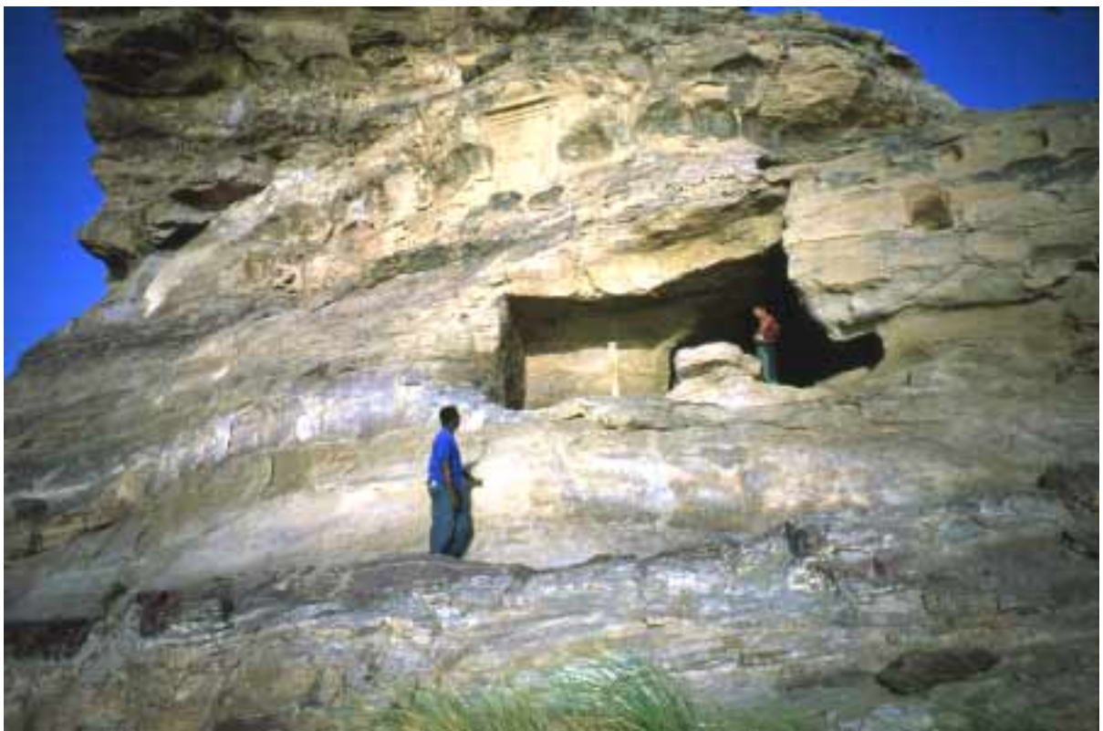
Fig. 6 Chapel of Thutmose III and, above to the left, stela of Seti I.