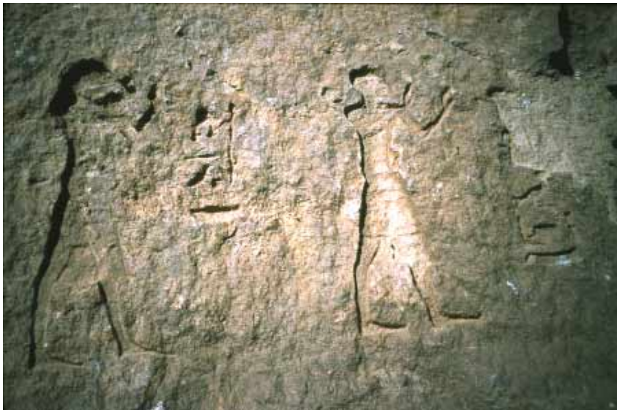
Fig. 23 Two male figures, located to left of royal stela.