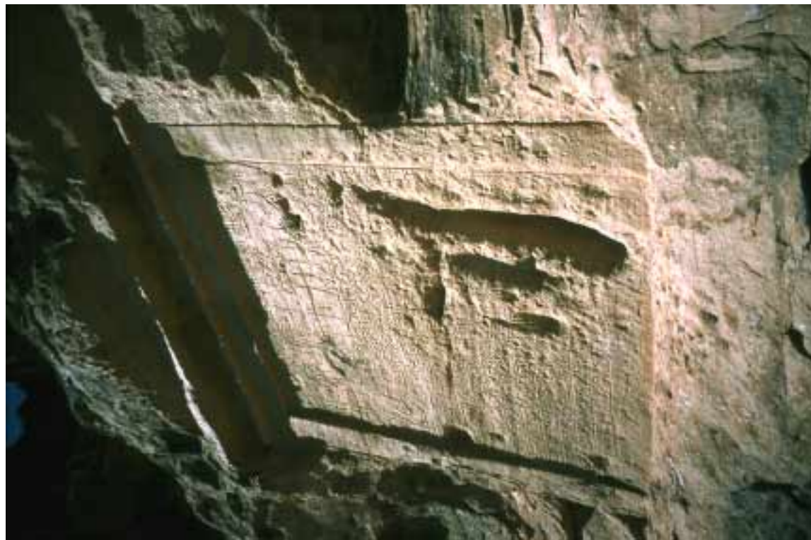
Fig. 13 Stela of King Seti I.