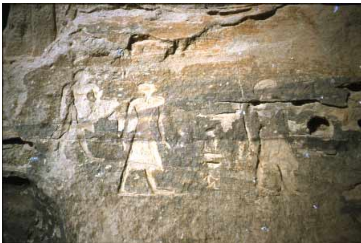
Fig. 24 Group of three male figures, located to right of royal stela.