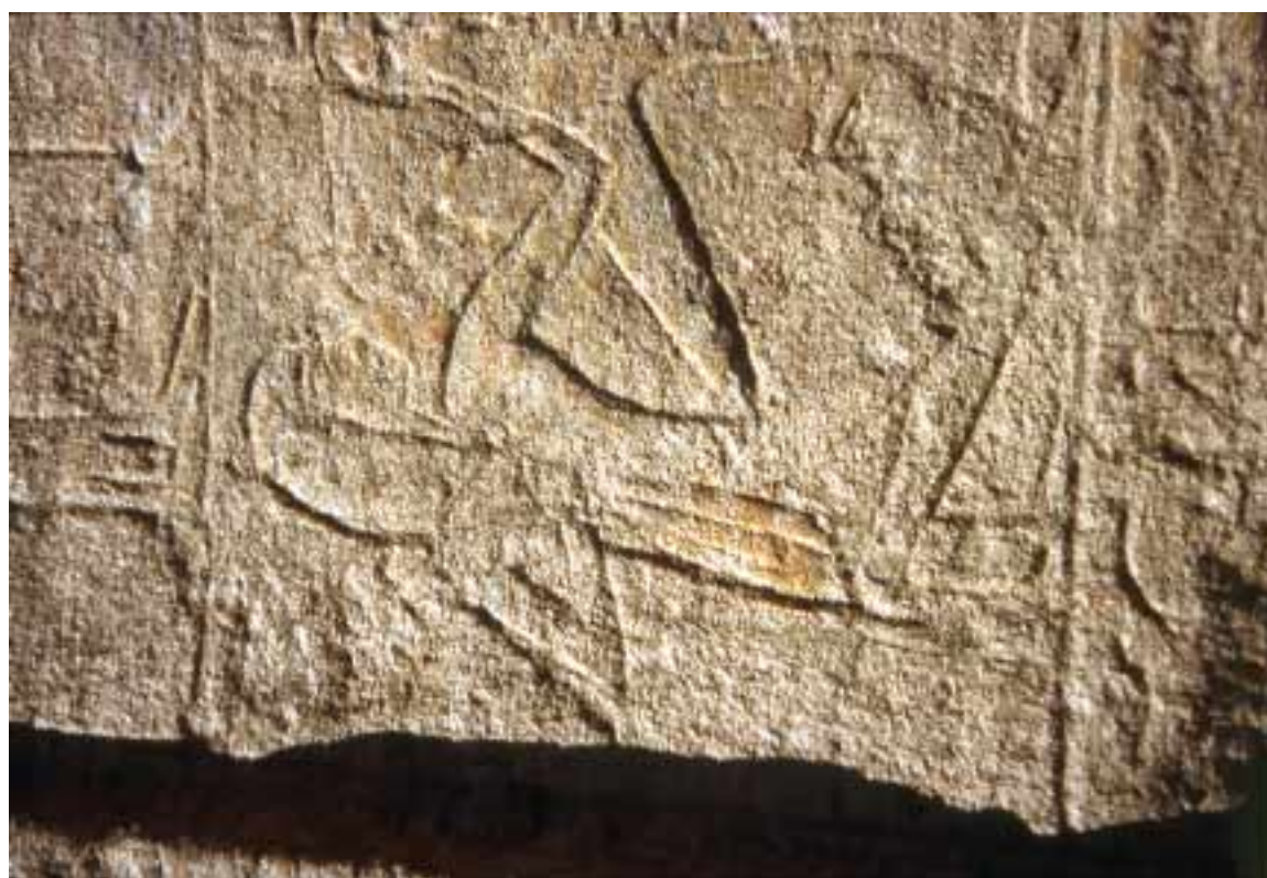
Fig. 19 Royal stela, detail. Figure of viceroy Amenemipet.