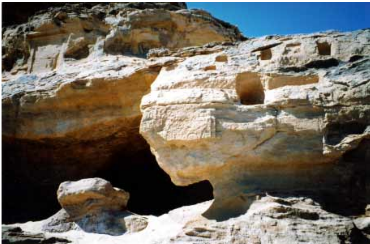
Fig. 8 Chapel of Thutmose III. Remains of entrance and right façade.