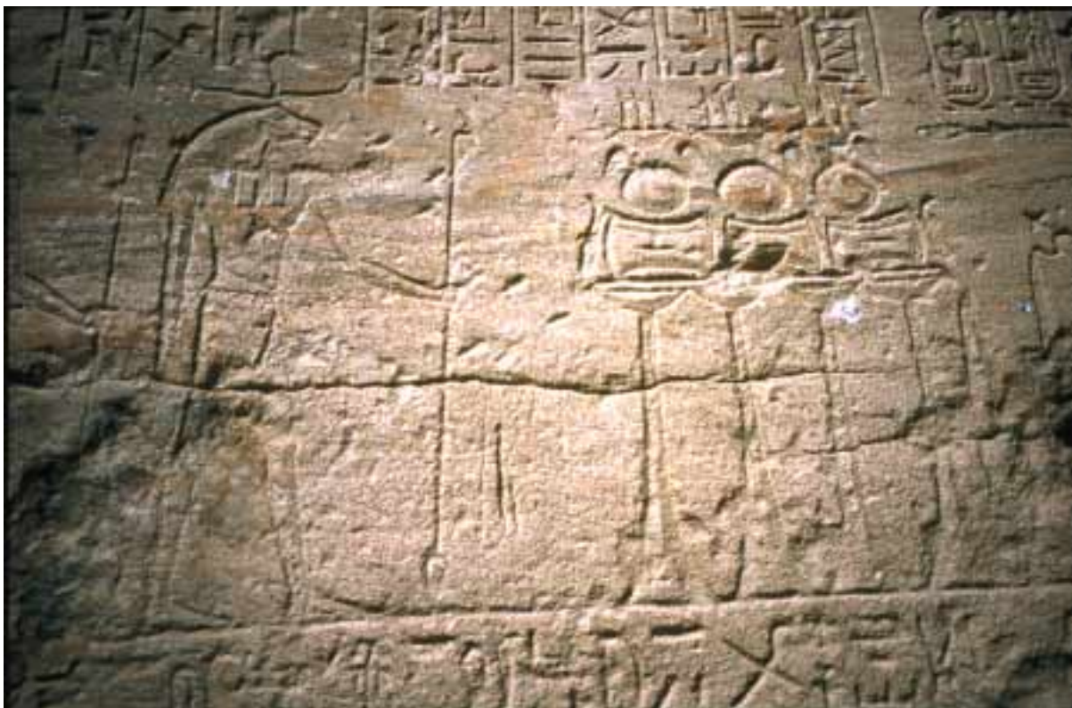
Fig. 16 Royal stela, detail of offering table and figure of Khnum.