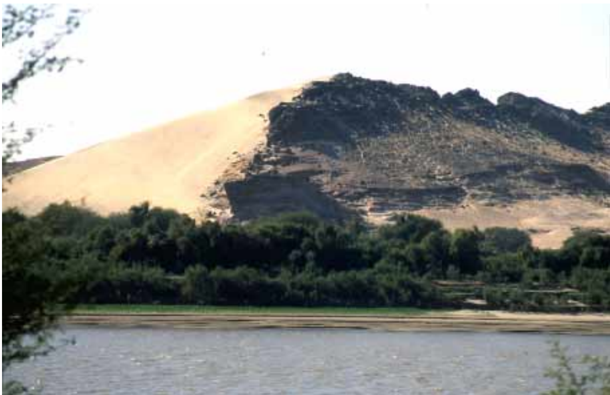
Fig. 4 Jebel Dosha seen from across the Nile. The chapel of Thutmose III is masked by the vegetation on the island in the foreground.