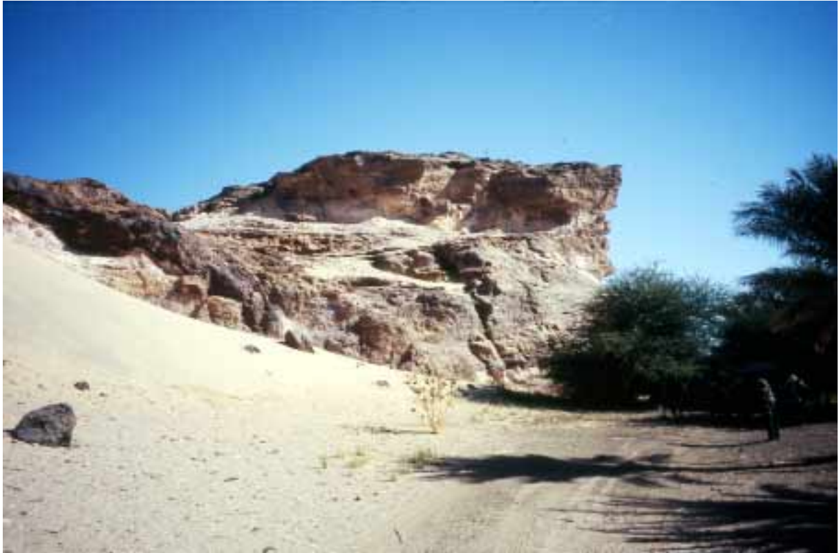
Fig. 3 View of Jebel Dosha from the south.