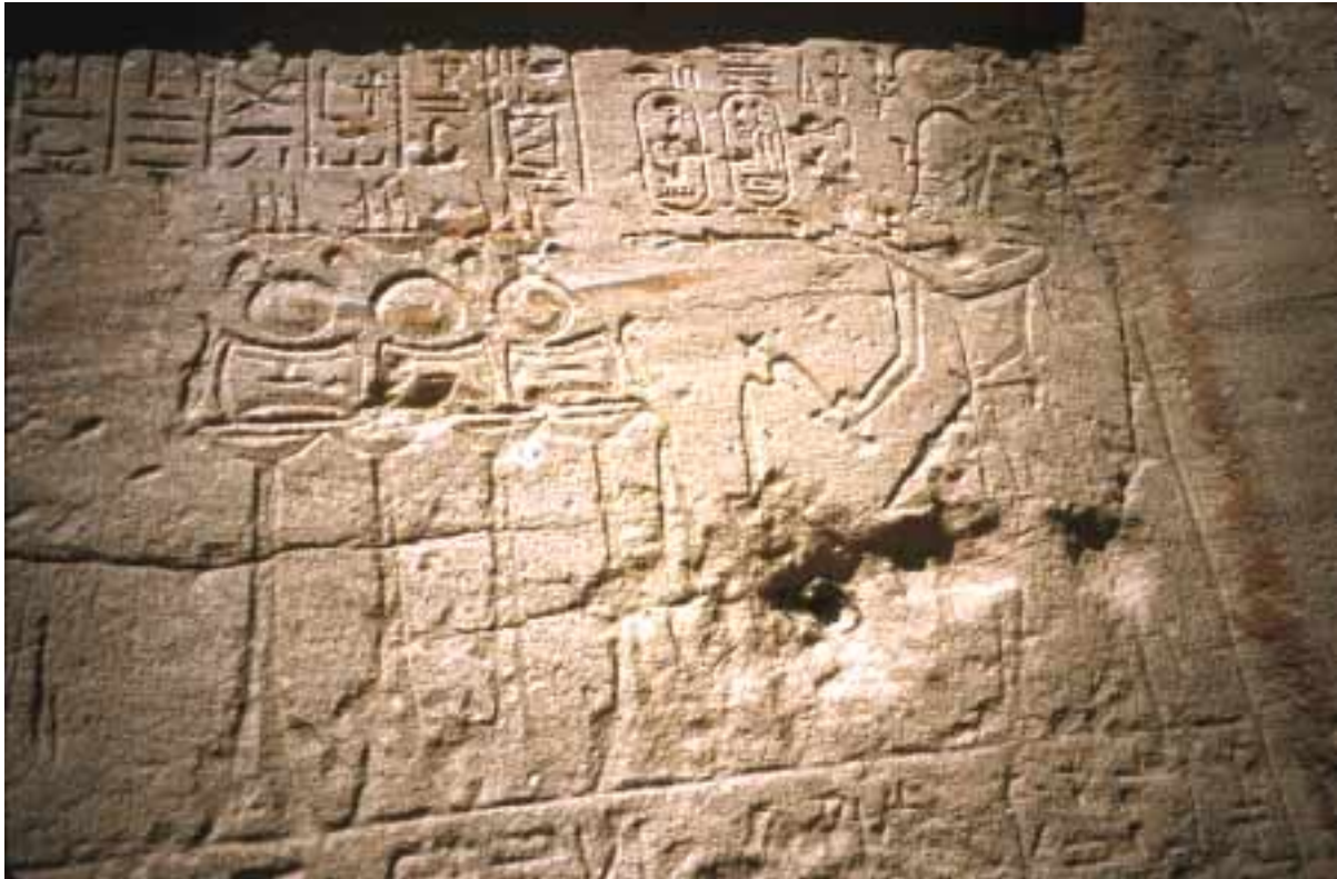
Fig. 15 Royal stela, detail. Figure of King Seti I before offering table.