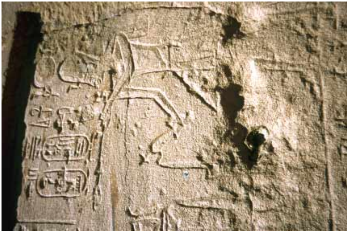
Fig. 14 Royal stela, detail. Figure of King Seti I.