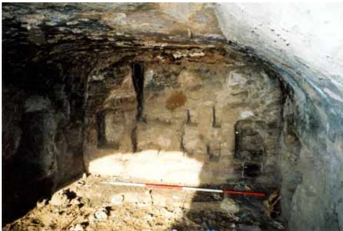
Fig. 12 Interior of Thutmose III chapel, with remains of three rock-cut figures in rear wall.