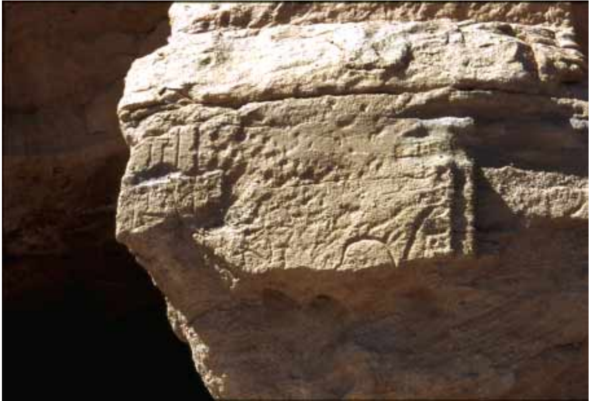
Fig. 9 Chapel of Thutmose III. Remains of decoration to right of entrance.