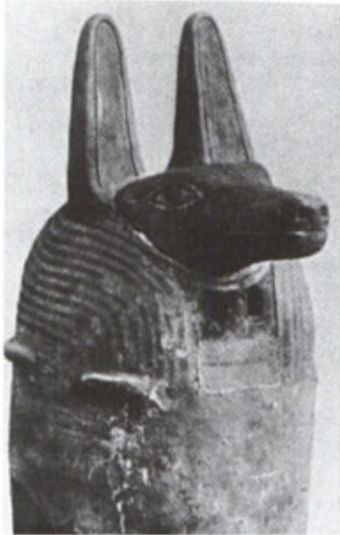
Mask of Anubis; used for rituals

Therefore, it is not death that this coffin conceals. In fact, Anubis depicts resurrection. This jackal whose head (according to Apuleius) appears half black and half gold (the colors of death and rebirth) is, to the initiate, the god of hope.