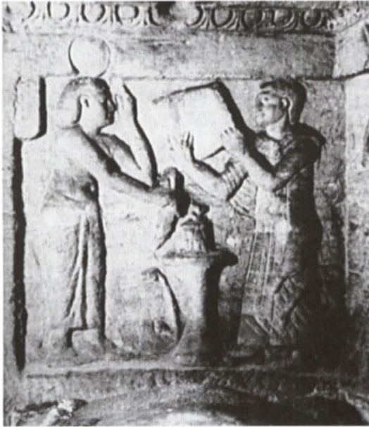
Priest reading before a candidate; tomb of Kom-el-Choufaga (Alexandria)

A master of “inspired mien . . . with a truly superhuman expression,” first reads sacred writings which are pulled out from a hiding-place, at the end of the sanctuary.