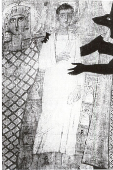
Deceased wearing the crown in his left hand, and led by Anubis Louvre, Paris.

Numerous are the basins in Egypt which adjoin the temples. It is there that the rites of lustration were conferred upon the masters, and initiations were probably performed there also.