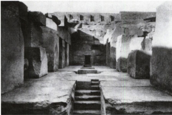
Central Hall, Osireion of Abydos

What can be the purpose of this extraordinary architectural complex? Would it be a cenotaph of Seti I, whose name is inscribed in the entrance corridor and in the central hall? It is possible, as the walls of the corridor are covered with funerary inscriptions, such as in the tombs of the Valley of the Kings; in addition, a spacious empty room, reminiscent of the ones in the pyramids of Sakkara and laid out on the east side of the Osireion, conjures up images of a huge sarcophagus.