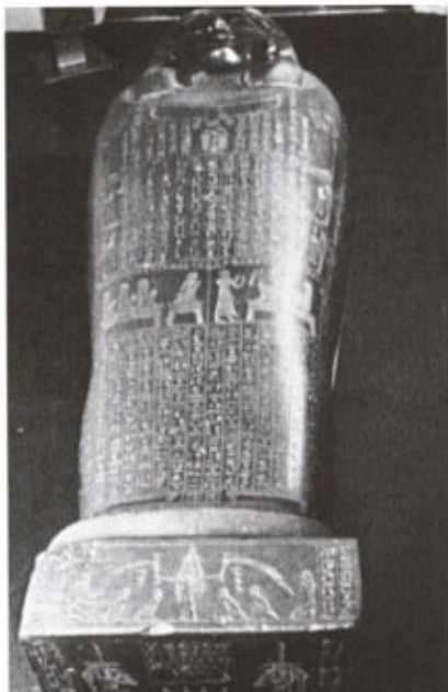
Sarcophagus No. 67, Saite Period Unpublished Archeological Museum, Marseille

3. Hence the conclusion that since the Osireion seems to be a copy of the destroyed temple, all the details of the texts pertaining to this temple can be transferred, without risking too much error, to the architectural complex of the still-standing Osireion of Seti.