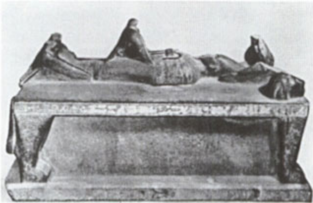
Replica of the Osirian Sepulcher. Isis (the bird) is being fecundated by Osiris. (Cairo)