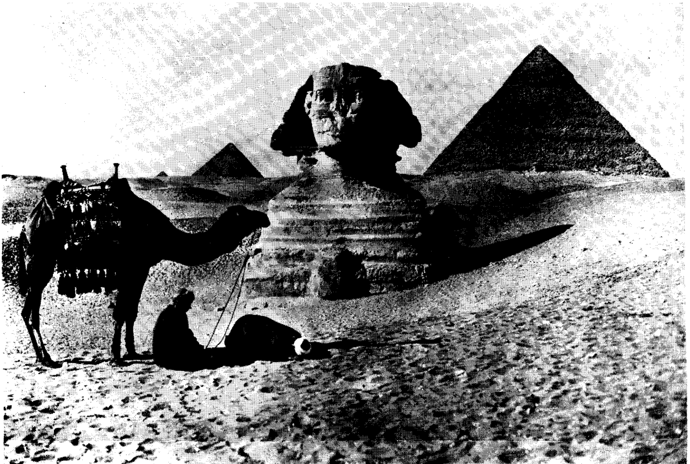
Arabs praying near the Great Sphinx before the sand was dug away from its base. The second largest pyramid is in the background to the right.

me men gave ear, and waited, and kept silence at my counsel. After my words they spake not again. . . . I . . . sat as chief, and dwelt as a KING in the army, as one that comforteth the mourners' (Job 29:21-25).