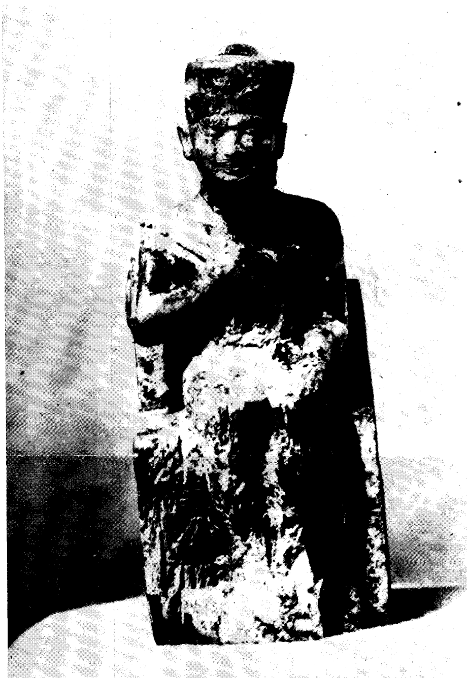
A badly damaged ivory statuette of Cheops from Abydos, Egypt. No other statues are known of him. The features of Cheops are distinctly non-Egyptian. Cheops built the great pyramid of Gizeh, near Cairo. It is the first and also the greatest pyramid ever built.

The Great Pyramid was built, according to Herodotus, over a period of about 20 years in the 3 months of each year during which the Nile overflowed and the people were idle. Its construc-