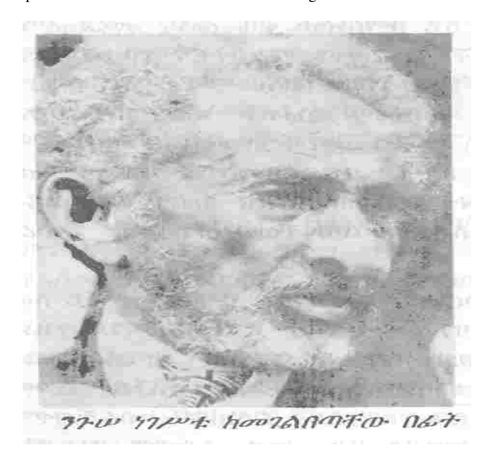
Figure 5. Emperor Haile Selassie I around the end of his government.

Which means literally "The Emperor was ---power centered and self –interested. After 80 years of age ---under senility even he had ---power malady" ( ibid. ).