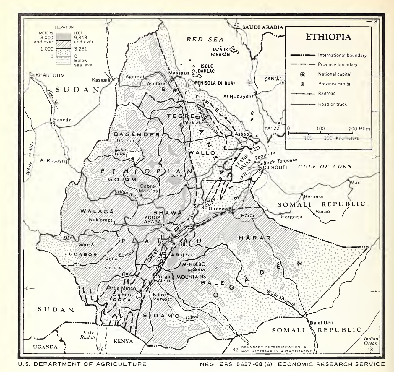
Figure 2.--Ethiopia: Topography.