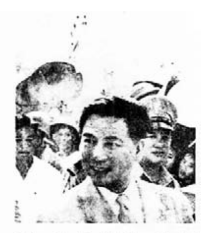
Tôi truất-phế (bỏ) Ông Bảo-Đại và công nhận (bằng lòng) Ông Ngô-Đình-Diệm làm Quốc-Trưởng Việt-Nam với nhiệm-vụ tồ-chức một chính-thể dân-chủ.