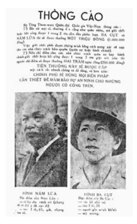
Figure 5.1. Wanted poster for Ba Cut and Tran Van Soai, November 23, 1955 ( Thoi Dai )

Pham Cong Tac clung to his position at the Holy See until February 1956 when the approach of government troops forced him to flee to Cambodia. That same month, Tran Van Soai finally convinced Ngo Dinh Diem to accept his surrender. Until then, the prime minister had continued to reject Tran Van Soai's pleas to integrate Hoa Hao troops into the national army, as evidenced by the commander of the army's announcement in November 1955 of a 1 million dong reward for the capture of Tran Van Soai and Ba Cut, dead or alive, or a 200,000 dong reward for information leading directly to their capture. The incentive, announced in Thoi Dai , emphasized that the army was enacting this measure to ensure the safety of citizens in areas where the two men and their armies operated. It was accompanied by thorough physical descriptions of both Tran Van Soai and Ba Cut as well as clear, close-up head shots of the two men looking clean and well dressed.