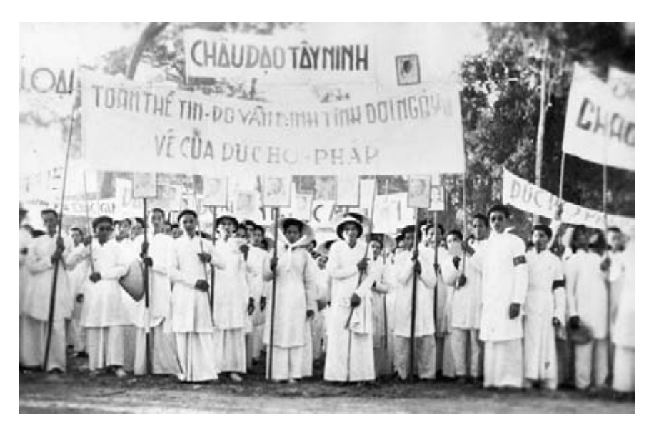
Figure 1.1. Cao Dai protest outside the Holy See in Tay Ninh, February 1957

This looks political to me." The next day, the film crew returned to find that the vice pope and his staff had departed for parts unknown. The Cao Dai followers who remained refused to have anything further to do with filming the movie. Only then did a group of twenty thousand disillusioned Cao Dai followers sit down to elect a new pope, finally accepting that the old pope was gone for good.<sup>1</sup>