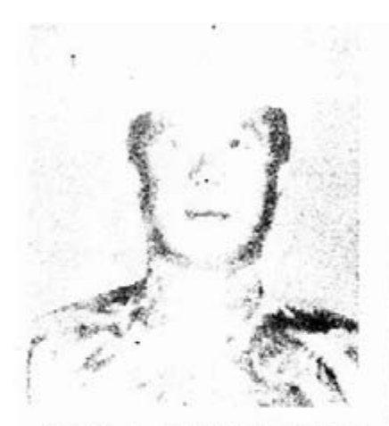
Tôi không truát-phê (không bỏ) Ong Bảo-Đại và không còng nhận (không bàng lòng) Ông Ngô-Đinh-Điệm làm Quốc-Trưởng Việt-Nam với nhiệm-vụ tồ-chức một chính-thè dân-chủ.

these electoral regulations, the ballot sent an unmistakable signal that Ngo Dinh Diem was the only real choice. The left side, with an inauspicious green border, showed a bloated, somber, traditionally clad Bao Dai above the text, "I do not depose Bao Dai and do not recognize Ngo Dinh Diem as the chief of state of Vietnam with the duty to organize a democratic government." The right side, bordered by the lucky color red, showed a smiling, vibrant, modern clad Ngo Dinh Diem making his way through an adoring throng, above the text, "I depose Bao Dai and recognize Ngo Dinh Diem as chief of state of Vietnam with the duty to organize a democratic government."80 CIA officer and Ngo Dinh Diem confidant Edward Lansdale recalls advising the prime minister to use color on the ballot to send a subliminal message to voters without appealing directly to superstition or custom. He claims, however, that he urged Ngo Dinh Diem to use a good photograph of Bao Dai in order to confirm the validity of the vote.81 Beyond this, there is little evidence that the United States took significant interest in Ngo Dinh Diem's polling procedures prior to the referendum.