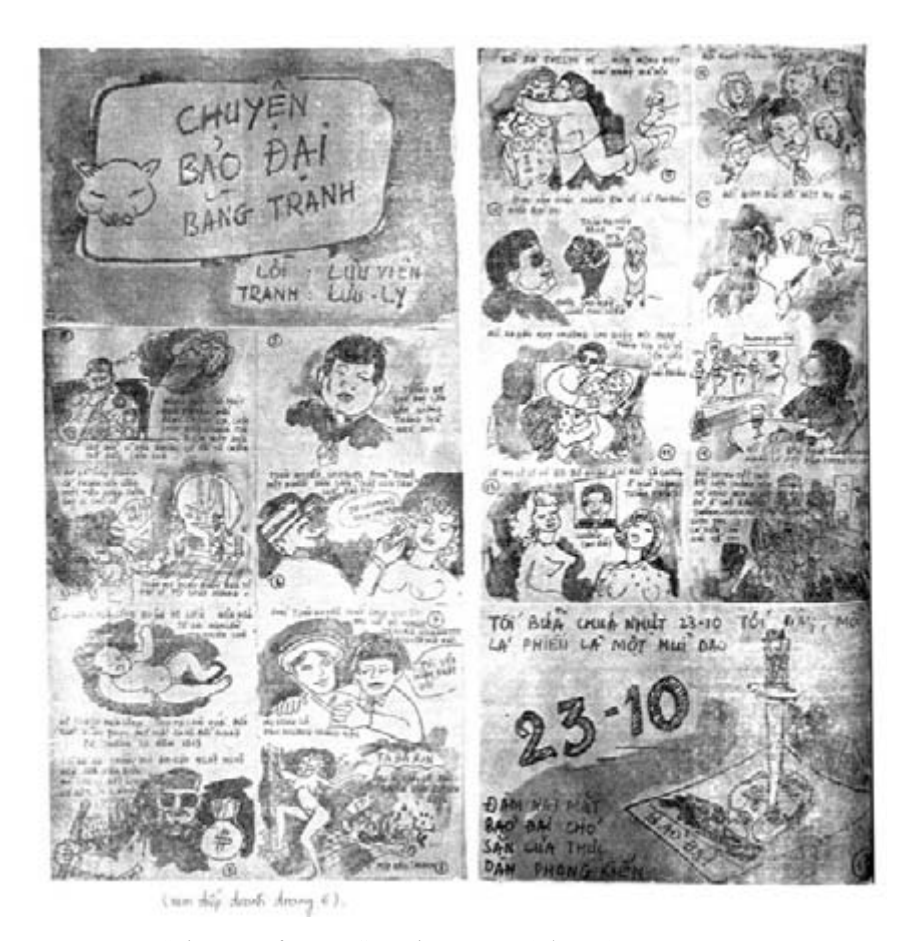
Figure 6.3. "The Story of Bao Dai," October 19, 1955 (Thoi Dai)

evidence that he was not only an inept leader but a leader unwilling and incapable of taking responsibility for his failures.<sup>47</sup>