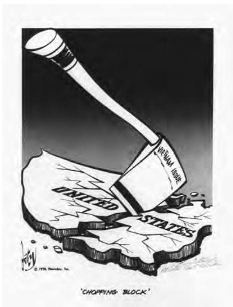
A cartoon published on May 7, 1970, suggests the impact of the Vietnam War on American society.

disapproval of antiwar agitation and surprisingly high approval—59 percent on June 2—for the administration. In the November 1970 elections, the Republicans fared well, losing nine seats in the House but gaining two in the Senate. Encouraged, Nixon pressed on with his Vietnam policy, still searching for the formula that would bring success.