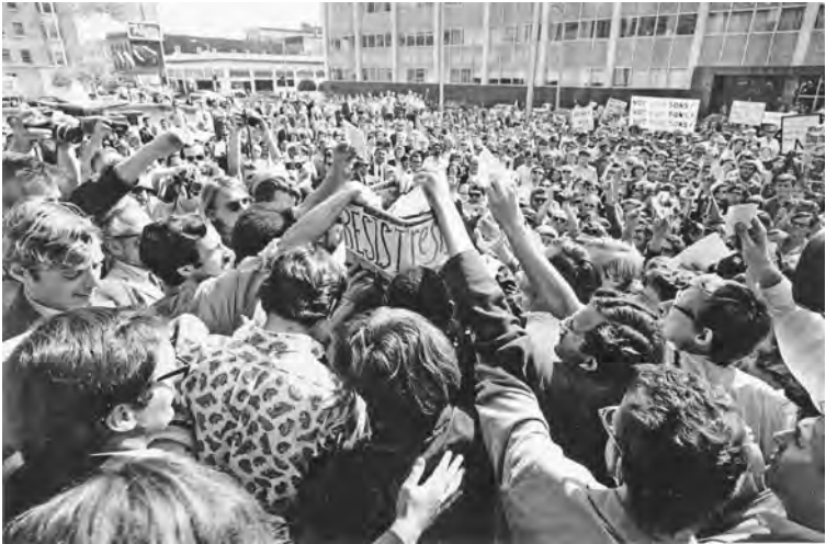
Antiwar protesters collect draft cards during a demonstration at the Federal Building in San Francisco, California, on October 16, 1967.

must stop, liberals contended, to avoid squandering America's good name and resources in a brutal conflict that could not be won at a reasonable cost.