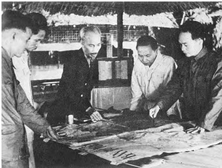
Ho Chi Minh (center) and other officials of the Democratic Republic of Vietnam plan the Dien Bien Phu campaign in early 1954. Military commander Vo Nguyen Giap stands at the far right, while Pham Van Dong, another key revolutionary leader, stands second from the left.

hundred fifty thousand Viet Minh laborers, roughly half of them women known collectively as the “long-haired army,” had lugged Soviet-made artillery and other equipment into the rugged mountains around Dien Bien Phu. 13 More than fifty thousand well-armed DRV troops surrounded the garrison below when the assault began. Within two weeks, they had destroyed the French airstrip, isolating the twelve-thousand-man garrison from reinforcement. The whole base lay in jeopardy.