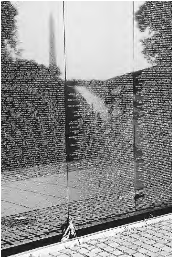
The Vietnam Veterans Memorial, completed in 1982, stands a short walk from the Washington Monument on the National Mall in Washington, D.C.