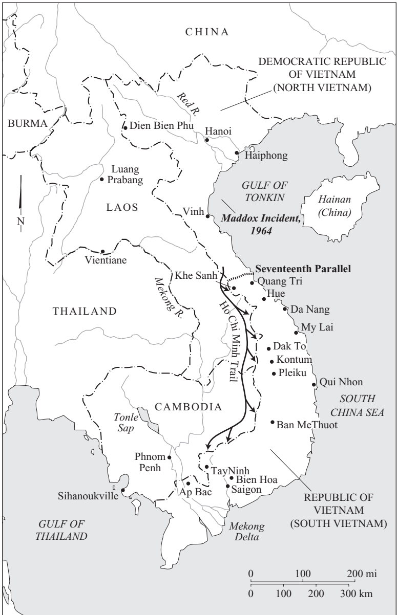
Map of Vietnam, Laos, and Cambodia showing major sites of the American war.