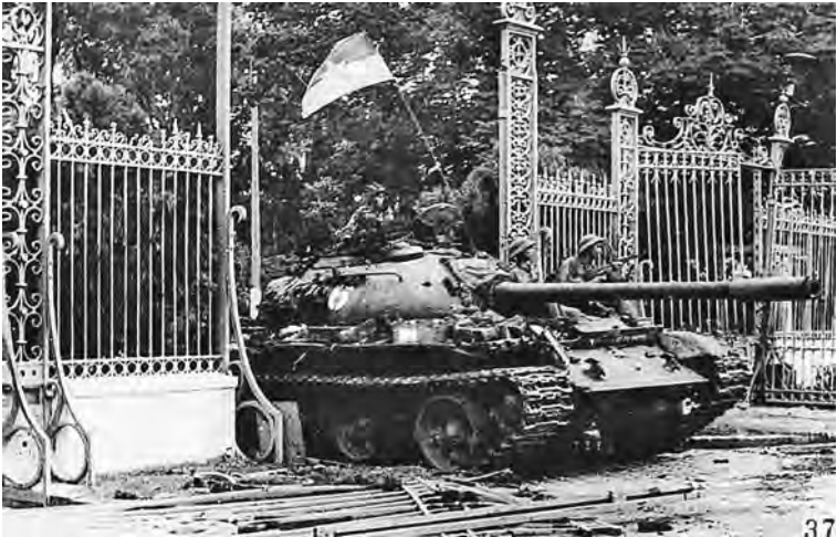
A North Vietnamese T-54 tank, supplied by the Soviet Union, crashes through the gates of the Presidential Palace in Saigon on April 30, 1975.

Vietnam. Out of options, Ford declared on April 23 that the Vietnam War was “finished as far as America is concerned.” 6