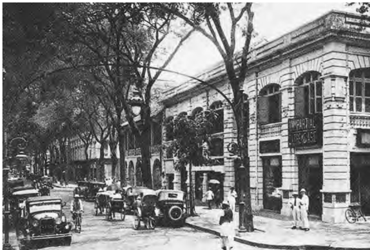
The wealth and splendor of central Saigon, depicted in this 1925 photograph, was a world apart from living conditions endured by many Vietnamese.

provided most peasants with a secure existence by assuring access to small plots of lands. The new system imposed by France prized efficiency and profitability—objectives that could best be achieved by concentrating land in the hands of a small number of technologically advanced producers. French laws helped attain this goal by enabling wealthy entrepreneurs to claim land long cultivated by Vietnamese peasants and to purchase newly opened areas. New taxes imposed by colonial authorities, along with the establishment of French-controlled monopolies on salt, alcohol, and opium, also hurt small farmers. Unable to earn sufficient cash, many went into debt and ultimately were forced to sell their plots to wealthy speculators or planters.