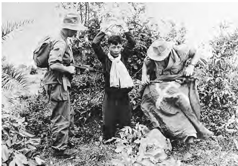
French Foreign Legion soldiers capture a Viet Minh fighter, along with a flag bearing the communist hammer and sickle, near Saigon in November 1950.

that have achieved the victory of their own revolution to support peoples who are still conducting the just struggle for liberation,” one senior Chinese leader, Liu Shaoqi, told a DRV delegation visiting Beijing. The Chinese government quickly promised to send unlimited assistance. 7