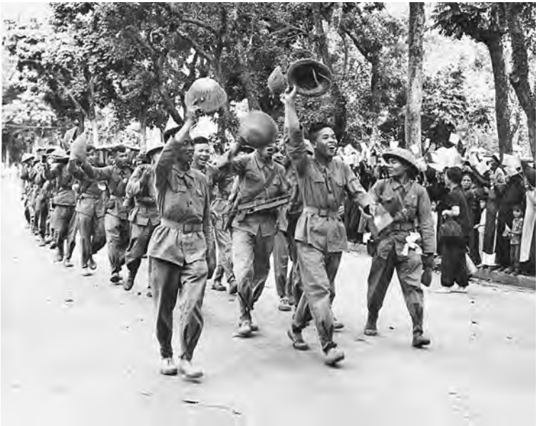
Victorious Viet Minh soldiers parade through the streets of Hanoi on October 9, 1954, reclaiming the city according to the terms of the Geneva agreement signed earlier in the year.

Right-wing critics in the United States, focusing on the “loss” of northern Vietnam, assailed the deal as a giveaway to the communists. Fearing political damage, the Eisenhower administration refused to sign the Geneva Accords, limiting itself to a frosty unilateral declaration that merely took note of the deal and pledged not to “disturb” it through force or the threat of force. 7 Behind the scenes, though, administration officials were not wholly disappointed with an outcome far better than the military situation had led them to expect. “Diplomacy,” boasted the chief U.S.