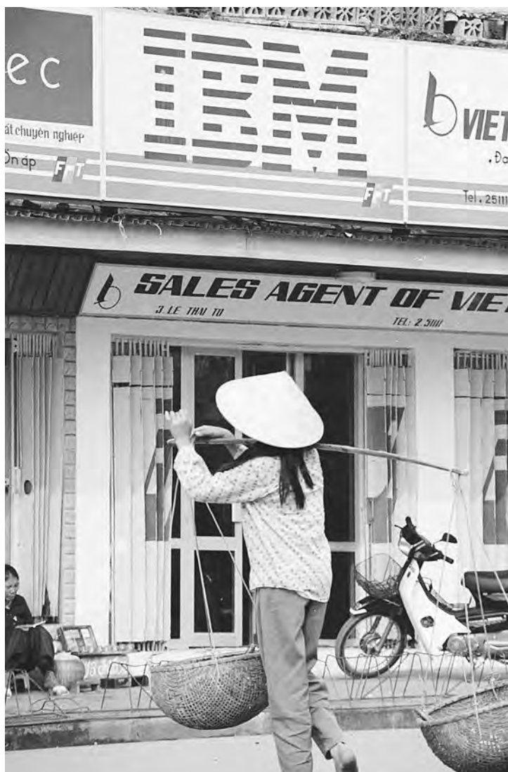
A woman walks through a new commercial district of Hanoi in January 1994, a few days before the United States formally ended its nineteen-year-old economic embargo against Vietnam.