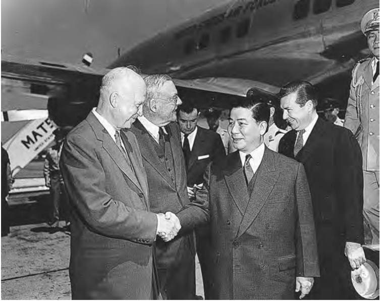
President Dwight D. Eisenhower, standing in front of Secretary of State John Foster Dulles, welcomes South Vietnamese President Ngo Dinh Diem to Washington on May 8, 1957.

worked especially hard to encourage the exodus of refugees by spreading rumors that Catholics faced persecution and even death if they stayed in the North. The United States then provided ships for a refugee flotilla that American propagandists heralded as the “Passage to Freedom.”