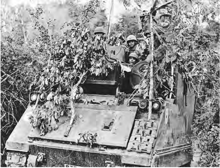
South Vietnamese troops ride a U.S.-supplied armored vehicle along the Ho Chi Minh Trail during the invasion of Laos in 1971.

massacre of more than three hundred civilians at the hamlet of My Lai, Army Lt. William Calley described savage combat conditions in which American soldiers viewed all Vietnamese as the enemy. Next, sensational media reports gave Americans new reason to doubt their elected leaders. On June 13, 1971, the New York Times began publishing excerpts of a top-secret Defense Department study that revealed, among other instances of presidential dishonesty, Lyndon Johnson's failure to inform Americans of his decisions to take the country to war in 1964 and 1965. Nixon lashed out at Daniel Ellsberg, the former government official responsible for the leak, and appealed to the Supreme Court to bar further publication of the so-called Pentagon Papers. In a landmark victory for press freedom, however, the court rebuffed