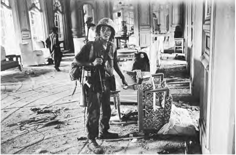
A South Vietnamese soldier poses inside the ransacked Presidential Palace in Saigon following the coup that overthrew Ngo Dinh Diem on November 1, 1963.

aides informed the conspirators that the United States stood ready to support them. This time, the generals were better organized. On November 1, 1963, they seized key installations in Saigon and demanded the surrender of Diem and Nhu. The brothers escaped the presidential palace through a secret passageway but were captured and, despite promises of good treatment, brutally murdered in the back of an armored vehicle. Diem's tumultuous nine-year rule was over.