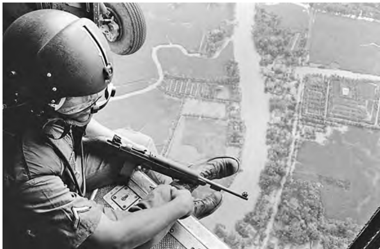
A U.S. helicopter crew chief watches ground movements during the Battle of Ap Bac on January 2, 1963.

The bubble of South Vietnamese and American optimism burst in the first days of January 1963, when NLF fighters won a stunning victory near the village of Ap Bac in the Mekong Delta. South Vietnamese forces greatly outnumbered the communists and possessed vastly superior weaponry, including armored vehicles and helicopters piloted by Americans. Yet the South Vietnamese crumbled under enemy fire. The battle revealed South Vietnamese incompetence as well as new determination among communist troops to stand and fight in the face of abundant U.S.-supplied equipment. The battle showed the “coming of age” of NLF forces, asserted communist party First Secretary Le Duan. 8 But the most important outcome of the battle, described in the American press as a major defeat indicative of deep problems in South Vietnam, was to kindle new doubts in the United States about the Diem regime.