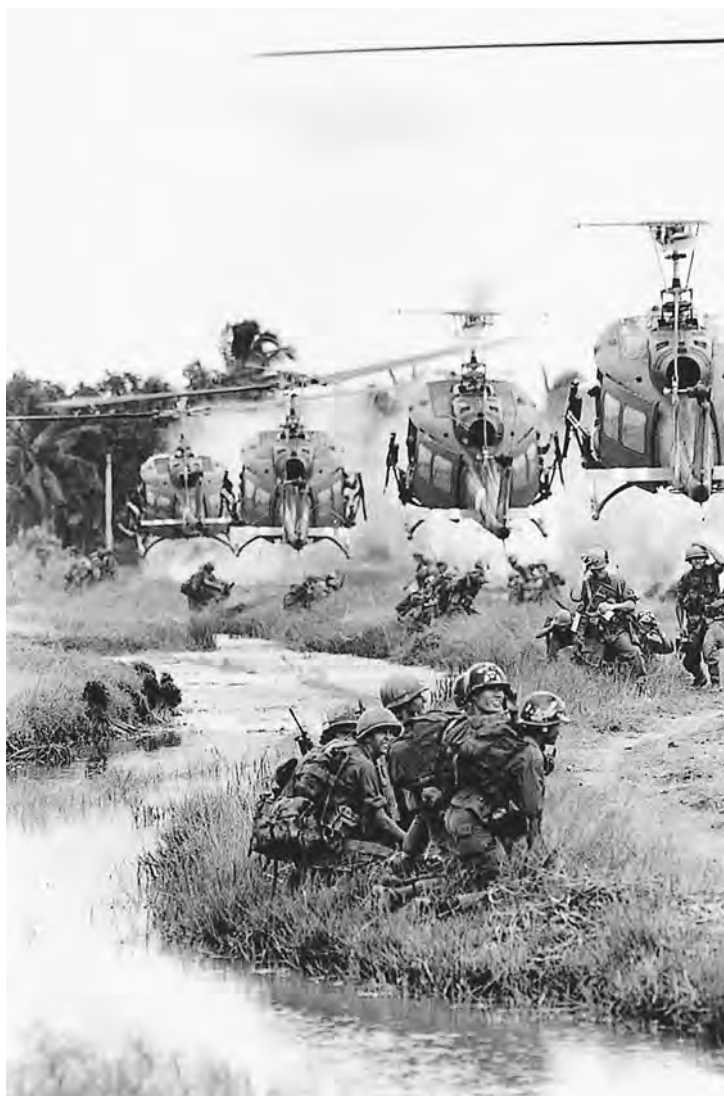
U.S. helicopters ferry American and South Vietnamese soldiers into action during a search-and-destroy mission southwest of Saigon in August 1967.