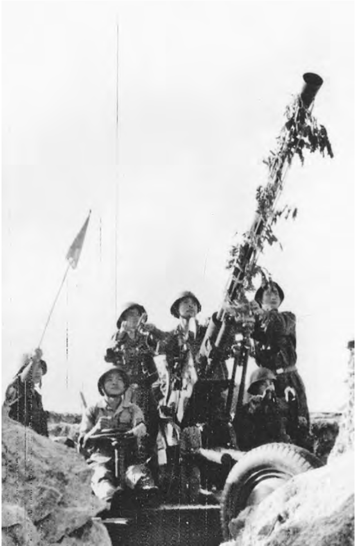
North Vietnamese soldiers operate an anti-aircraft gun near Hanoi on May 23, 1972, during U.S. bombing raids intended to punish North Vietnam for the Easter Offensive.