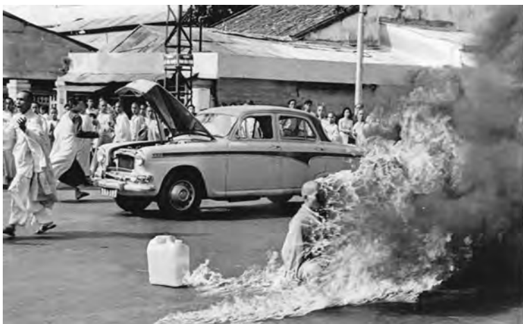
Thich Quang Duc, a seventy-three-year-old Buddhist monk, burns himself to death at a Saigon intersection on June 11, 1963.

unraveling. American outrage mounted further when Ngo Dinh Nhu's wife, best known as Madame Nhu, mocked the self-immolations as "barbeques" and expressed delight at the prospect of more. 10