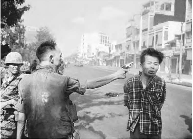
In an image that shocked many Americans, South Vietnamese national police chief Nguyen Ngoc Loan executes an NLF prisoner in Saigon on February 1, 1968.

suffered a grievous blow and wondered whether the ARVN could stand up to more hard fighting.