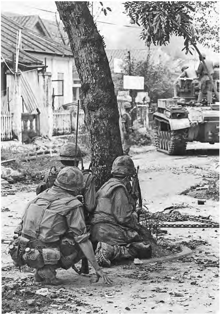
U.S. Marines huddle behind a tree on February 4, 1968, during intense fighting to dislodge communist forces from Hue.