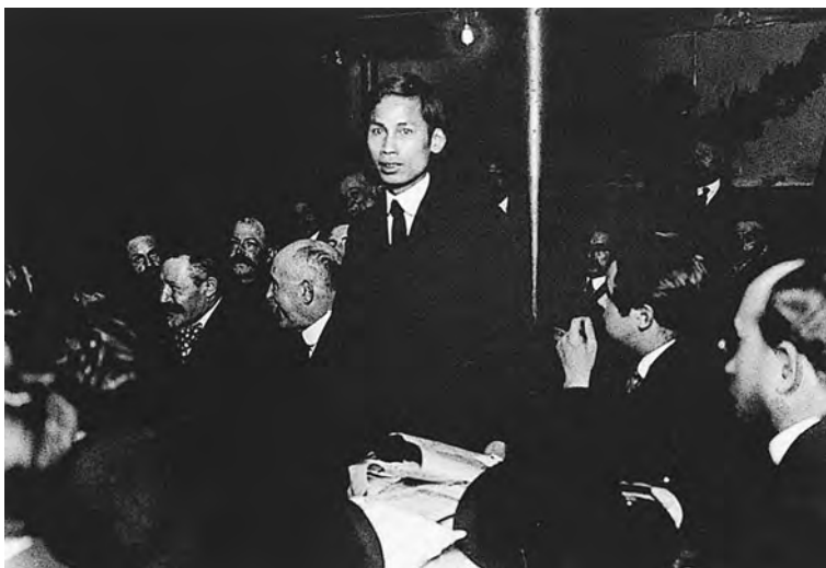
Ho Chi Minh at a meeting of the French socialist party in 1920.

Disappointed by attitudes in Moscow and aware of growing nationalist agitation in Indochina, Ho Chi Minh asked permission to return to Asia. The Comintern approved his request in mid-1924, dispatching him to the city of Guangzhou (Canton) in southeastern China. He wrote articles for a Soviet news agency and served as an interpreter for local Comintern representatives. But his primary mission was to establish a revolutionary organization among expatriate Vietnamese nationalists who had fled colonial repression in their home country. From these efforts arose Vietnam's first communist-oriented body, the Revolutionary Youth League. Although he took care to set up a small subgroup that might eventually form the kernel of a communist party, Ho Chi Minh saw no hope of inculcating the league's unsophisticated membership with full-fledged communist doctrine. Rather, as so often over the course of his life, he seamlessly blended communist