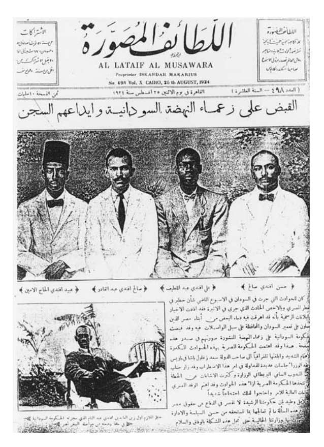
9. Front-page photographs of the White Flag League and the man whose attempt to speak to Parliament sparked the 1924 demonstrations, from al-Latā'if al-Muṣawwara , August 1924.

ment for trying to get to Cairo in order to speak to Parliament had sparked the 1924 demonstrations. The photos prominently display the leaders of the movement, but they frame a text in which these men hardly appear (see fig. 9):