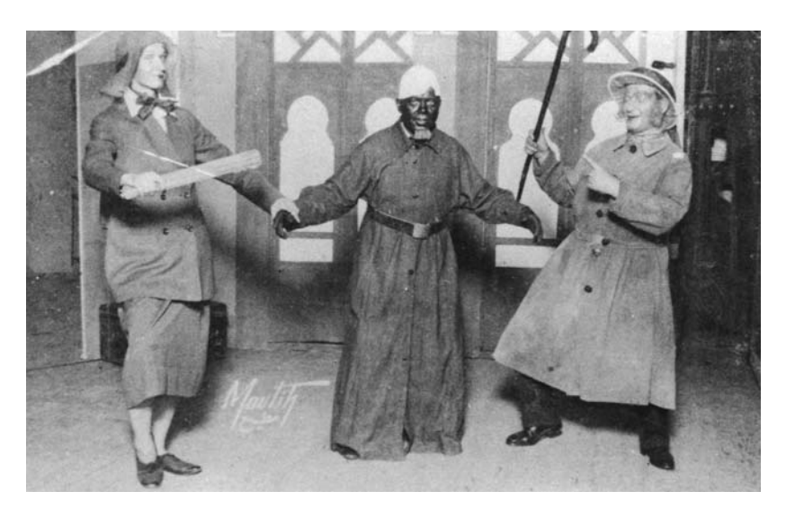
8. 'Alī al-Kassār in blackface, performing at the Du Barry Theater, Cairo, 1917, from Ministry of Culture and National Center for Drama, Music, and Folkloric Arts, "Ra'id al-masraḥ al-kūmīdī 'Alī al-Kassār."

CONSTABLE: You saw something with your own eye?