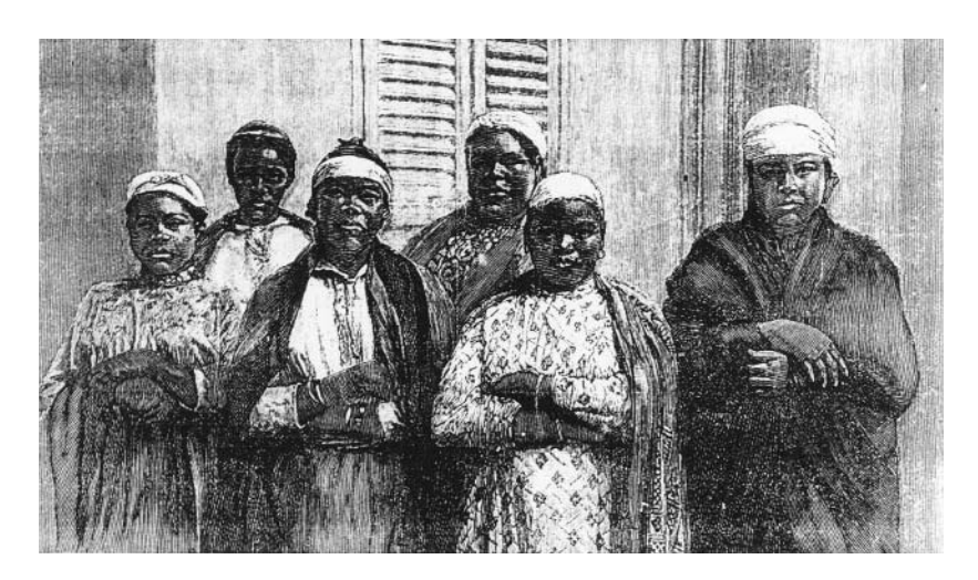
7. Drawing of the Sudanese slave women made famous in the Cairo trial of 1894, from the Anti-Slavery Record , July 1894.

of the trial's proceedings, he scoffed at this claim of marriage. If the six women were truly their wives, he asked, why did they need to be hidden when brought to Egypt? When Slave Trade Bureau agents searched the house in which the women had been hidden, why did the traders deny their presence? Why, if they were married, could the women be brought into Cairo only by night?<sup>55</sup>