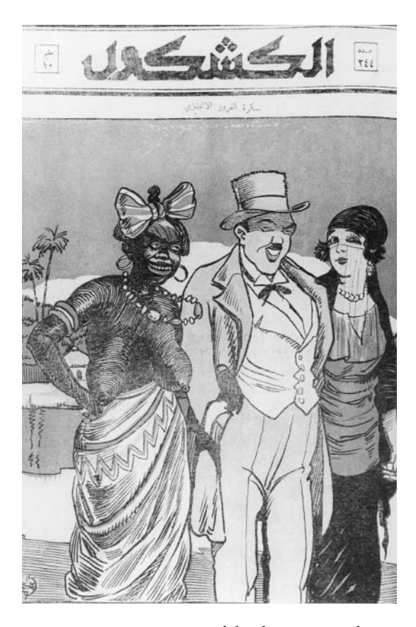
12. Front-page caricature of the threesome Sudan, Lord Lloyd, and Egypt, from al-Kashkūl , January 1926.

But such fixed images do not disguise the important changes in the relationship between Egypt and the Sudan after World War I; in fact, the images defended against the feared impact of change. This picture, for example, appeared less than a year after the imprisonment of 'Alī 'abd al-Laṭīf and the assassination of Sir Lee Stack. Although from Cairo or Alexandria they may have been difficult to hear, the voices of more and more Sudanese entered the debate over the political shape of the Nile Valley. The persistent rendering of the Sudan as this type of feminized figure shows that it was "a privileged site for a larger ideological project." In this case, the project was one in which Egyptian nationalists not only packaged the Sudan in ways that continued to bind it to Egypt but also reconstructed a political relationship