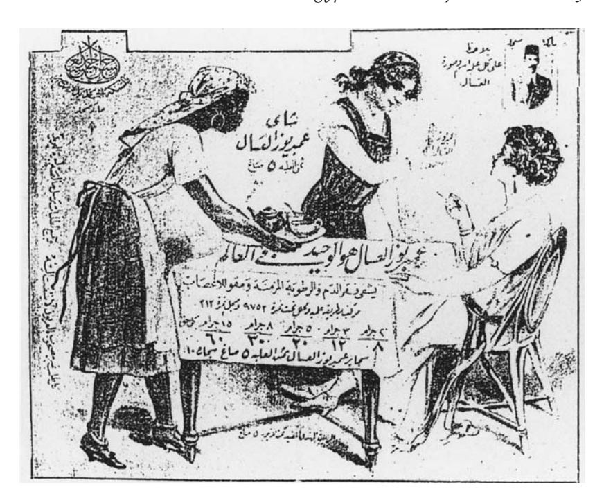
11. Servant depicted in an advertisement for tea, from al-Latā'if al-Muşawwara , September 1924.

your upbringing and education." But the Sudan answers, "Leave me alone! I'm going to my sister because I cannot live like this!" And Egypt, looking concerned over the fence, says to John Bull, "What have you to do with her? I'm her sister; I'm responsible for her." The caption goes on to explain to the readers that John Bull wants to separate the two siblings, but that nature is stronger and emotions are too powerful for this link to be broken. These emotions push the Sudan to forge a path over the obstacles put in her path to Egypt. 130 The cartoon indicates that the Sudan's actions are considered her own, but that she is so much smaller than the other two figures, and ragged and young, that one of the two, Egypt or Great Britain, has to be the caretaker. Ironically, a few pages farther on in the same issue, the message of this cartoon is complemented by an advertisement for tea, in which two Egyptian ladies talk at a table while being served by a Sudanese servant woman wearing popular khulkhāl anklets (see fig. 11). Despite the coverage of the intense and violent demonstrations in Khartoum, these images keep the Sudanese bent over in peaceful submission. Little wonder then that the idea of Nile Valley unity was loaded and troubling for so many Sudanese.