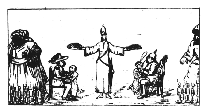
Caricature of the Sudanese Mahdī addressing his followers, from Ab\bar{u} Nazzara Zarga, 1885.

circled around him, but at the reader, and the caption underneath describes the scene simply as a speech to his men. Facing an even greater challenge than that seen by Ṣanū'a and his servant, the Mahdī and his men show no fear, only heroism. Şanū'a drew the strength of this Mahdī in even larger strokes in the second cartoon, published in 1885, in which the figure of England, a feeble old lady, stands dwarfed between her two biggest foreign policy problems, Russia and the Sudan (see fig. 3). This time, the Sudan is personified as an obese man with a dagger hanging from his robe, about to gobble up tiny British soldiers. The Sudan figure here is exaggerated and oversized, but not infantilized. This warrior represented the external, foreign Sudanese for Ṣanū'a, not always understandable but ever worthy of respect, different from the domesticated brother who worked in the interior world of Egyptian society.<sup>30</sup>