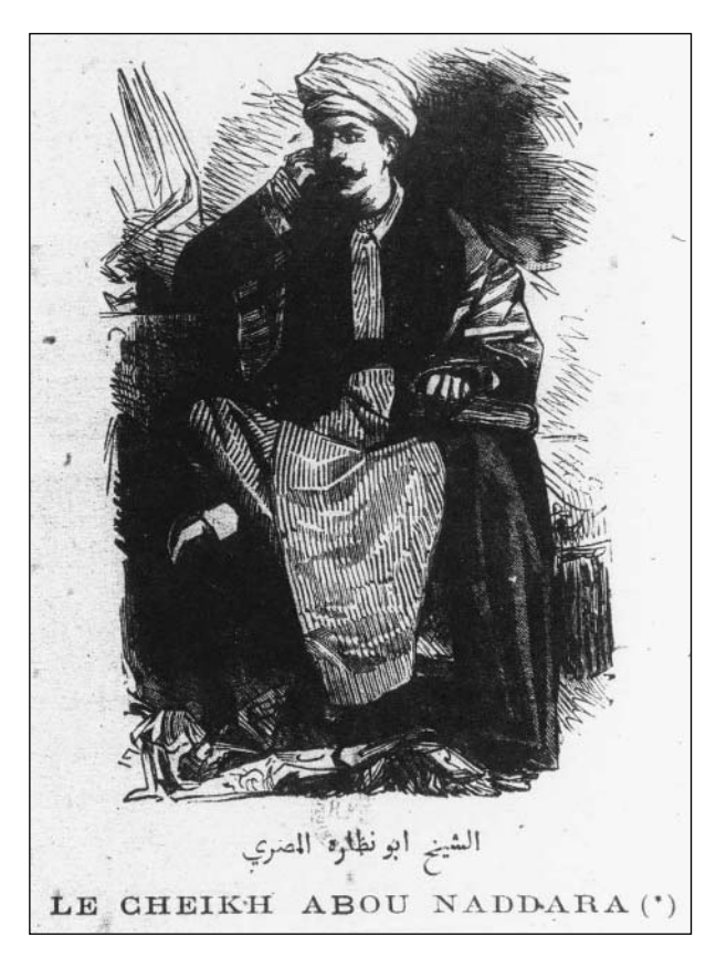
Self-portrait of Ya'qūb Ṣanū'a, published in Paul de Baignières, L'Égypte satirique: L'Album d'Abou Naddara (Paris: Imprimerie Lefebvre, 1886).