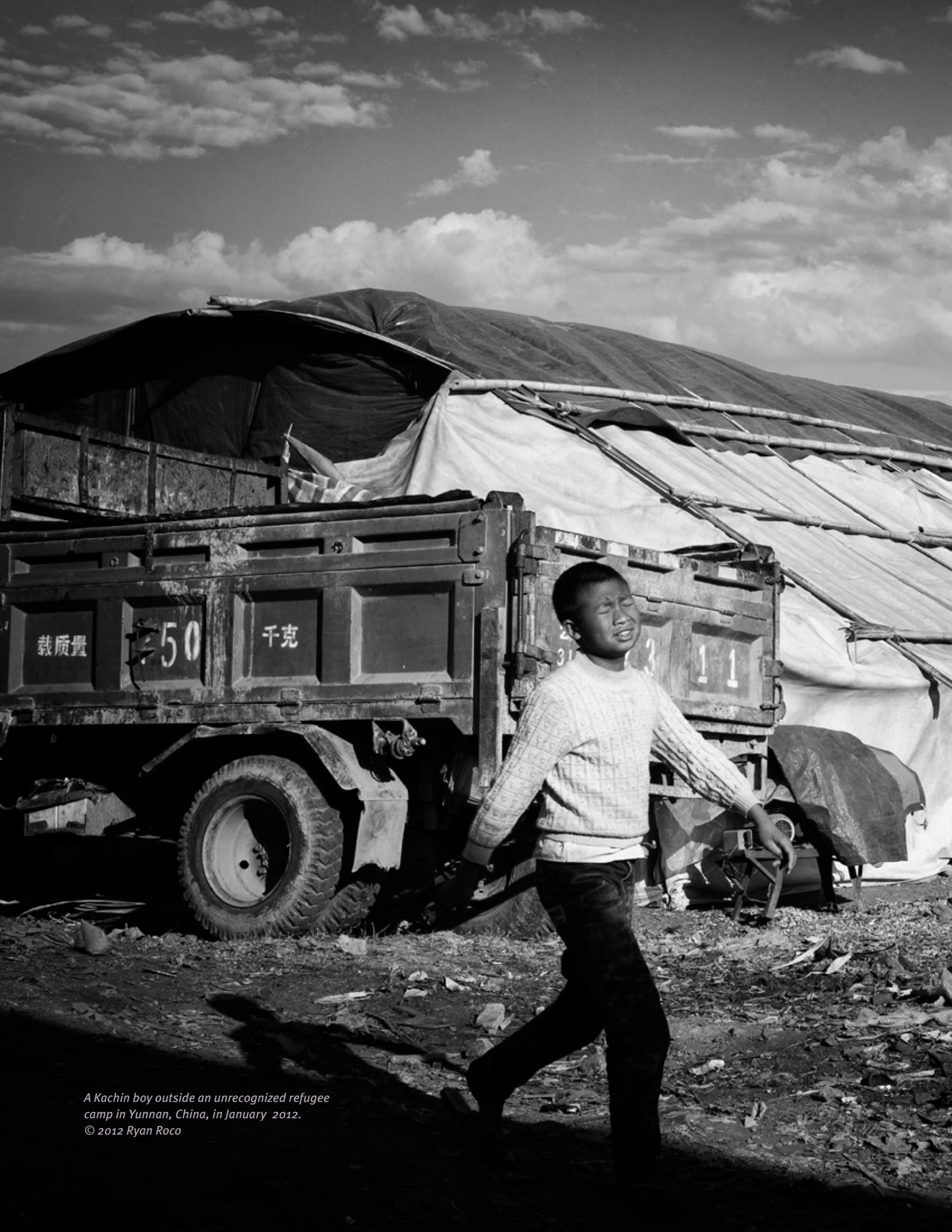
A Kachin boy outside an unrecognized refugee camp in Yunnan, China, in January 2012.