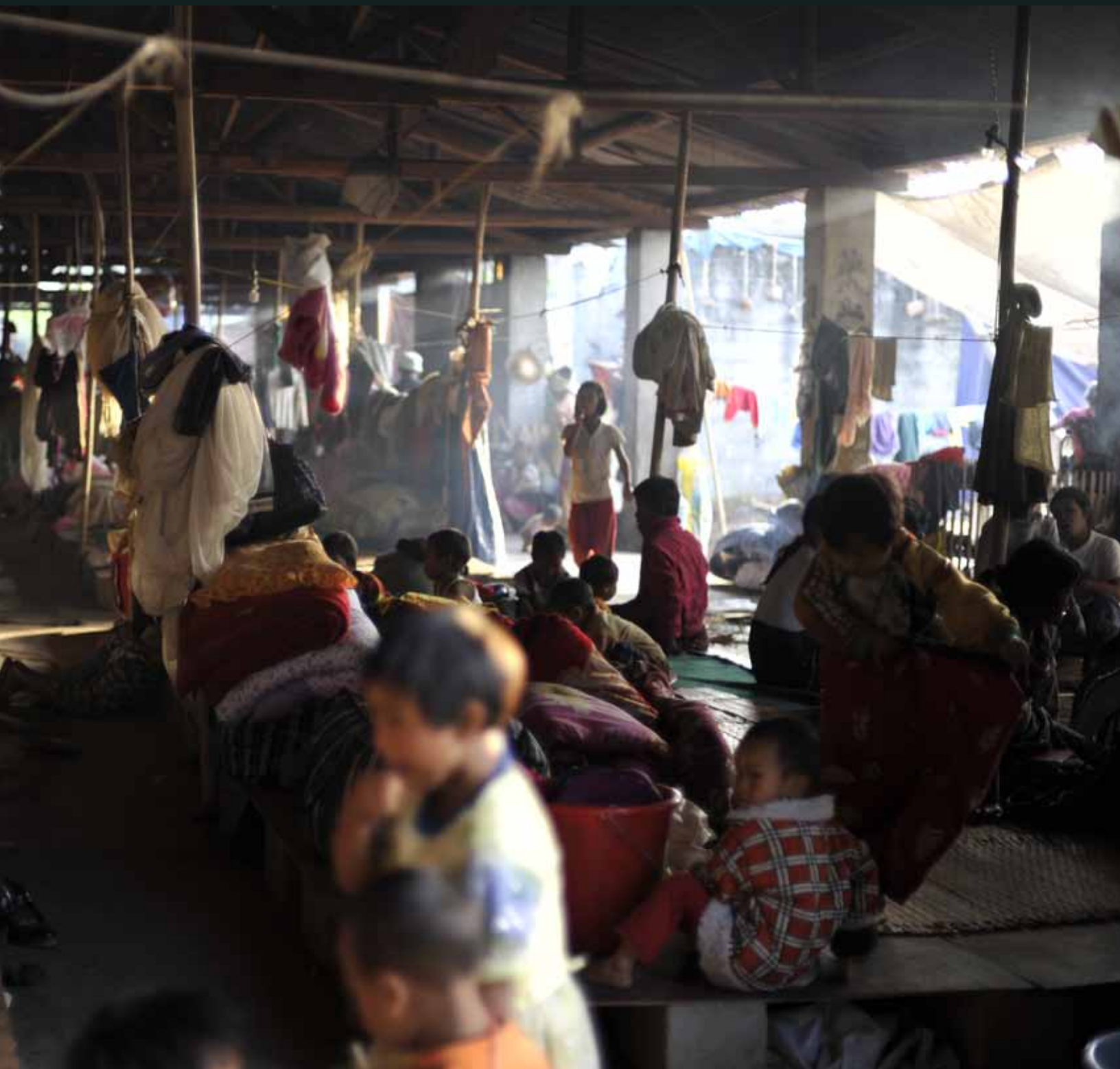
(above) Kachin refugee children in a camp in Yunnan, where they lack access to education. Refugees told Human Rights Watch that when their children are unable to attend school, they have to watch them throughout the day and cannot work to earn money to live.