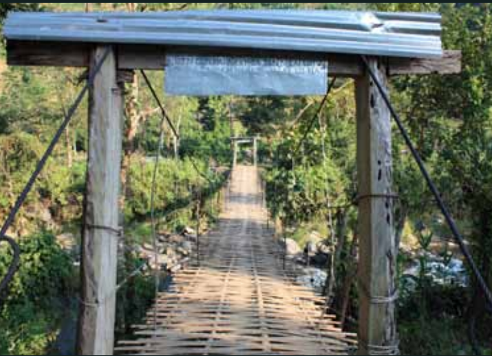
(above) A footbridge to Yunnan Province, China, located outside Laiza, Kachin State, used by Kachin refugees.