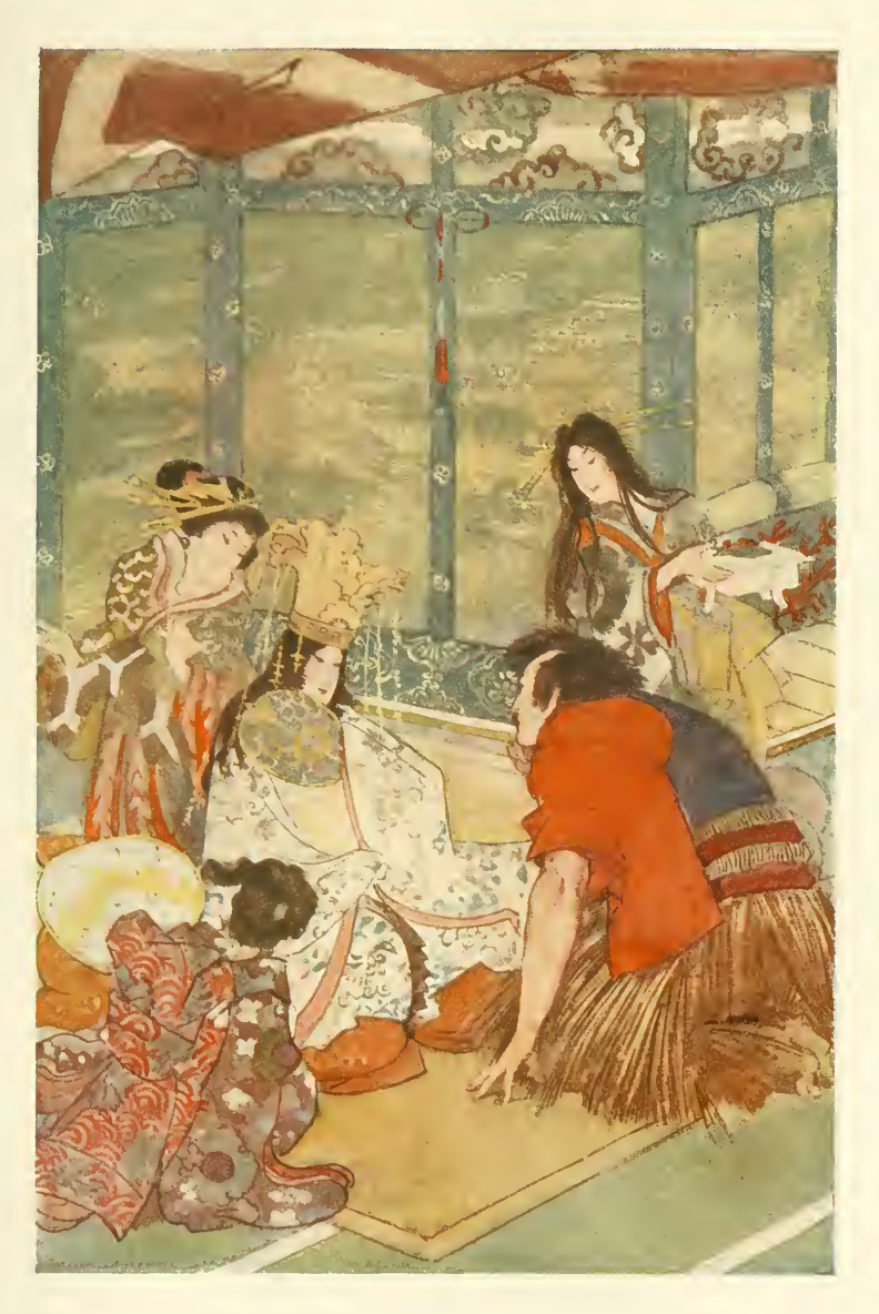
Urashima and the Sea King's Daughter