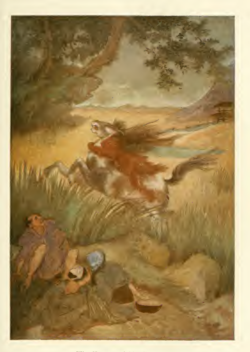
The Kappa and his Victim.