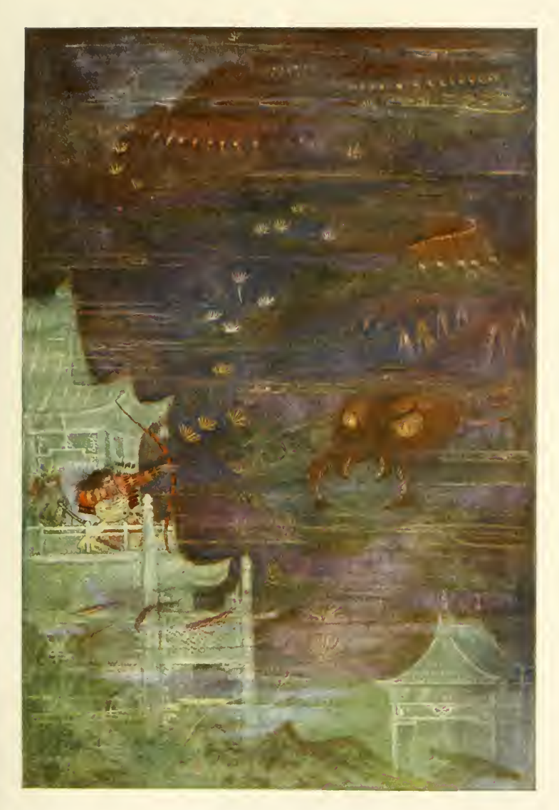
Hidesato and the Centipede.