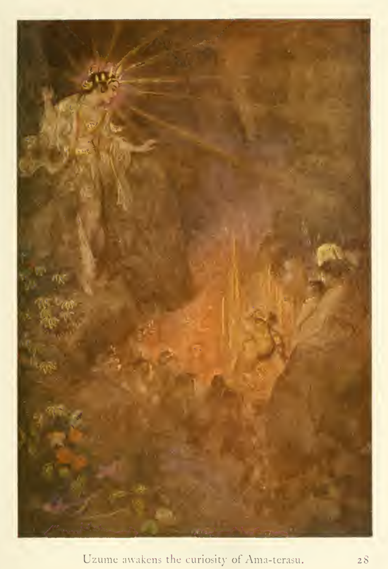
Uzume awakens the curiosity of Ama-terasu.