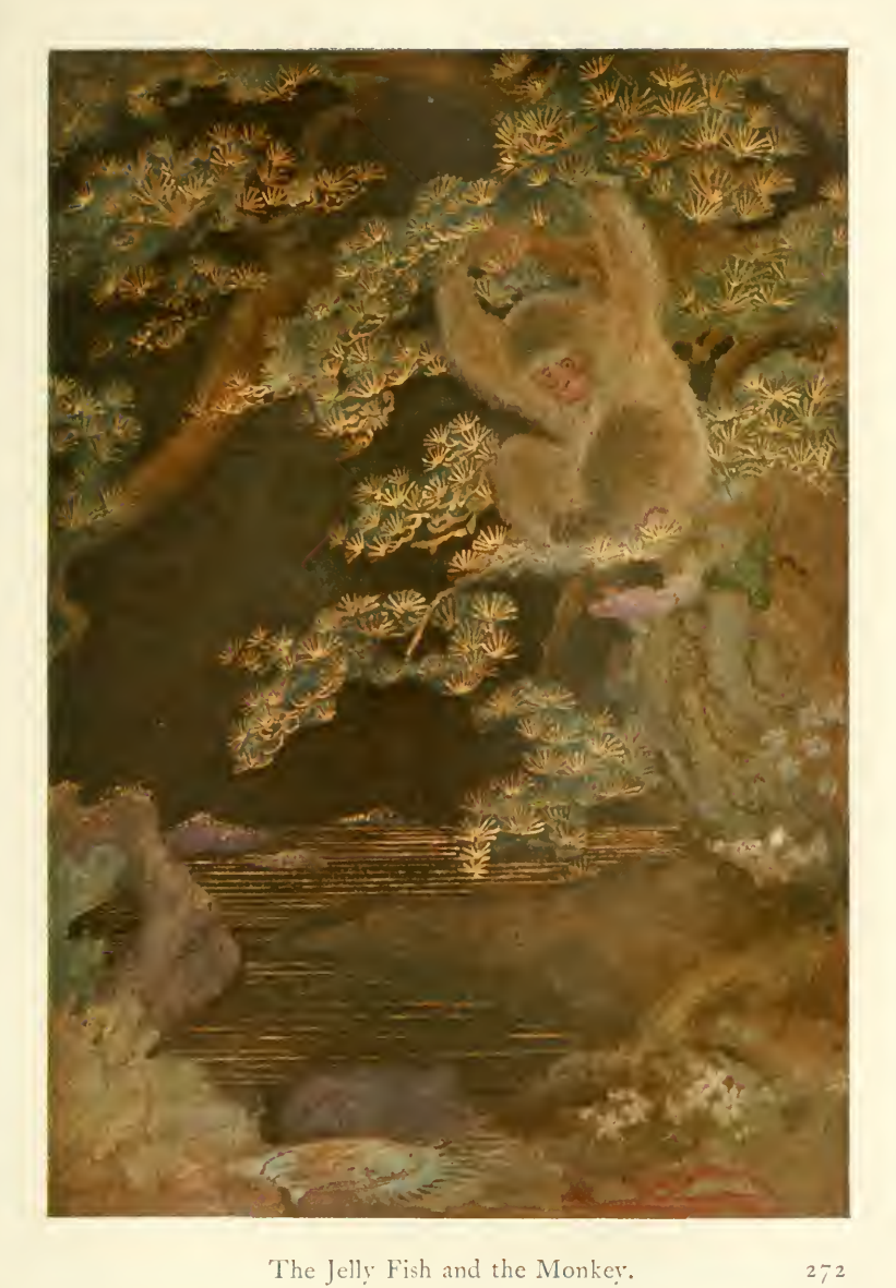
The Jelly Fish and the Monkey.