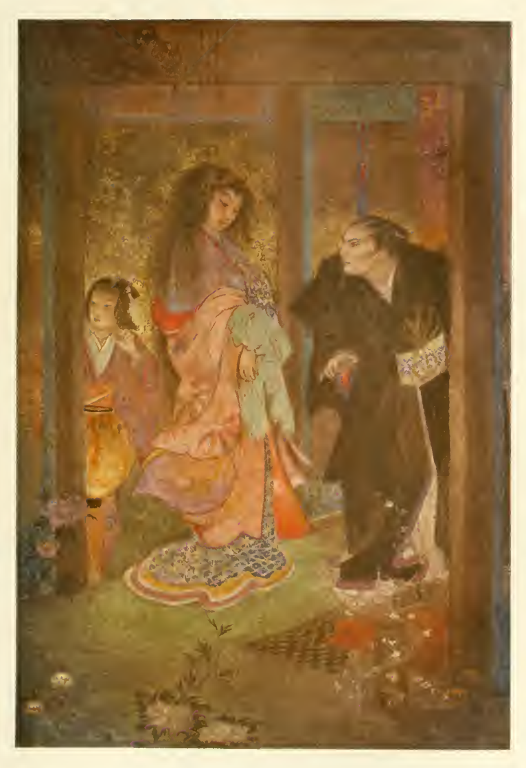
Shinzaburō recognised Tsuyu and her maid Yoné. 228