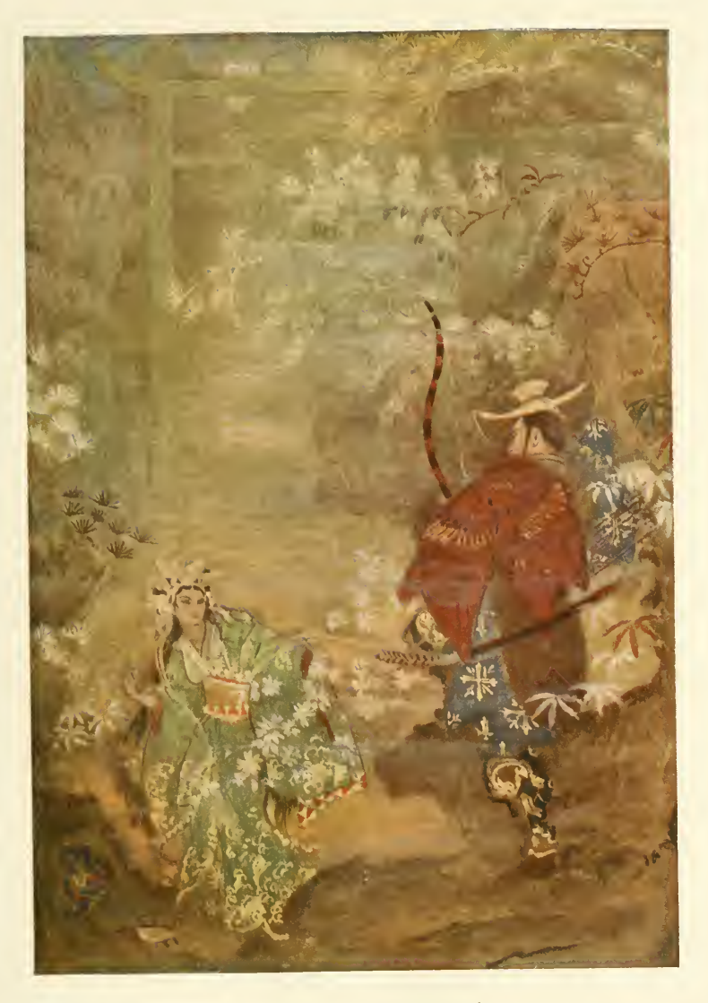
Hoori and the Sea God's Daughter.