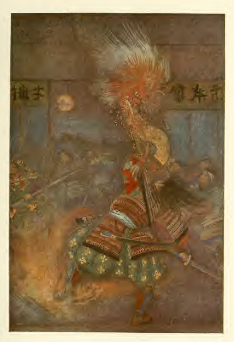
Raiko slays the Goblin of Oyeyama.