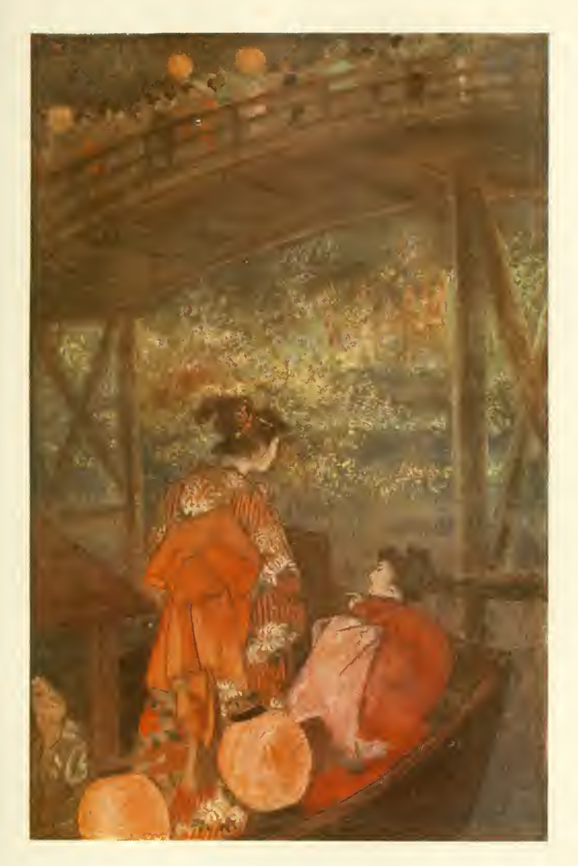
The Firefly Battle.