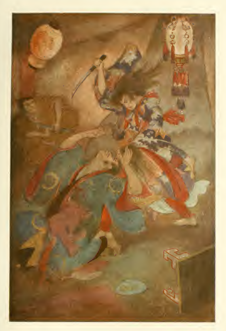
Prince Yamato and Takeru.