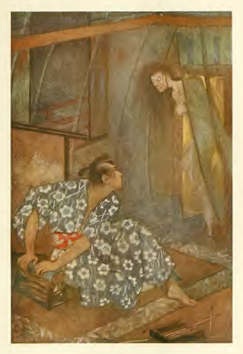
A Kakemono Ghost.