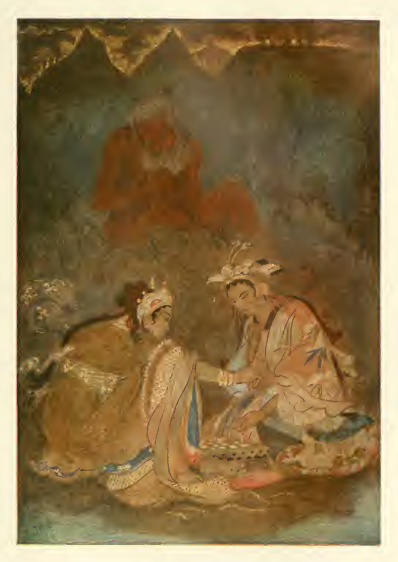
Visu on Mount Fuji-yama.