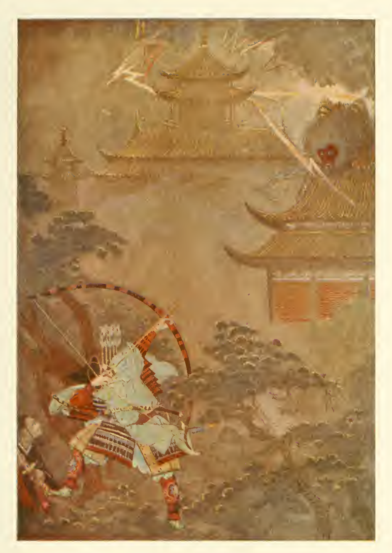
Yorimasa slays the Vampire.