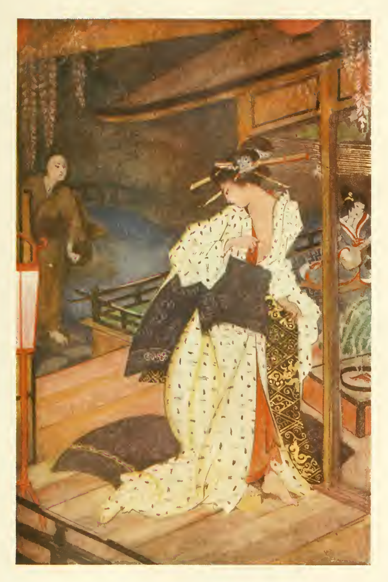
Kiyo and the Priest.