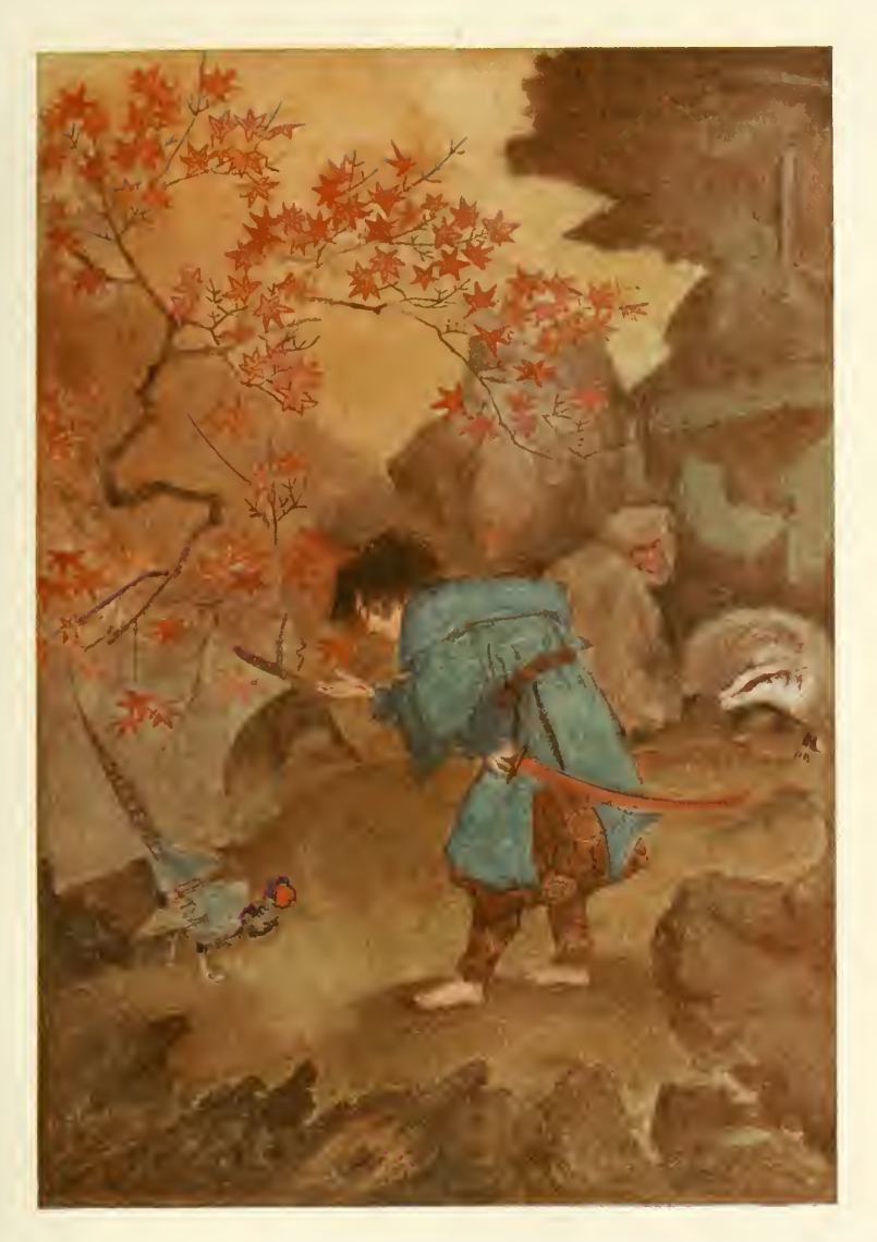
Momotaro and the Pheasant.