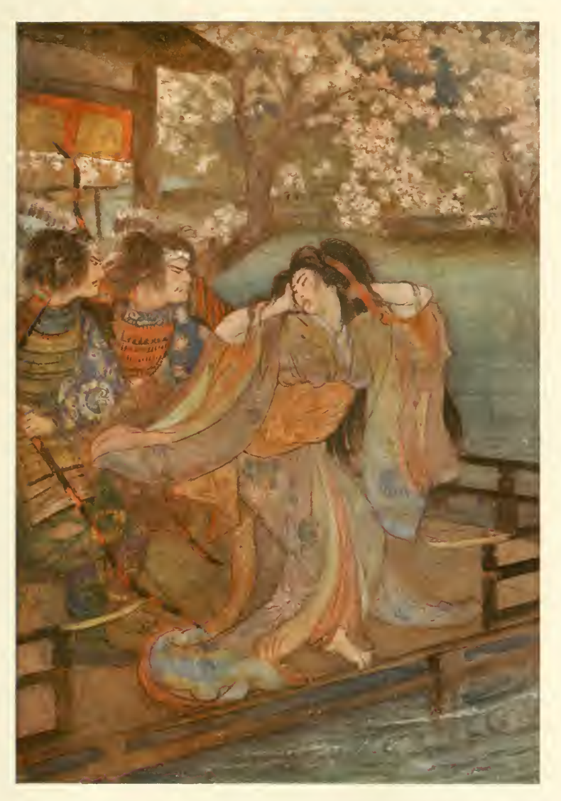
The Maiden of Unai.