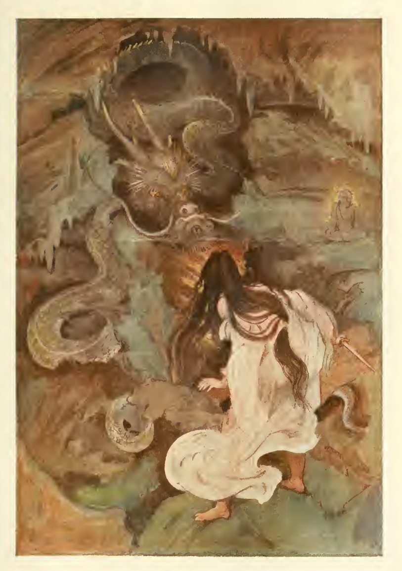
Tokoyo and the Sea Serpent.