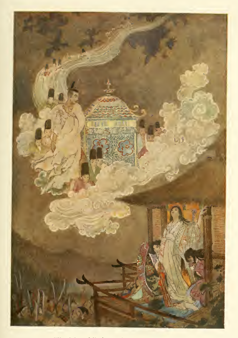
The Moonfolk demand the Lady Kaguya.