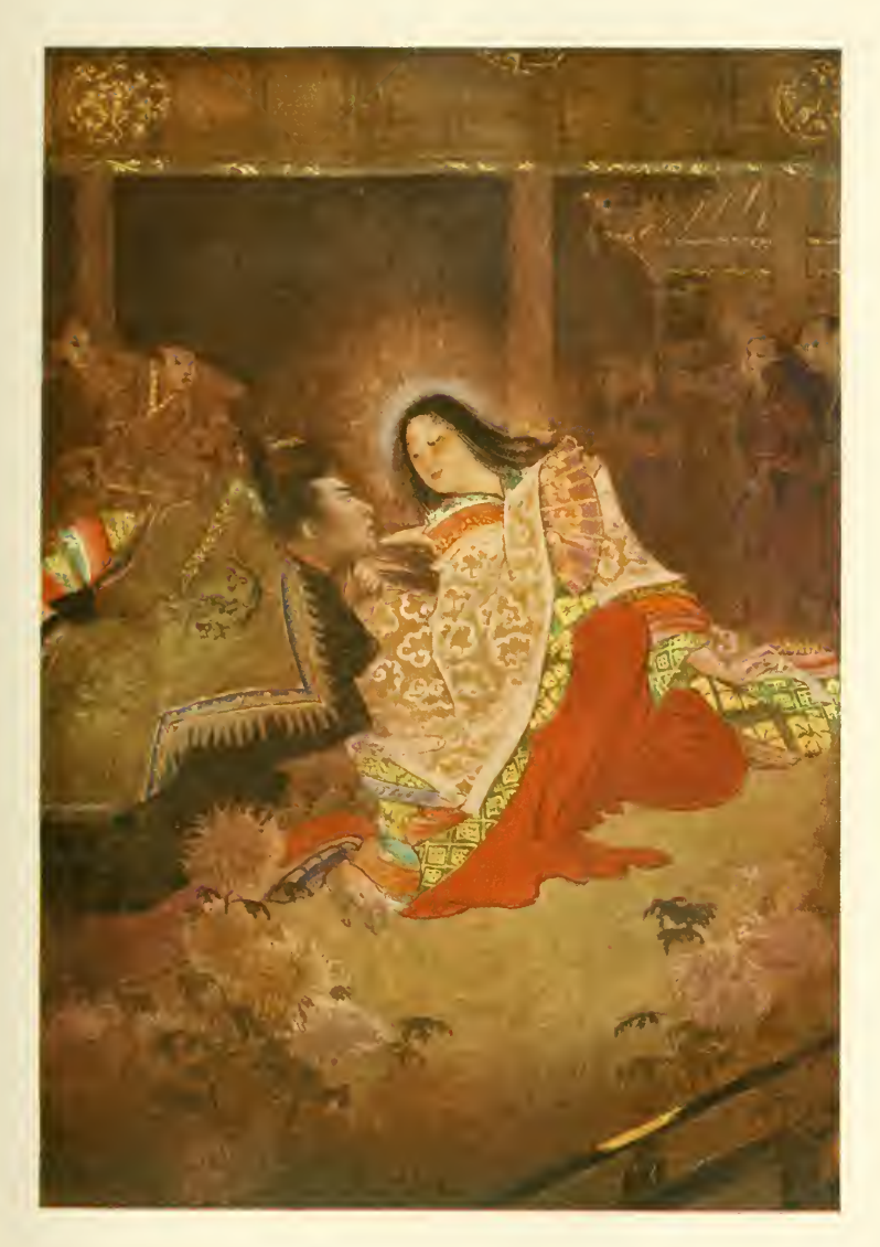
The Mikado and the Jewel Maiden.