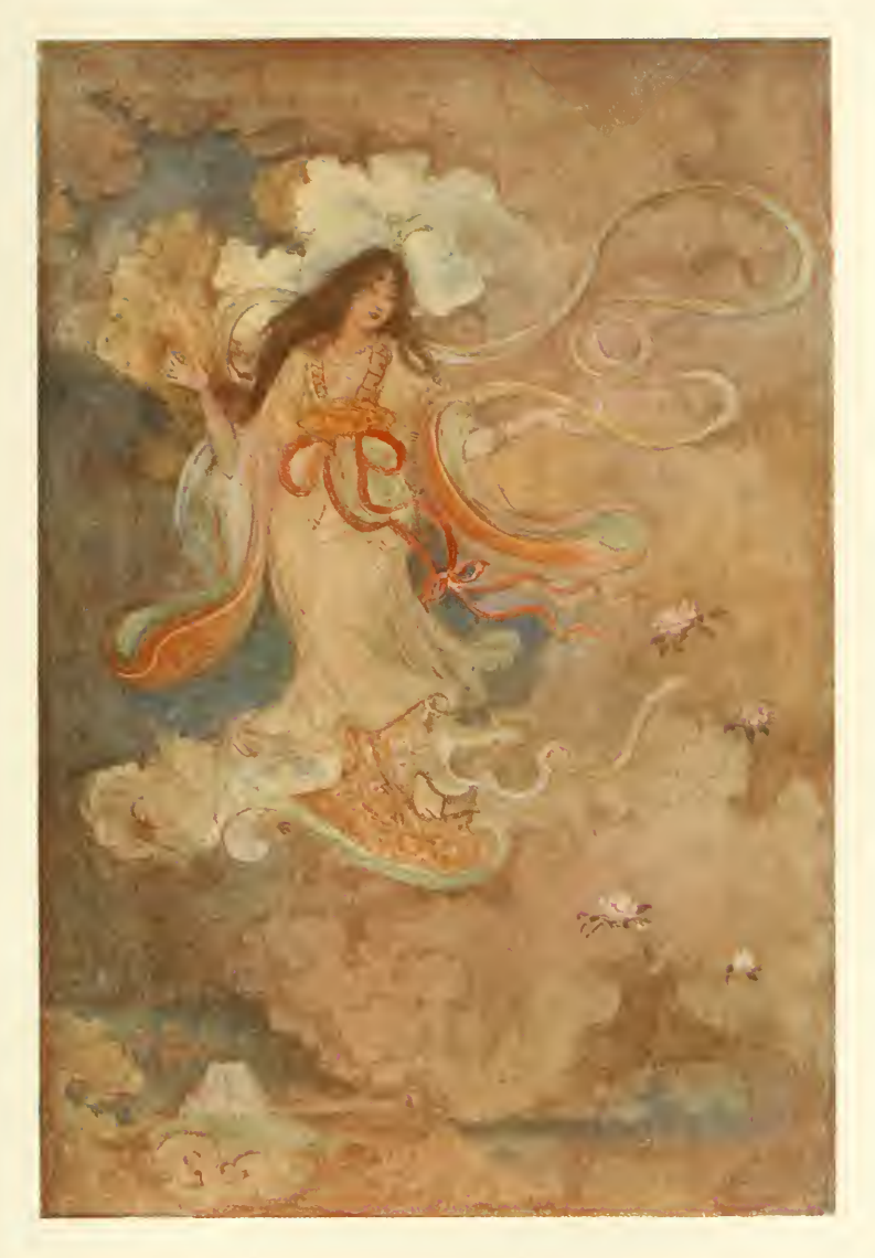
Sengen, the Goddess of Mount Fuji.