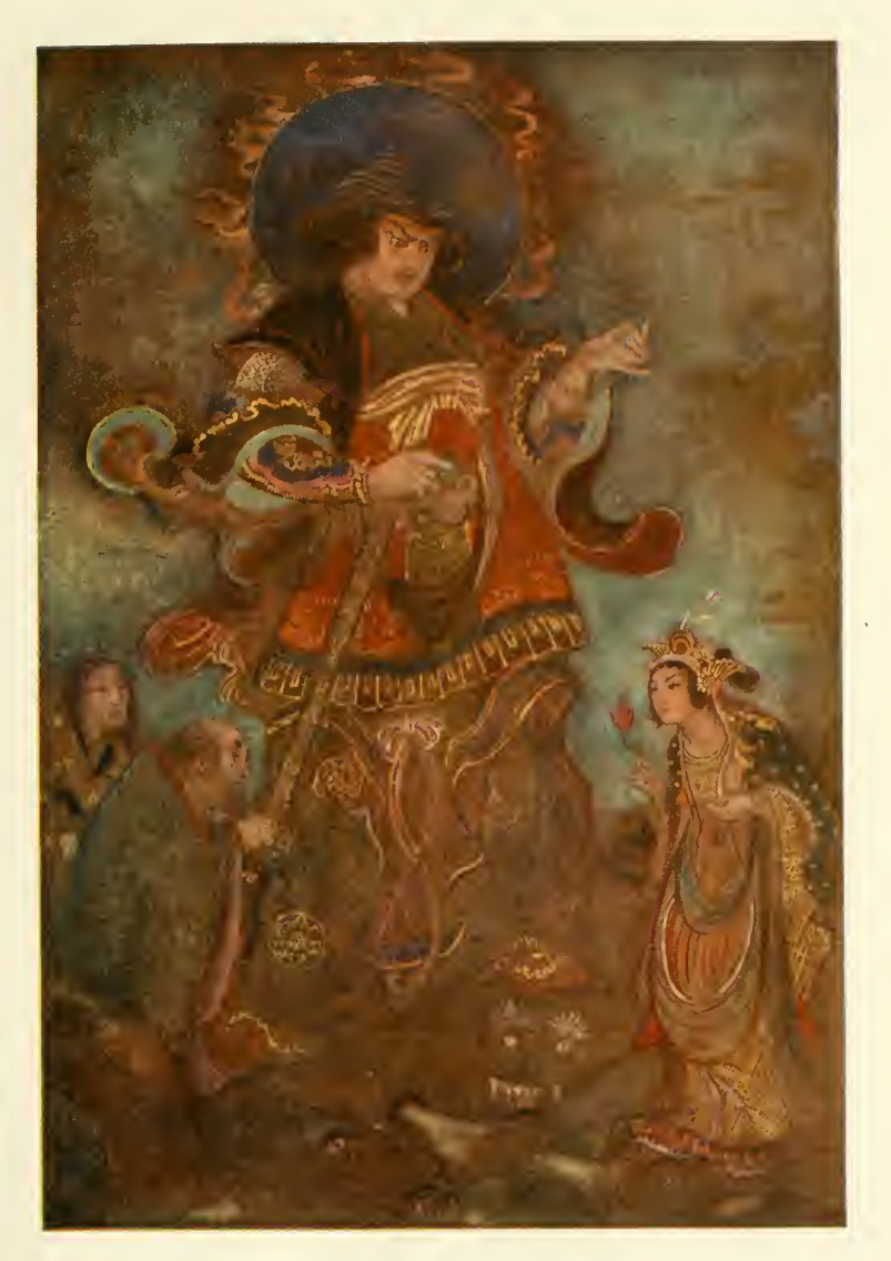
Susa-no-o and Kushi-nada-hime.