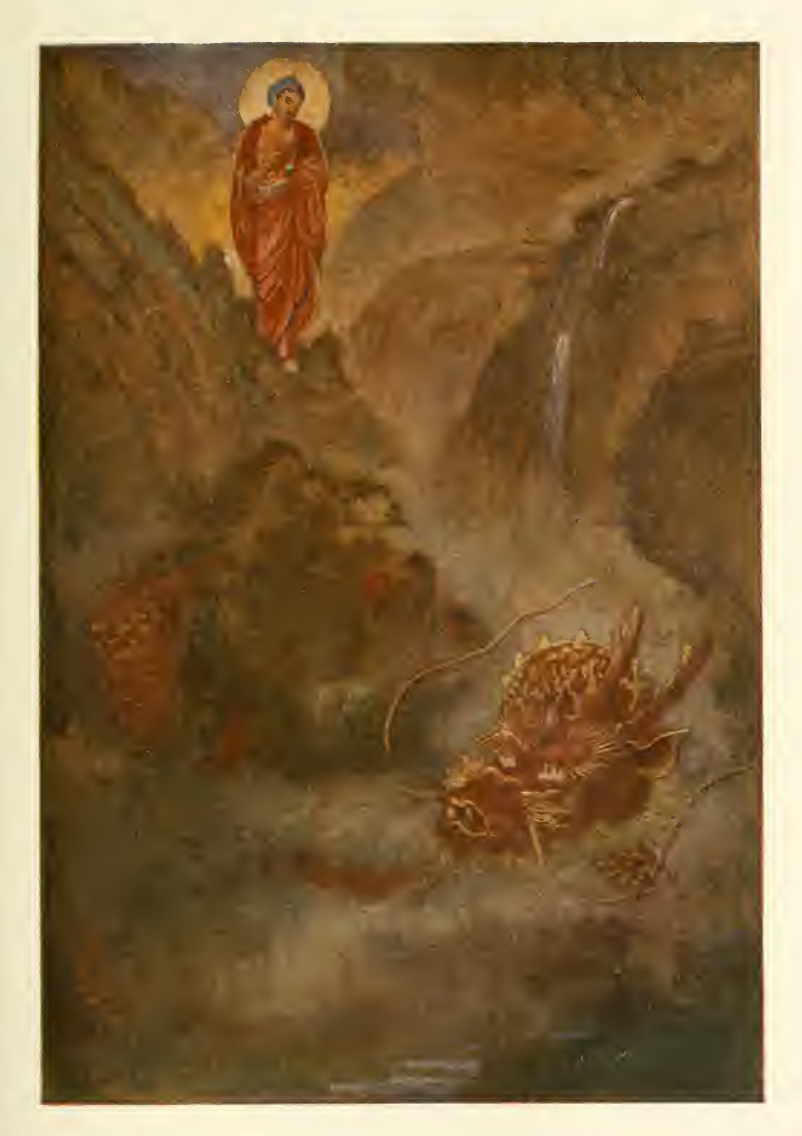
Buddha and the Dragon.