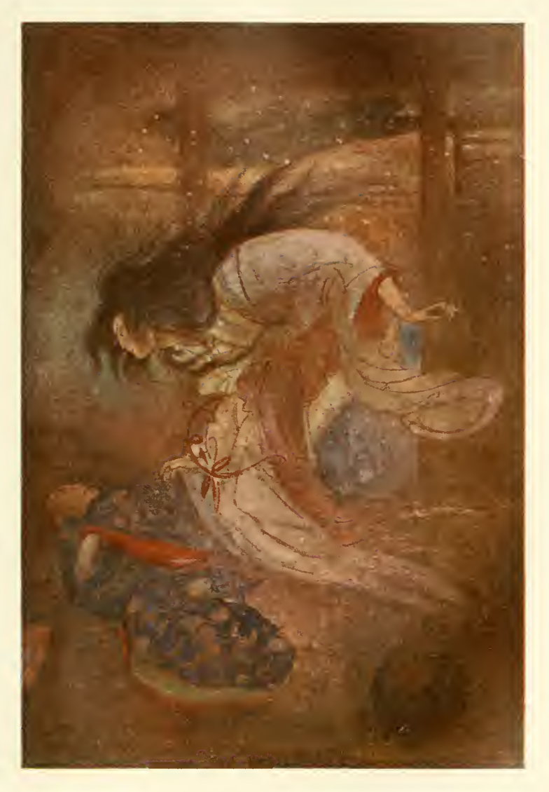
Yuki-Onna, the Lady of the Snow.