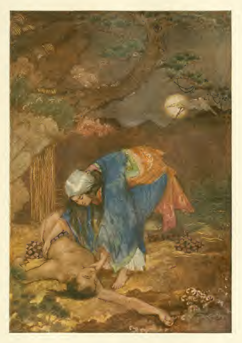
Matsue rescues Teoyo.