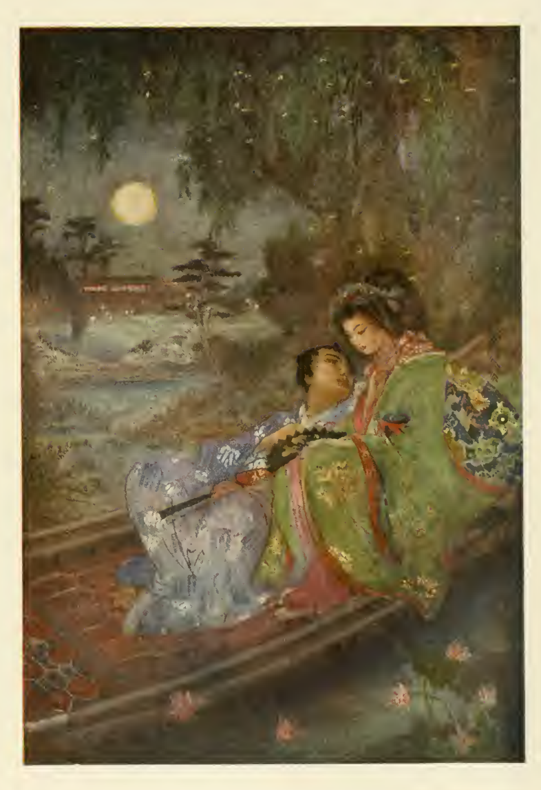
The Lovers who exchanged Fans. (See page 245)