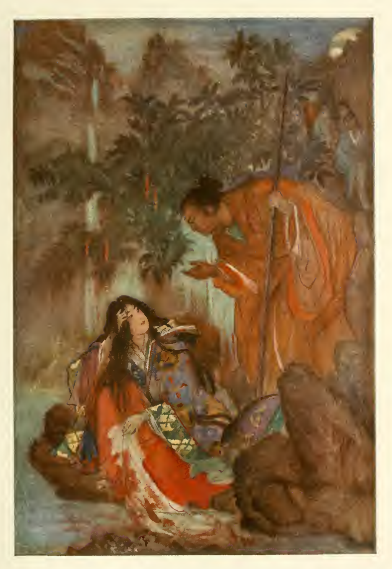
Raiko and the Enchanted Maiden.