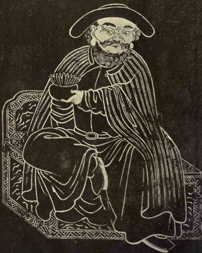
THE LO-HAN SHAN-CHU TSUN CHE. NO. 100 IN THE SERIES OF THE FIVE HUNDRED LO-HAN.