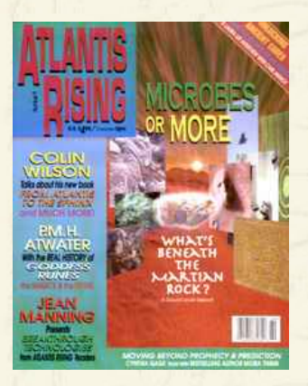
Index of Issue 9

Home | News | Archives | Streaming Media | Discussions Back Issues | Subscribe | Links