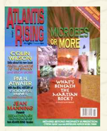
Index of Issue 9

Home | News | Archives | Streaming Media | Discussions Back Issues | Subscribe | Links