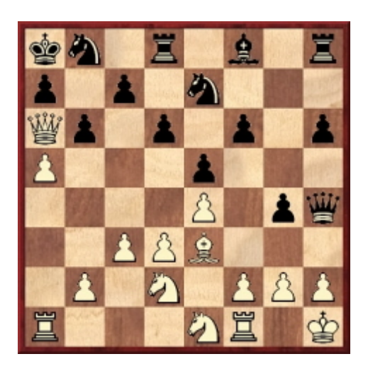
Janowsky v N.N., Paris, 1892

Play went: 16 Qxa7+ Kxa7 17 axb6+ Kb7 18 Ra7+ Kc6 19 Rxc7+ Kb5 20 Nc2 (20 c4+ would have saved a move.) 20...Nec6 21 c4 + Ka6 22 Ra1+ Na5 23 Nb4 mate.