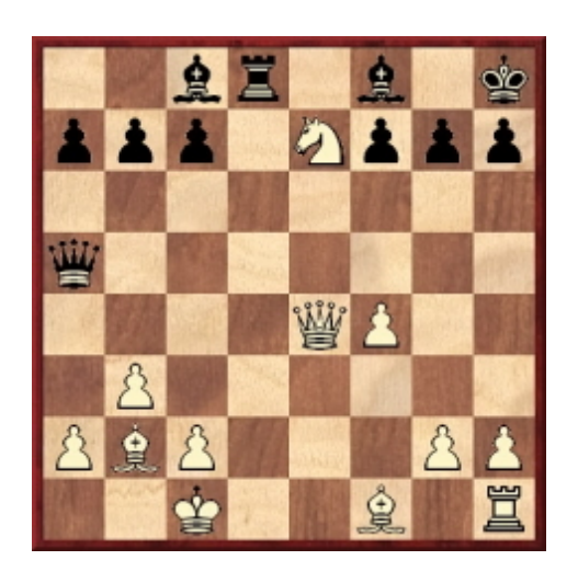
Robino v Janowsky, Paris

1...Bf5 2 Nxf5 Qd2+ 3 Kb1 Qd1+ 4 Bc1 Qxc1+ 5 Kxc1 Ba3+ 6 Kb1 Rd1 mate.