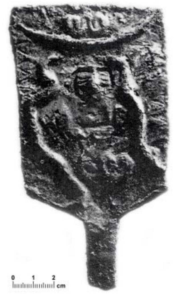
The Canaanite "cultic standard" displays a snake goddess holding a snake in each hand.

the "brass" serpent that Moses erected on a pole in the wilderness for the protection and healing of the Israelites (see Numbers 21:4–9).