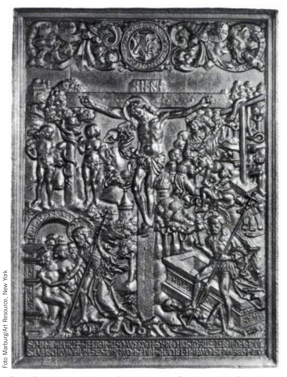
The crucified Lord is shown in the center, flanked by four scenes: The evil serpent in the Garden (upper left) is contrasted with the brazen serpent of salvation (upper right). In the Harrowing of Hell (bottom left), the triumphant Savior takes Adam by the right hand to draw him out as He treads on Death and Hell, symbolized by the skeleton and snake, which is similar to the resurrection scene on the right. The text on the bottom is from 1 Corinthians 15:22, 54–55. Decorative iron plate by Philipp Soldan, Germany, 1548.

the church—rather, as John foresaw, the church comes out of the wilderness or is restored to the earth in later times (see Revelation 14:6–7).