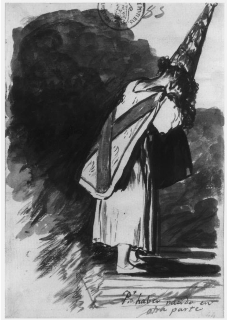
Plate 7.1 Francisco de Goya, Por haber nacido en otra parte (For being born somewhere else), 1814–24 (The Prado Museum, Madrid)