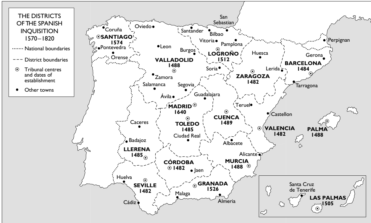
Map I Map of Inquisitorial Districts (adapted from Henry Kamen, The Spanish Inquisition: An Historical Revision , Yale University Press, 1997, p. 143)