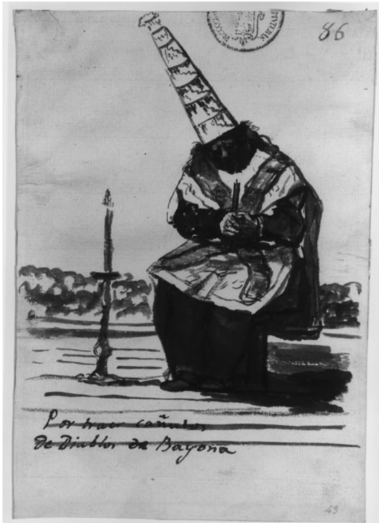
Plate 7.2 Francisco de Goya, Por traer cañutos de Diablos de Bayona (For bringing diabolical tracts from Bayonne), 1814–24 (The Prado Museum, Madrid)