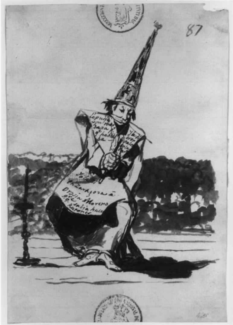
Plate 7.3 Francisco de Goya, Porque sabía hacer Ratones (Because she knew how to make mice), 1814–24 (The Prado Museum, Madrid)