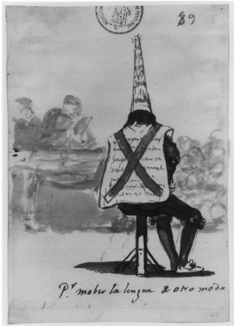
Plate 7.5 Francisco de Goya, Por mover la lengua de otro modo (For wagging his tongue in a different way), 1814–24 (The Prado Museum, Madrid)