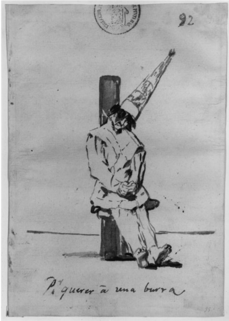
Plate 7.6 Francisco de Goya, Por querer a una burra (For loving a she-ass), 1814–24 (The Prado Museum, Madrid)