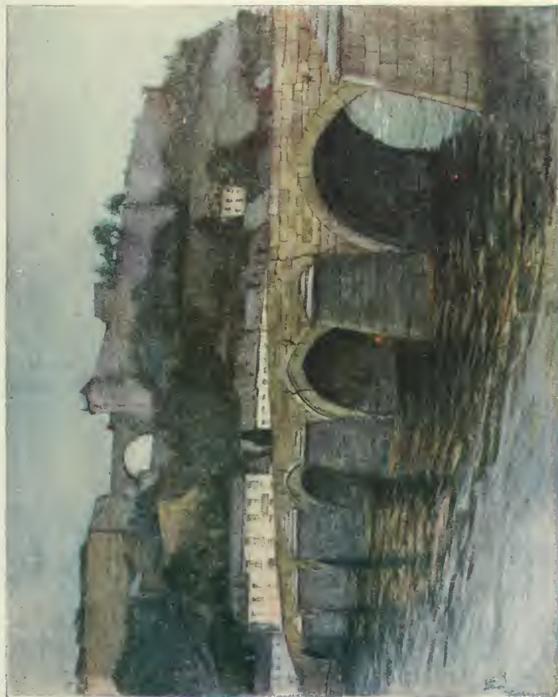
NAMUR Pont de Jambes et Citadelle