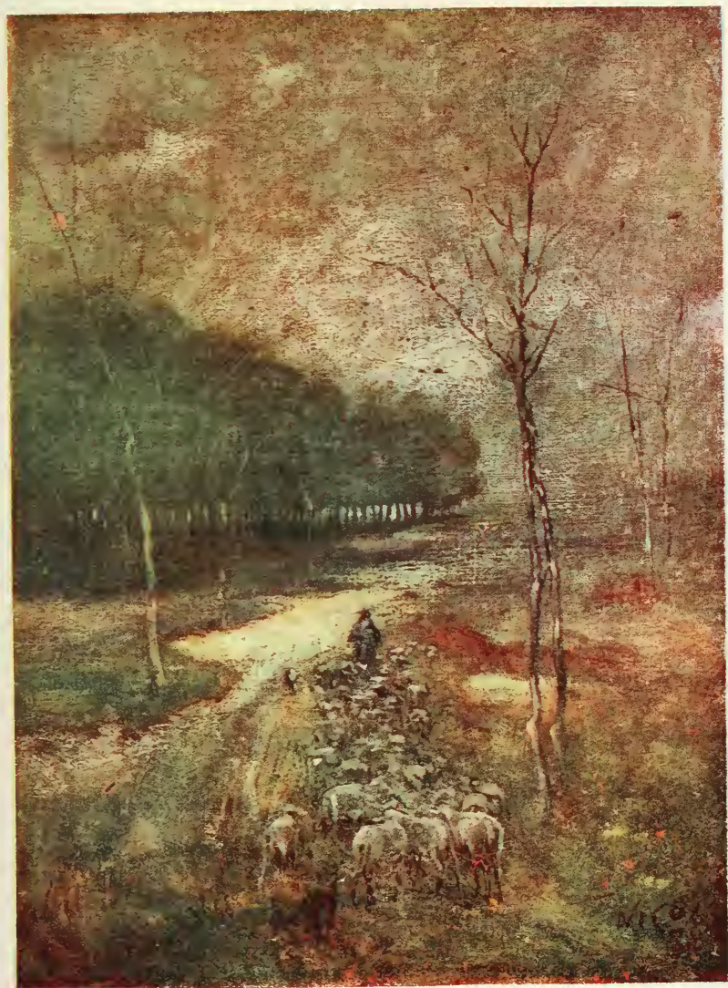
A BRABANT MOOR