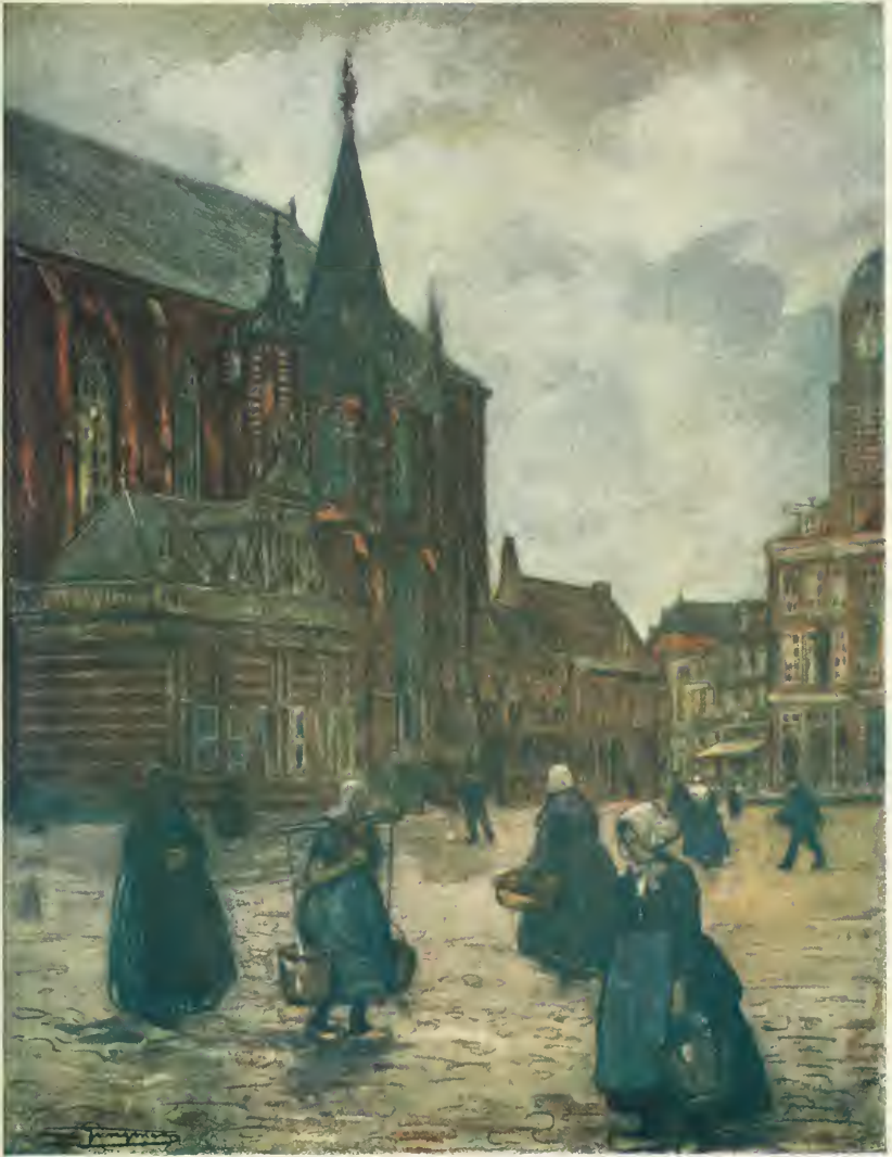
THE MARKET PLACE, BREDA