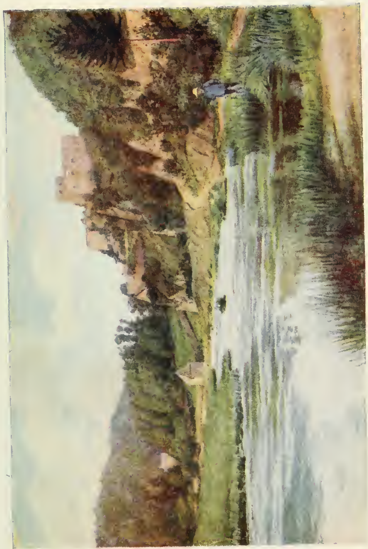
CHATEAU DE ROULLON IN THE SEMOIS VALLEY