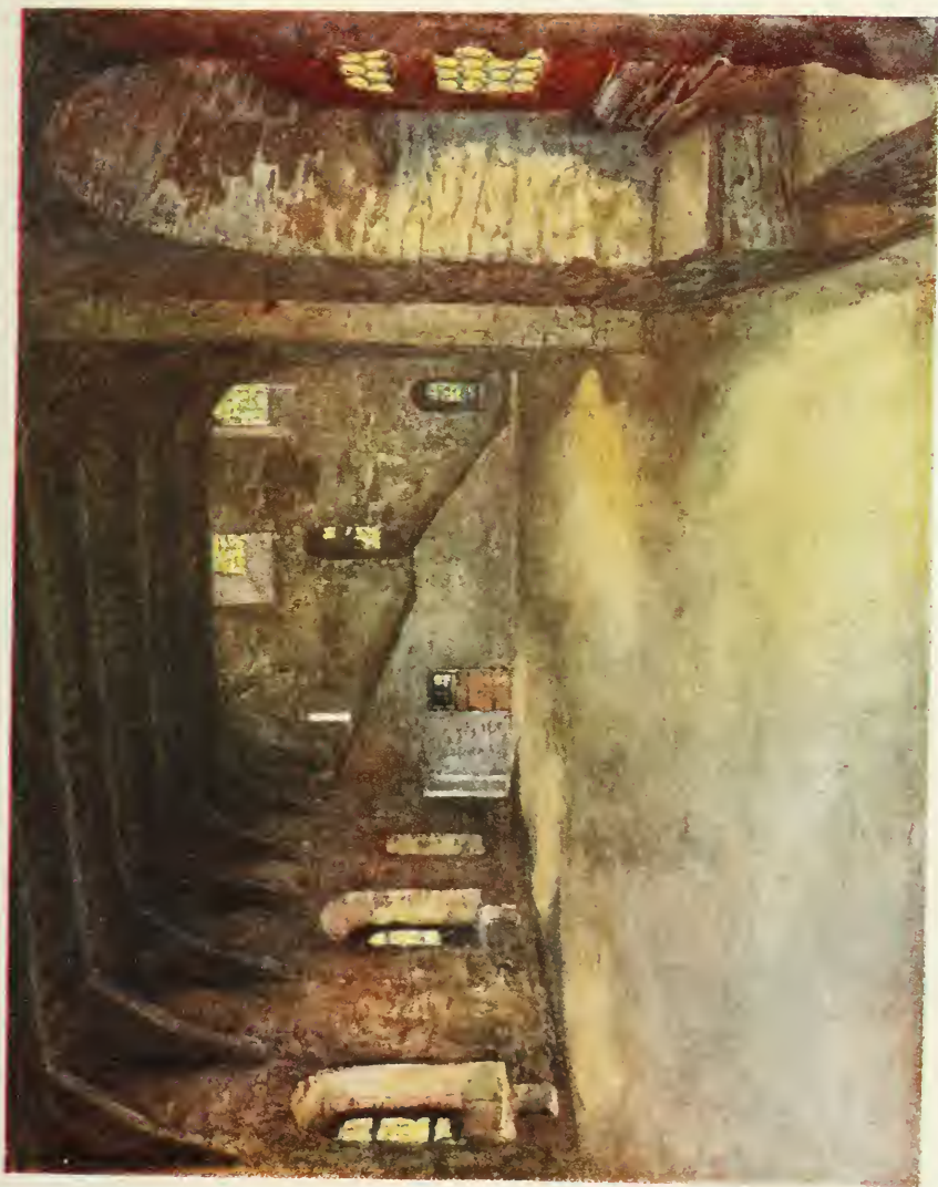
THE BANQUET HALL, CHATEAU DES COMTES, GHENT