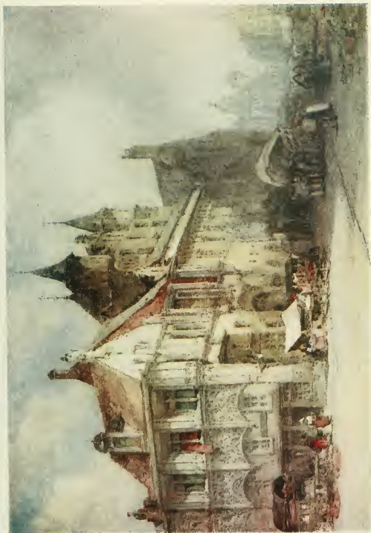
THE MARKET PLACE, MALINES (1884)