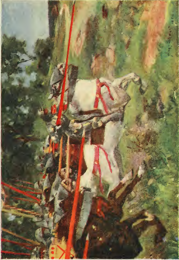
CHARLES THE BOLD CHARGING AT THE HEAD OF HIS TROOPS