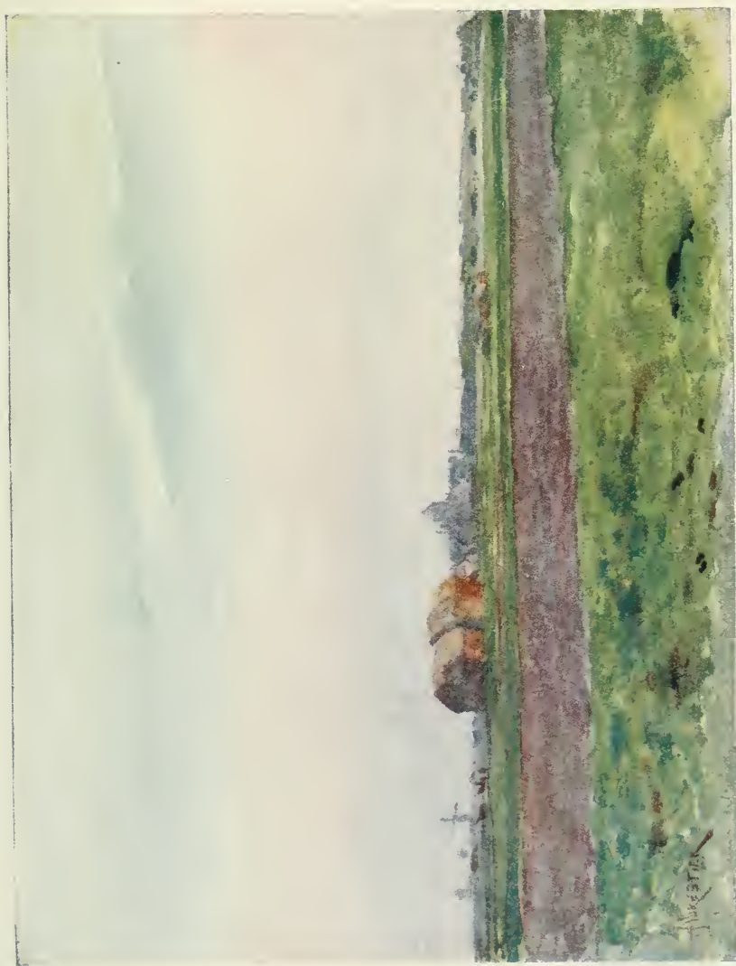
THE FLEMISH PLAIN