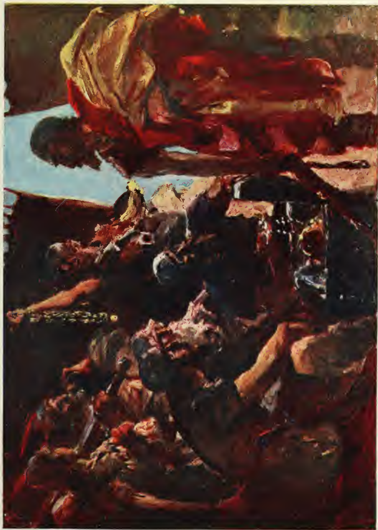
THE CAMP AND TREASURE OF CHARLES THE BOLD IN THE HANDS OF THE SWISS