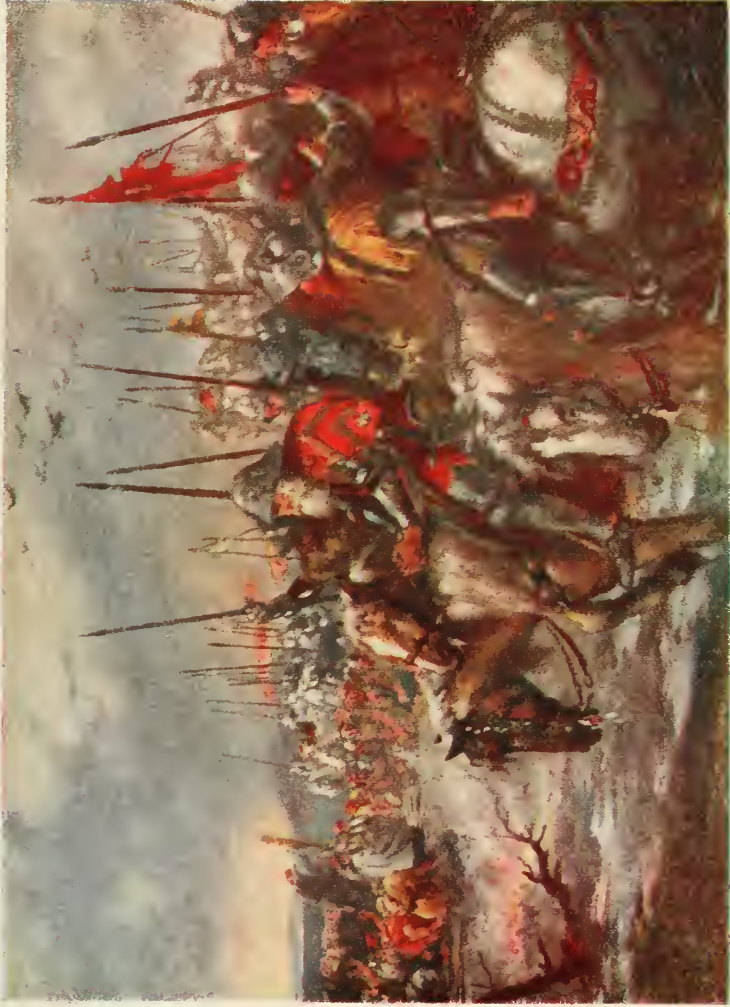
THE MORNING OF AGINCOURT After the picture by Sir John Gilbert in the Guildhall Art Gallery