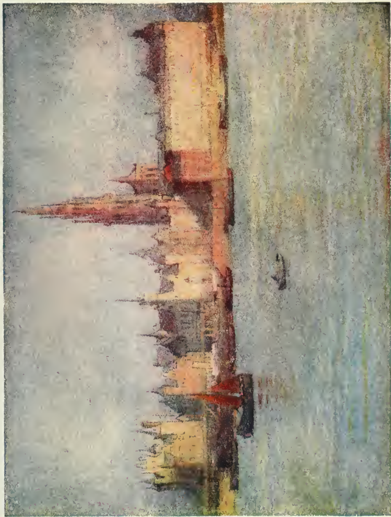
ANTWERP The Roadstead from the Tête de Flandre