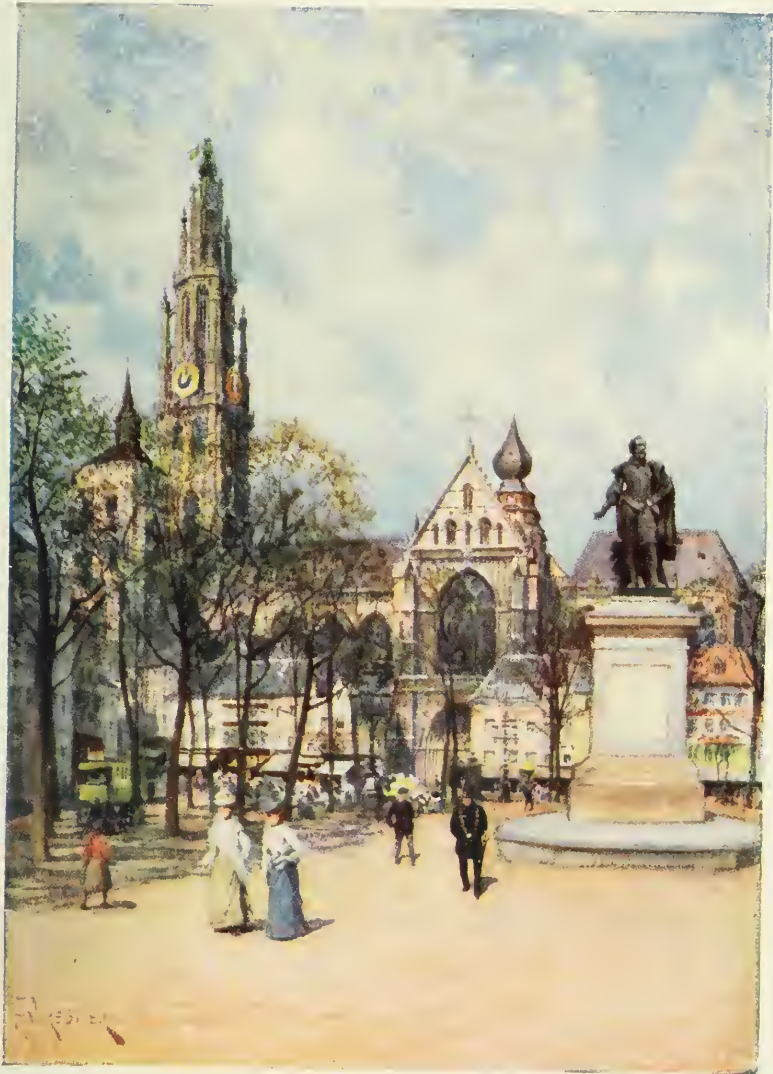
THE PLACE VERTE, ANTWERP