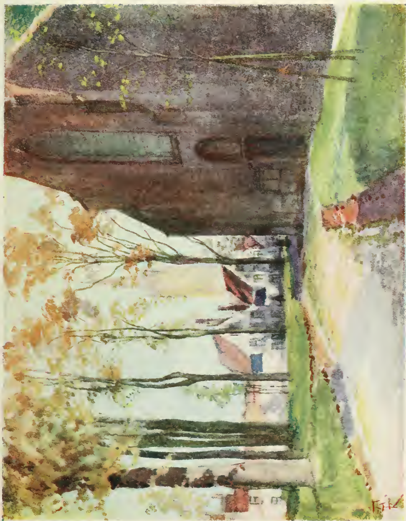
THE BEGUINAGE, BRUGES