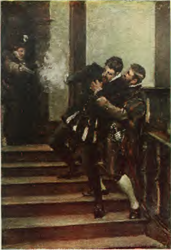
DEATH OF WILLIAM THE SILENT