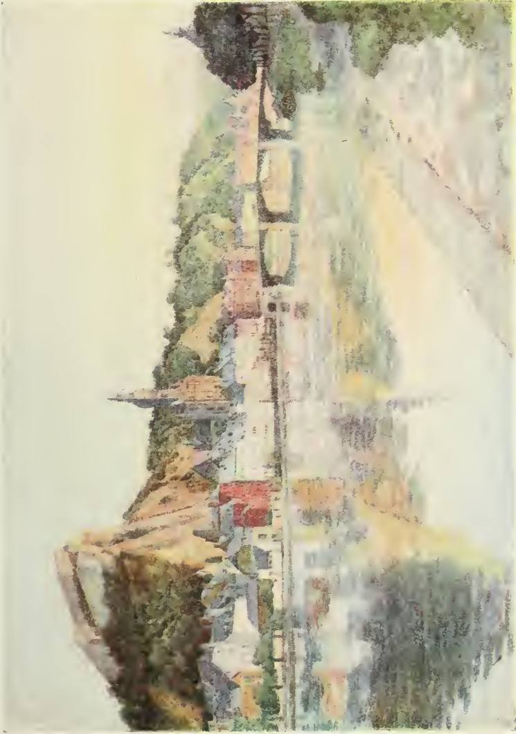
GENERAL VIEW OF DINANT