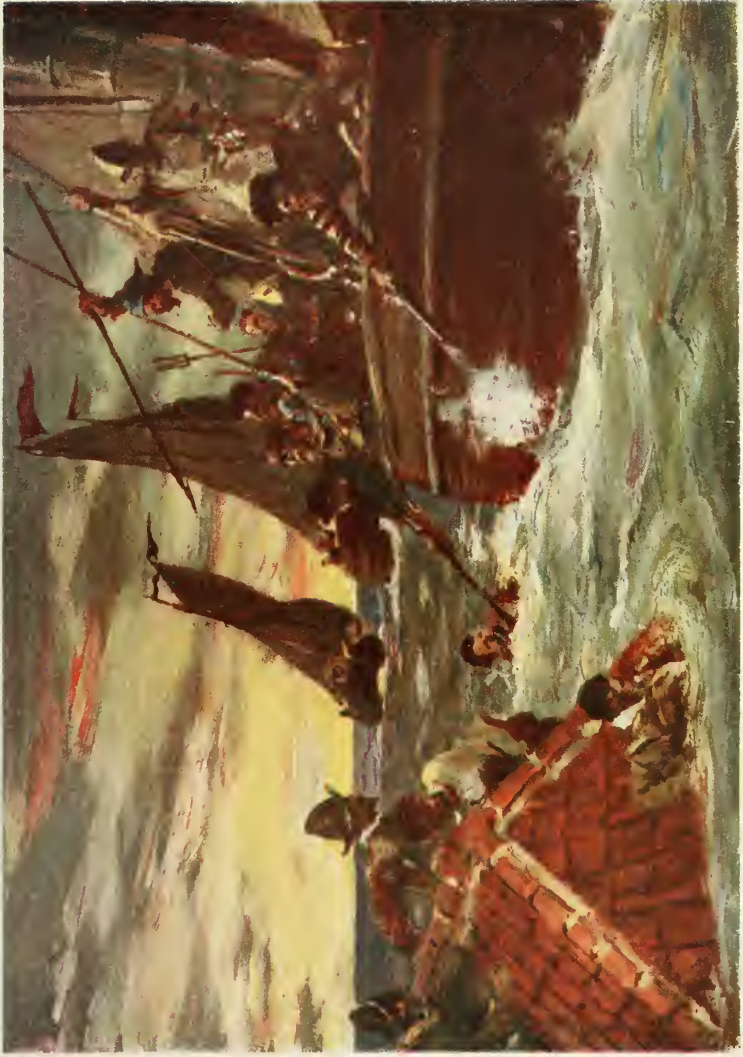
THE RELIEF OF LEYDEN