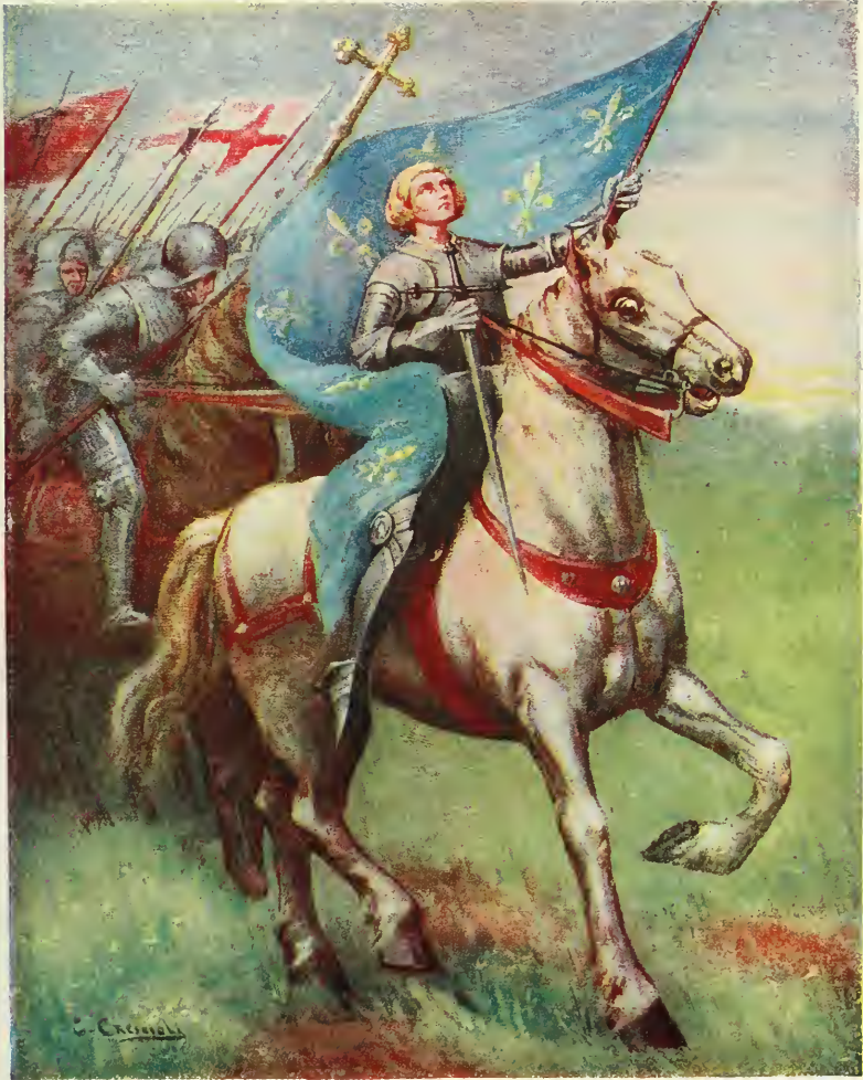
THE "MAID OF ORLEANS"