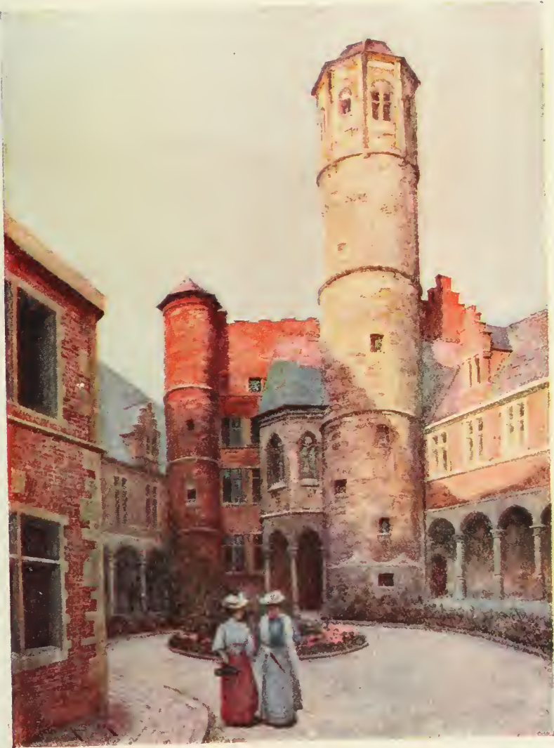
THE ARRIÈRE FAUCILLE, GHENT