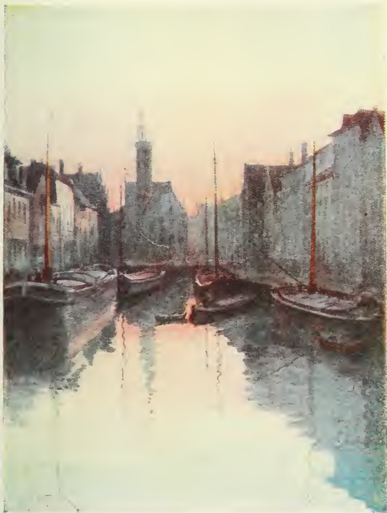
QUAI DU MIROIR, BRUGES