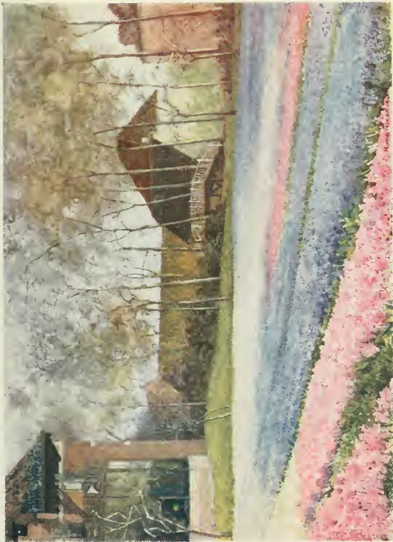
A DUTCH TULIP FARM IN SPRING