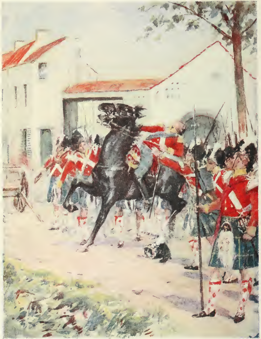
THE GORDONS AT QUATRE BRAS