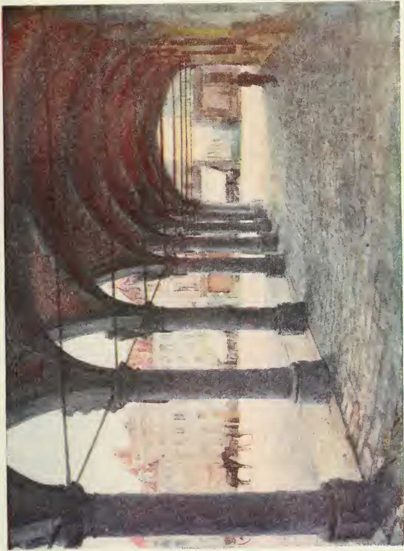
ARCADE UNDER THE NIEUWERK, YPRES