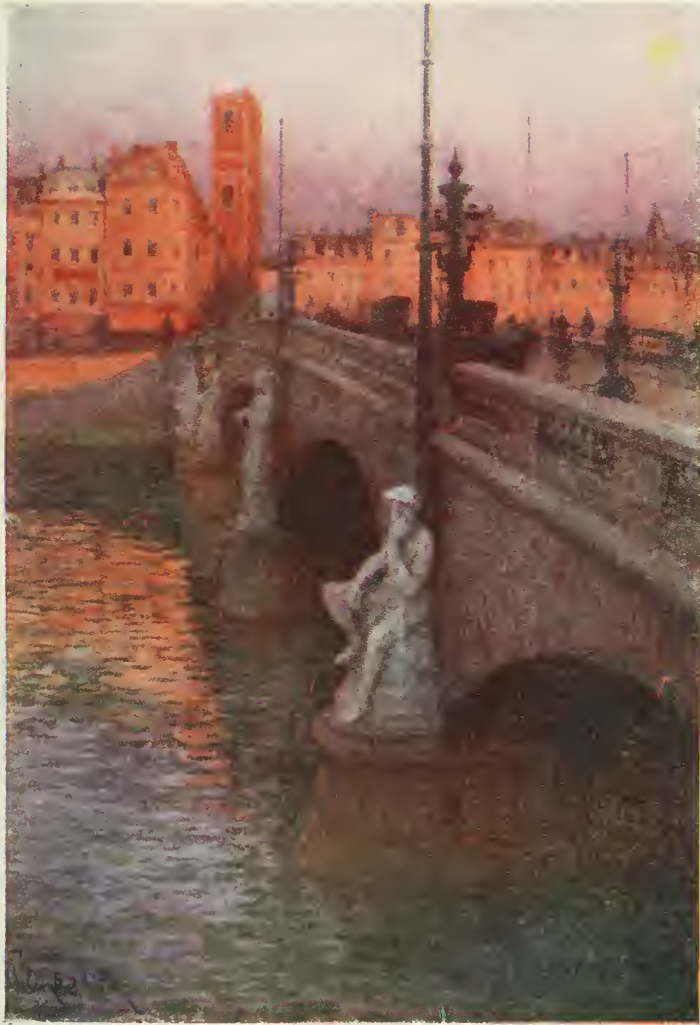
PONT DES ARCHES, LIEGE