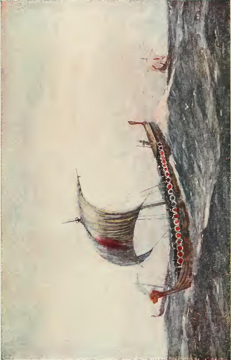
A VIKING SHIP