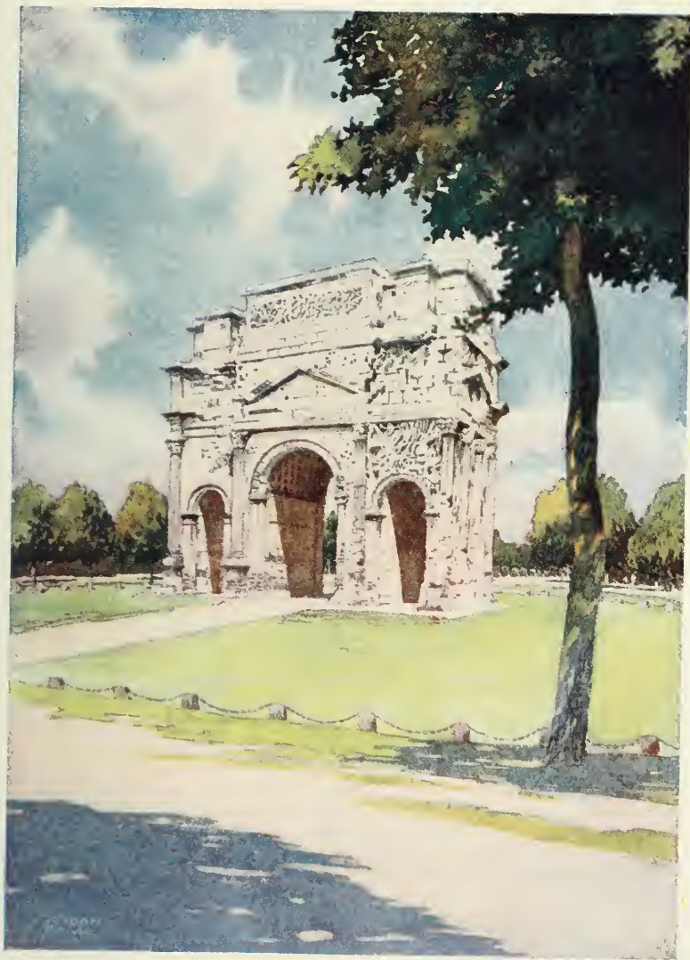
THE ROMAN ARCH AT ORANGE, IN THE SOUTH OF FRANCE This shows one of the beautiful buildings raised by the Romans when they were masters of Gaul