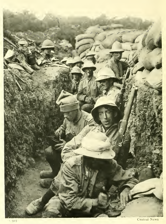
IN THE TRENCHES AT GALLIPOLI