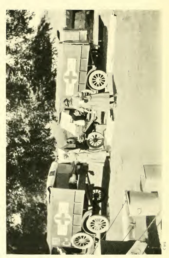
SCOTTISH WOMEN'S HOSPITALS' MOTOR AMBULANCES IN MACEDONIA