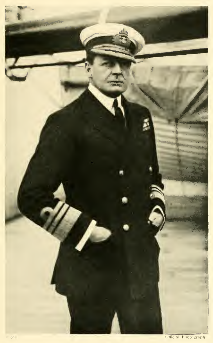
ADMIRAL SIR DAVID BEATTY