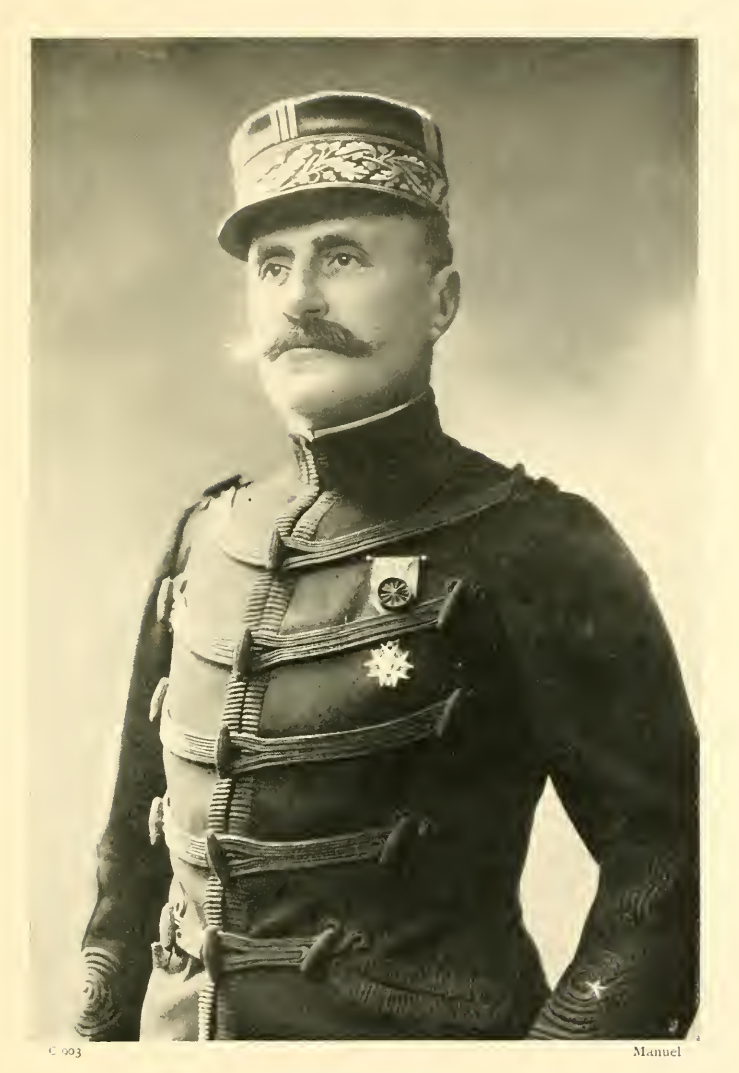
GENERAL FOCH Chief of the French General Staff