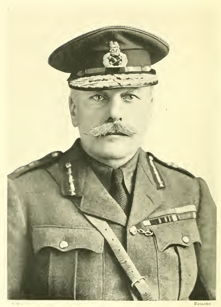
FIELD-MARSHAL SIR DOUGLAS HAIG Commander-in-Chief of the British Army in France and Flanders.