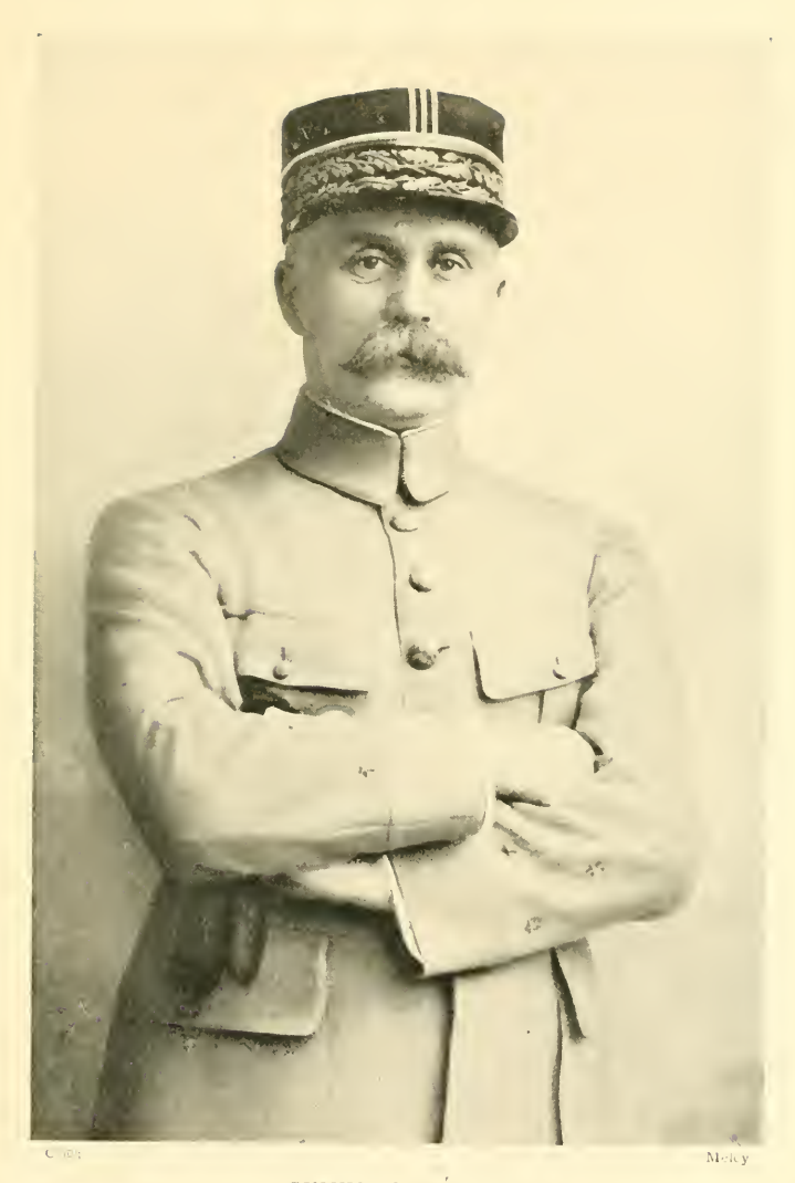
GENERAL PÉTAIN Commander in-Chief of the French Armies in France.