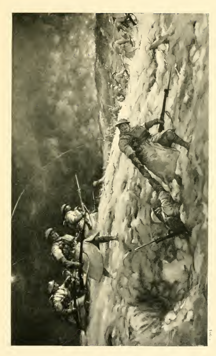
GORDON HIGHLANDERS IN A "BOGIE" RAID

The men wore white smocks over their kilts and tunics, and their steel helmets were painted white. (See pages 105-110.)