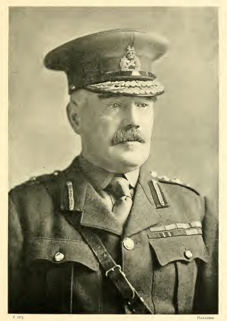
GENERAL ŞIR WILLIAM ROBERTSON