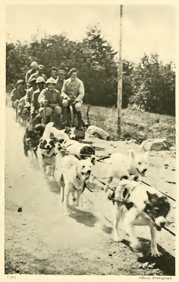
A DOG TEAM IN THE VOSGES MOUNTAINS Taking a relief party of soldiers to an outpost. (See page 197.)