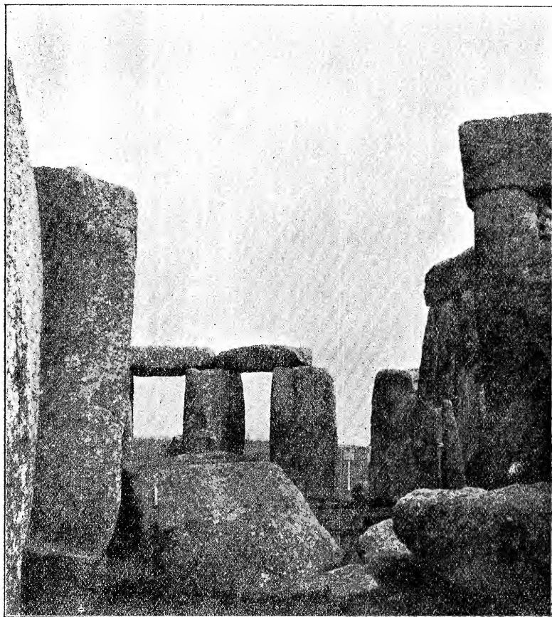
FIG. 2.—The stake placed on the fallen stone indicates the axis shown on Fig. 1, in relation to the leaning stone (on the left), and the centre of the N.E. trilithon.

and as the distance between it and its original companion is known both by the analogy of the two perfect trilithons and by the measure of the mortice holes on the lintel they formerly supported, we obtain by bisection the measure ( viz. 11 inches) from its edge of a point in