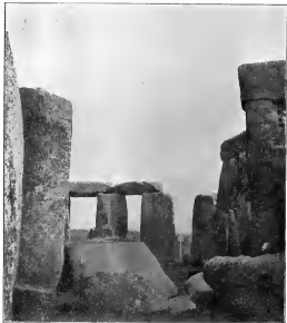
FIG. 2.—The stake placed on the fallen stone indicates the axis shown on Fig. 1, in relation to the leaning stone (on the left), and the centre of the S.E. trilitheon.