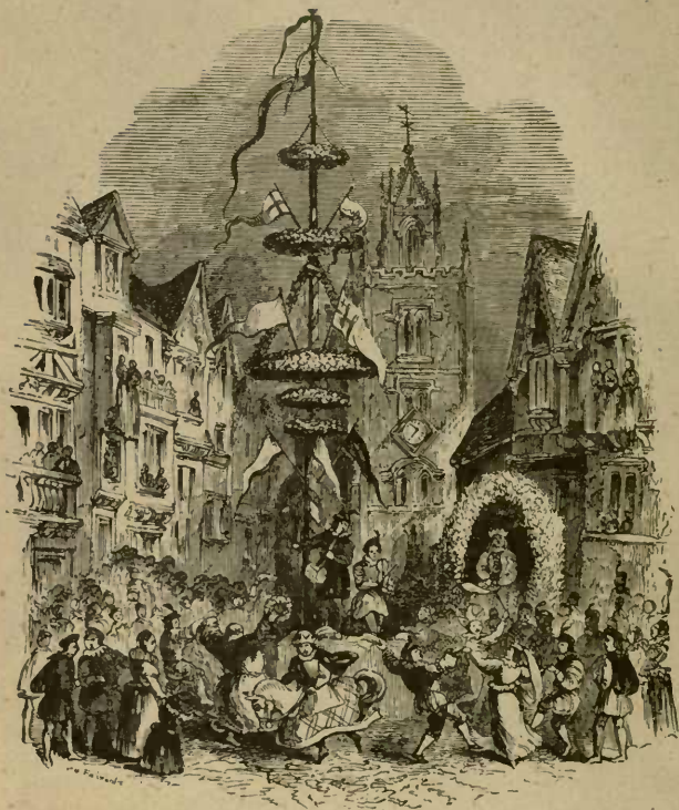
MAY-POLE BEFORE ST. ANDREW-UNDERSHAFT.