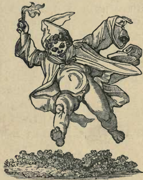
Alter et Idem.